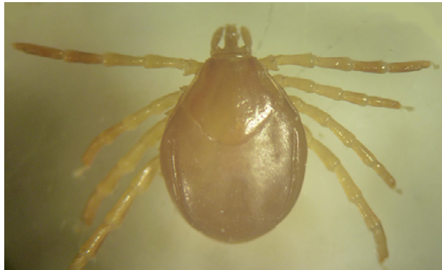
Kiwi tick (female), Ixodes anatis (Ixodidae).

inherent complexity of parasite life cycles, population thresholds below which extinction is inevitable are much lower than in most free-living species. Low host densities may therefore lead to the disappearance of parasites if transmission rates become too low. Kwak et al. (2020) developed a comprehensive set of guidelines aimed at understanding the importance of animal parasites as worthy of preservation, and suggestions as to how this might be achieved.