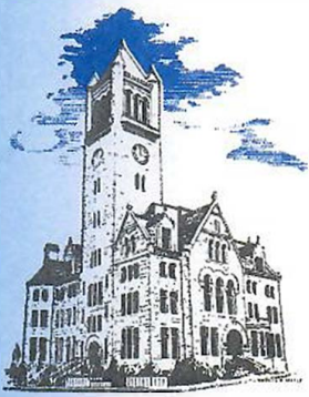
Fayette County Courthouse