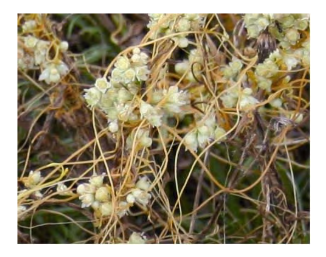
Figure 3. Dodder has white or cream flowers in clusters.

Dodder grows rapidly and can flower within two weeks of germination.