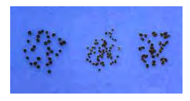
Figure 4. Dodder seed (centre) compared with subterranean clover seed (left) and lucerne seed (right).

Pasture seed infested with dodder is an important source of new infestations. Because of their similar size, dodder seed is very difficult to remove from lucerne and small clover seeds. It is therefore essential to use certified pasture seed.