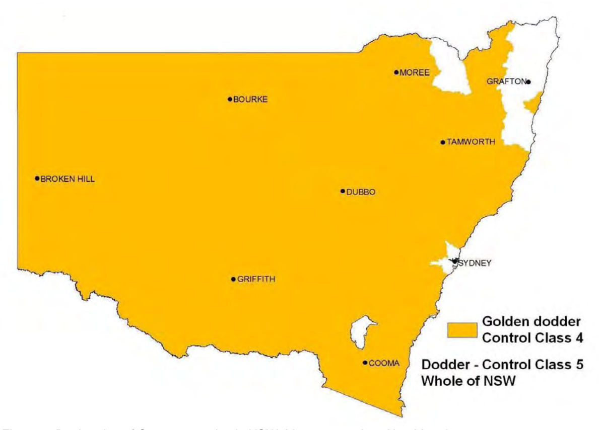
Figure 6. Declaration of Cuscata species in NSW. Map preparation: Alan Maguire

While dodder cannot complete its lifecycle on cereal crops, it may do so on the broadleaf weeds that invade these crops. The advantage of a crop rotation for dodder control is lost if host weeds occur