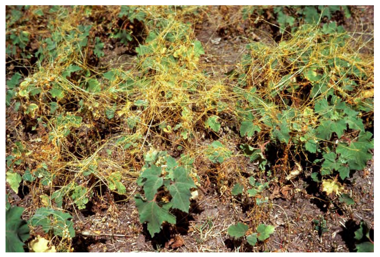
Figure 2. Golden dodder growing on Noogoora burr. Golden dodder has bright yellow thread-like stems.