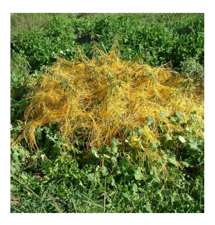
Figure 1. Golden dodder growing in a cropping situation.

Dodder requires a suitable host species to survive. Hosts include a wide range of broadleaf weeds, lucerne and some vegetables. Many weed species and tree seedlings are also suitable hosts, allowing dodder to build up in areas where weeds are not controlled due to difficult access.