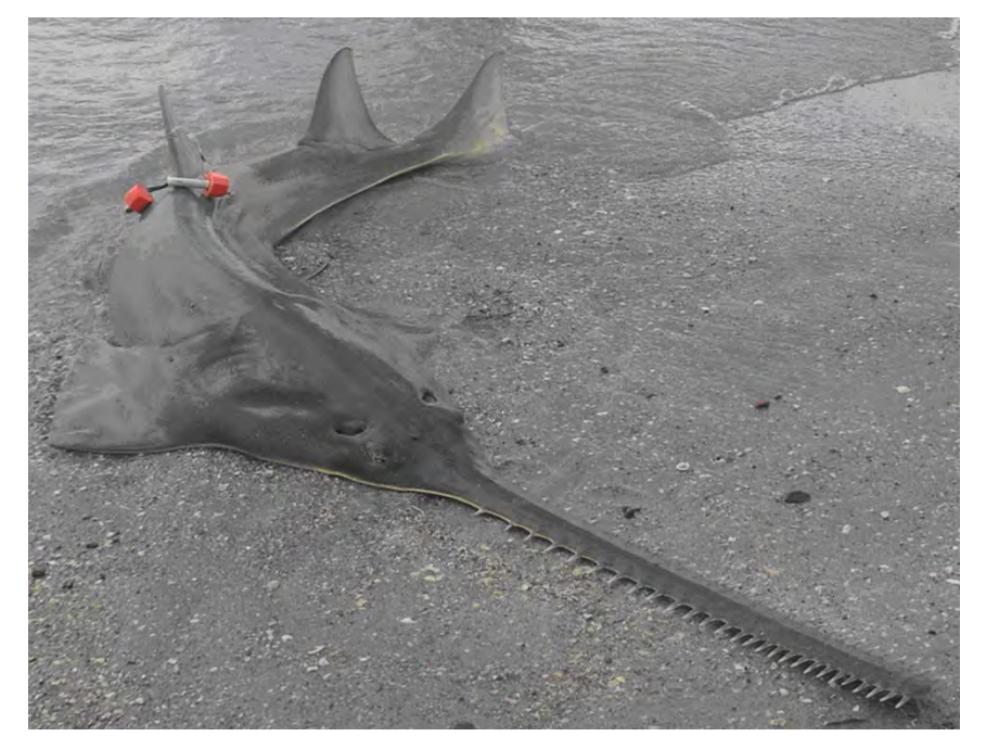
Figure 3: A Green Sawfish tagged with a radio tracking device