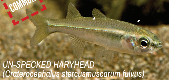
UN-SPECKED HARDYHEAD ( Craterocephalus stercusmuscarum fulvus )