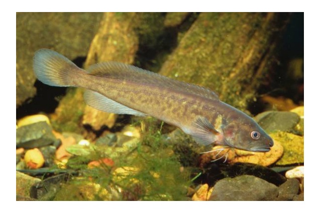
Figure 2: River Blackfish is a benthic dwelling carnivore