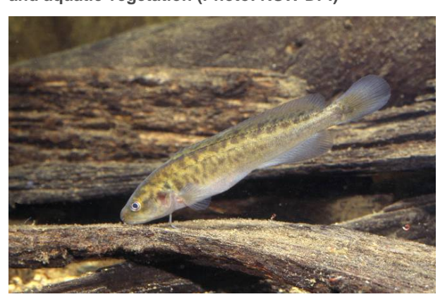
Figure 3: River Blackfish prefer habitats with good instream cover such as woody debris, boulders and aquatic vegetation

Koster, W. M. and D. A. Crook (2008). "Diurnal and nocturnal movements of river blackfish (Gadopsis marmoratus) in a south-eastern Australian upland stream." Ecology of Freshwater Fish 17(1): 146-154.