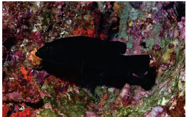
Figures 3 and 4: A juvenile (above) and a mature (below) Black Rockcod.

See Species Protection Contact the NSW DPI Threatened Species Unit: Port Stephens Fisheries Institute Locked Bag 1 Nelson Bay NSW 2315 fisheries.threatenedspecies@dpi.nsw.gov.au