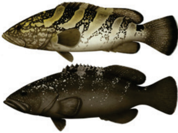
Figure 2: Black Rockcod