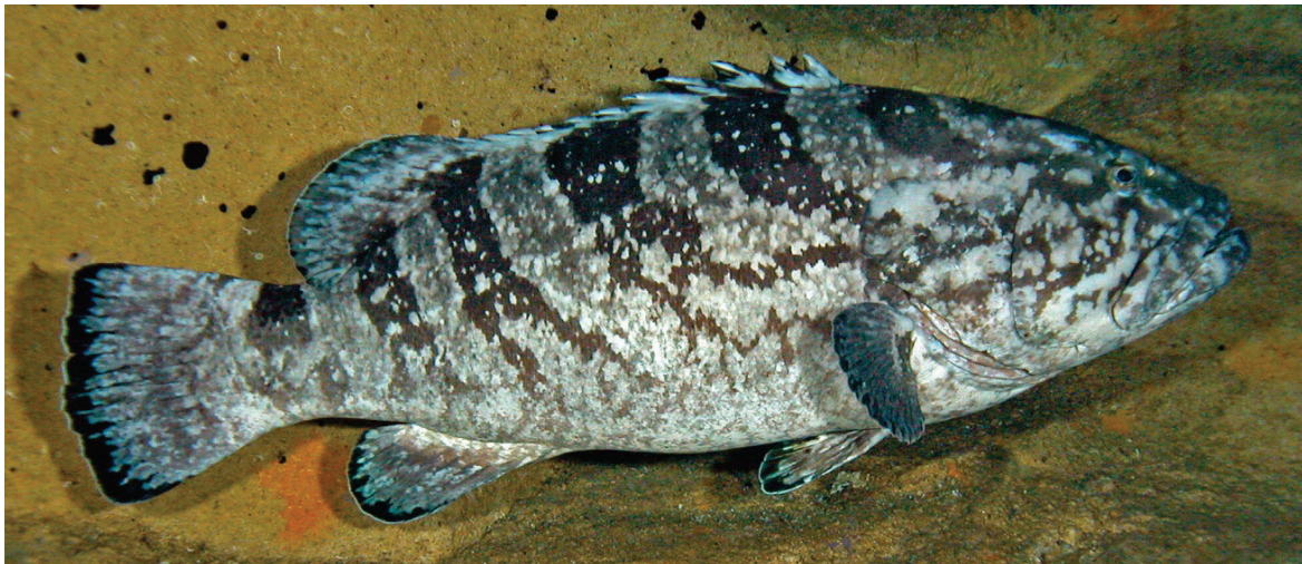
Figure 1: A Black Rockcod

Aquatic Ecosystems Unit, Port Stephens Fisheries Institute