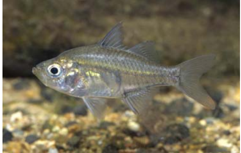
Figure 3: Olive Perchlet