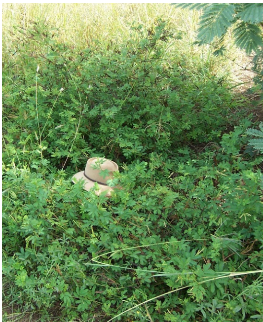
Figure 1. Desmanthus cv. Marc grows to 0.6 m. (Tamworth, NSW).

Desmanthus ( Desmanthus spp.) is a non-bloating tropical legume providing high quality feed for cattle and sheep. It is native to northern America, Central and South America and the Caribbean and commonly used as a companion legume in tropical perennial grass pastures. Being a tropical legume, it grows during the warmer months of the year (Figure 1).