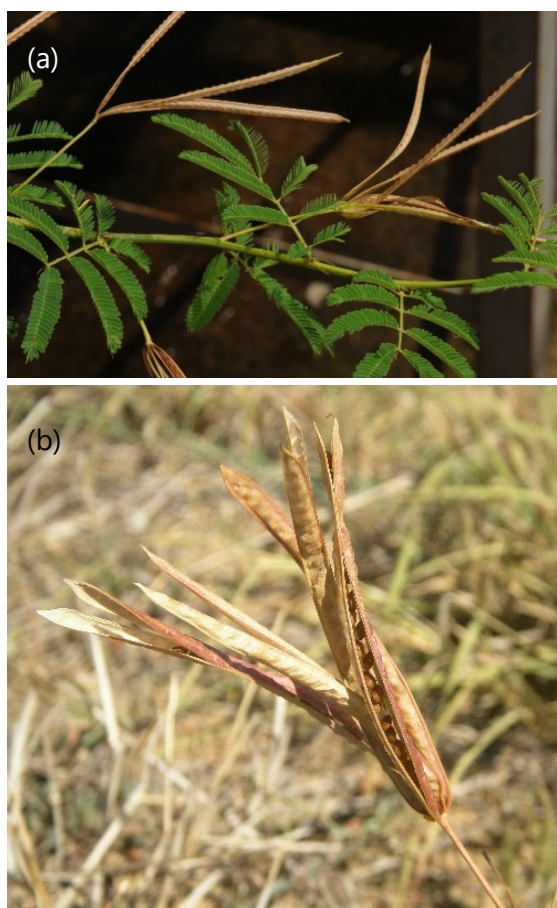
Figure 9. Desmanthus is a prolific seeder. (a) Pods are initially green, turning brown as they ripen. (b) Once ripe, the pod splits into two halves allowing seed to drop to the soil surface.

Stems of some cultivars can become woody if they are not grazed or when frosted. These stems protect the regenerating buds in spring. Slashing frosted stems can damage plant crowns leading to plant death.