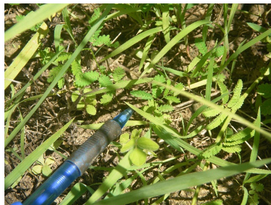
Figure 8. Desmanthus seedlings emerging from the seed bank following significant summer rainfall.

Individual plants will commonly persist for 3–4 years. For long term persistence of a desmanthus stand, seedling recruitment is required every 1–2 years (Figure 8). This will allow a large seed bank to be maintained with seed at different stages of hardseed breakdown.