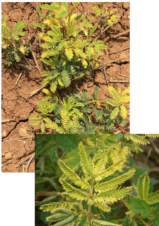
Figure 10. Desmanthus is a reported host of alfalfa mosaic virus (AMV). Symptoms of AMV include leaf yellowing and productivity losses in cv. Marc.

The susceptibility of the other cultivars is currently being tested.