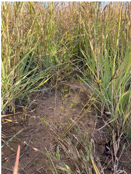
Figure 5. Sowing into an established tropical grass pasture will result in poor establishment and stunted desmanthus plants. Studies are underway to develop strategies to improve establishment in these situations.

recommended due to high competition from the mature plants (Figure 5). Without control of the summer grass pasture prior to sowing desmanthus the likelihood of successful establishment is low. Research is underway to develop strategies to establish desmanthus into established and native pastures.