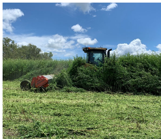
Figure 2. Desmanthus cv. JCU 4 can grow to 3 m under ideal conditions. This stand was grown under centre pivot irrigation at Townsville, Queensland.

Ray desmanthus ® – Mid-flowering cultivar (42 days later than cv. Marc in Brisbane) of D. virgatus with upright growth habit to 1–1.5 m tall with fine stems. For more information: Barenbrug Australia // Forage & Pasture > Tropical > Tropical Legumes