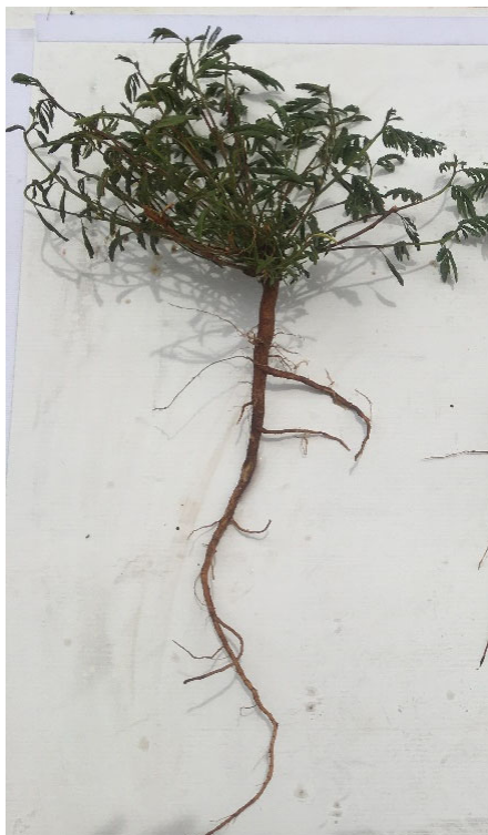
Figure 6. Desmanthus plants are deep rooted. The root pictured was about 0.8 m long.

grazed short. Leaving at least 10 cm residual assist rapid regrowth, even more so following a good summer rainfall event.