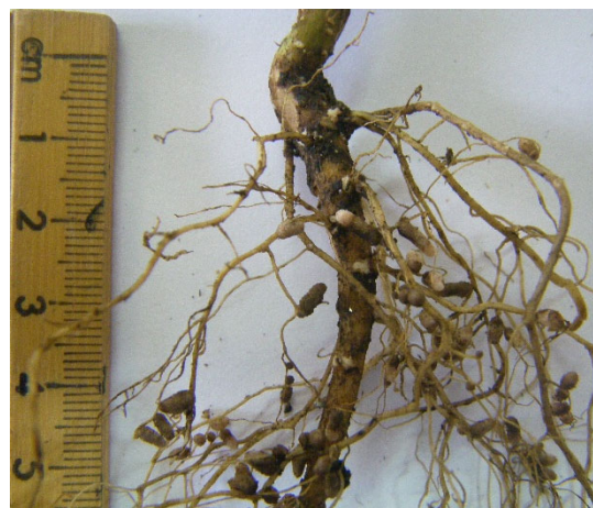
Figure 4. Nodules of CB3126 are located along the lateral roots and easily dislodged when removing plants to check nodulation.

Neptunia sp. is a legume that is closely related to desmanthus. Inoculation with the commercial rhizobia strain is cheap insurance (Figure 4).