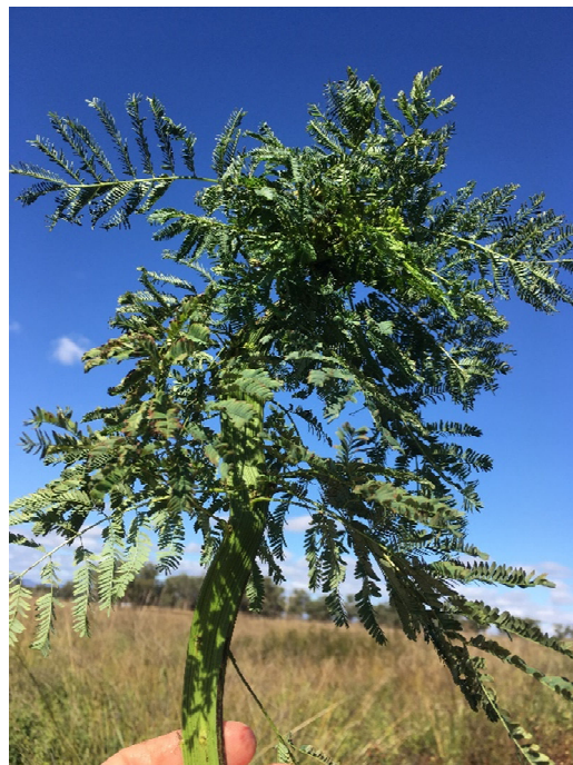
Figure 11. Herbicide 2,4-D causes plant stems and growth of mature plants to become distorted.

Desmanthus seedlings are susceptible to 2,4-D, 2,4-DB, dicamba, MCPA and MCPB and are not recommended for use. They can also affect mature plants (Figure 11).