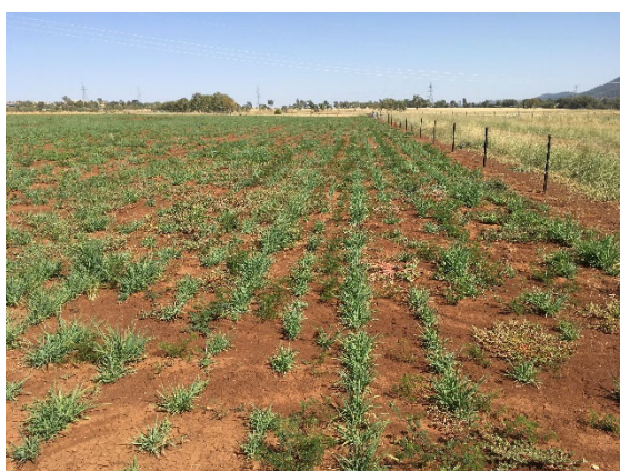
Figure 3. An establishing stand of desmanthus and digit grass sown in alternate rows.

Sowing rate. Sow 2–3 kg/ha (pure swards) or 2 kg/ha (mixtures) of germinable seed (Figure 3).