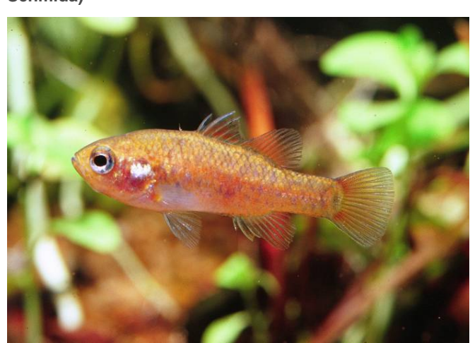
Figure 3: Southern Pygmy Perch