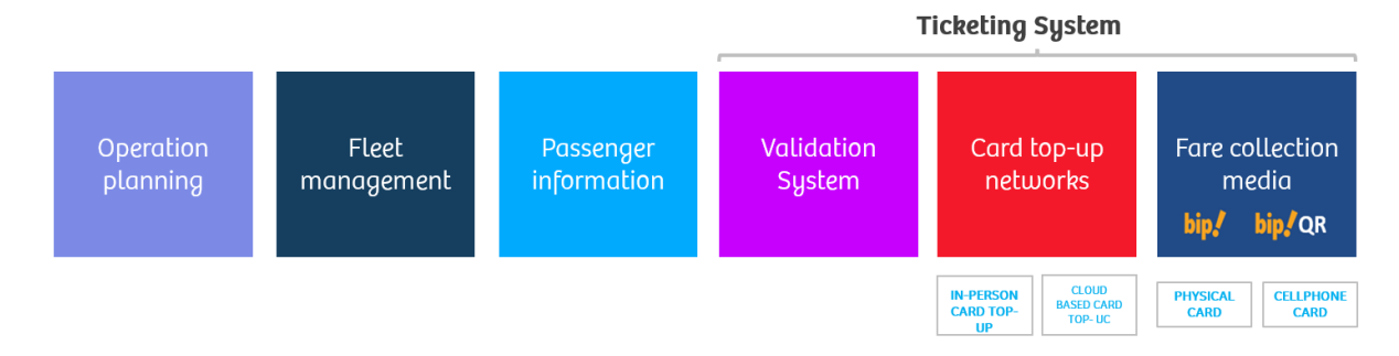
Figure 3: Complementary services

The complementary services and the companies that provide these services<sup>2</sup> are as follows: