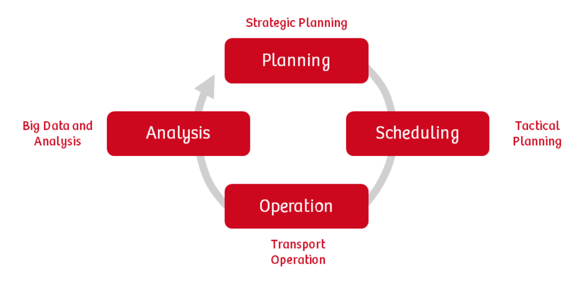
Figure 4: Transport processes

The four main transport processes are as follows in Figure 4: