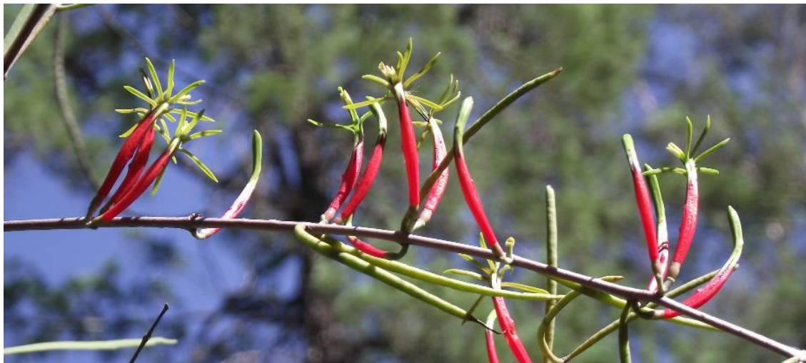
Harlequin Mistletoe Lysiana exocarp subsp. tenuis Drilliarrina State Conservation Area