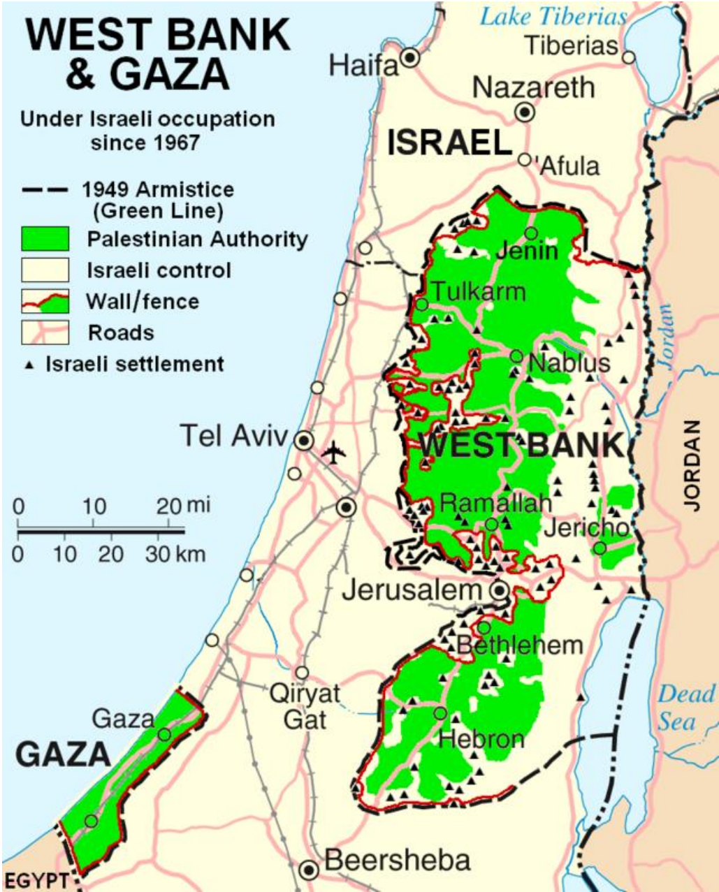
Figure 3 West Bank and Gaza under Israel Occupation 2007