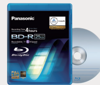
Single sided / Single Layer 25GB BD-R LM-BRU25MAE 1-6x speed