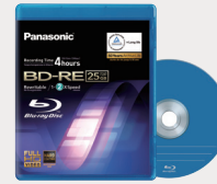
Single sided / Single Layer 25GB BD-RE LM-BEU25AE (2 pack) LM-BEU25AE2 (2 pack) LM-BEU25AE3 (3 pack)