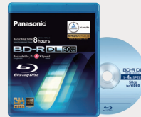
Single sided / Dual Layer 50GB BD-R LM-BRU50LAE 1-4x speed