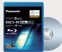
Single sided / Dual Layer 50GB BD-R LM-BRU50MAE 1-6x speed