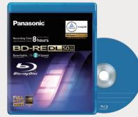
Single sided / Dual Layer 50GB BD-RE LM-BEU50AE 1-2x speed