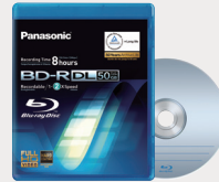
Single sided / Dual Layer 50GB BD-R LM-BRU50AE (2 pack) LM-BRU50AE2 (2 pack)