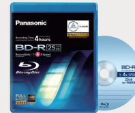
Single sided / Single Layer 25GB BD-R LM-BRU25LAE (3 pack) LM-BRU25LAE3 (3 pack)