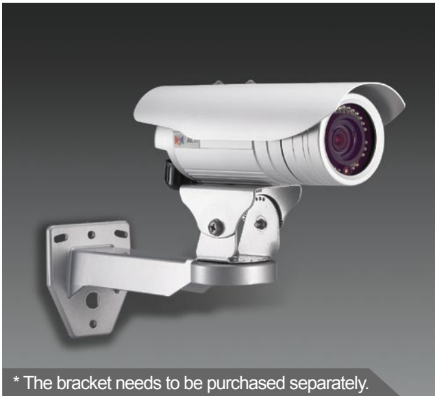
* The bracket needs to be purchased separately.