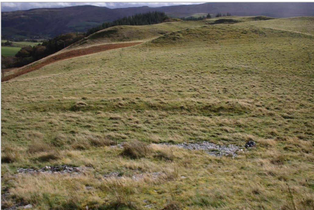
PRN 42159 NANT CRAFANGLACH, Ceredigion. This pillow mound measures 20m long and 6m wide. Unusually the mound is quite high at 0.80m.