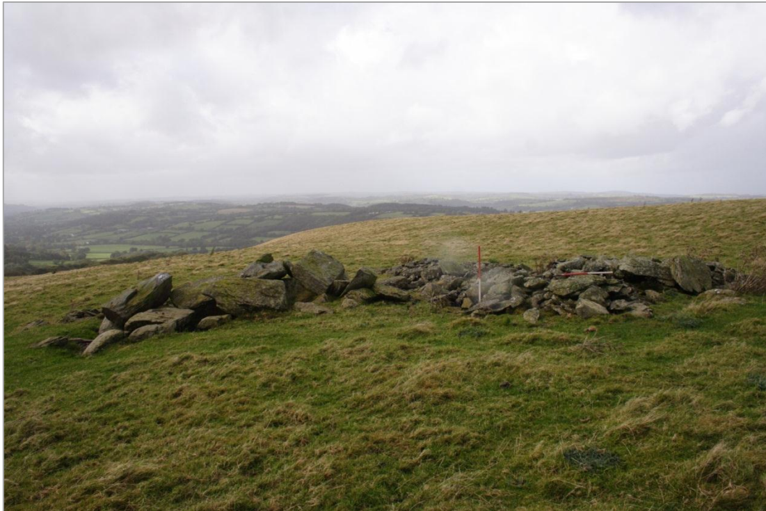
BRYN CYSEGRFAN 2012. Nearly all the pillow mounds were bulldozed flat during land improvement work in the late 1970's and the stone slabs used to construct the internal passages and nesting places within the mounds are now in neat piles by the edge of the field.