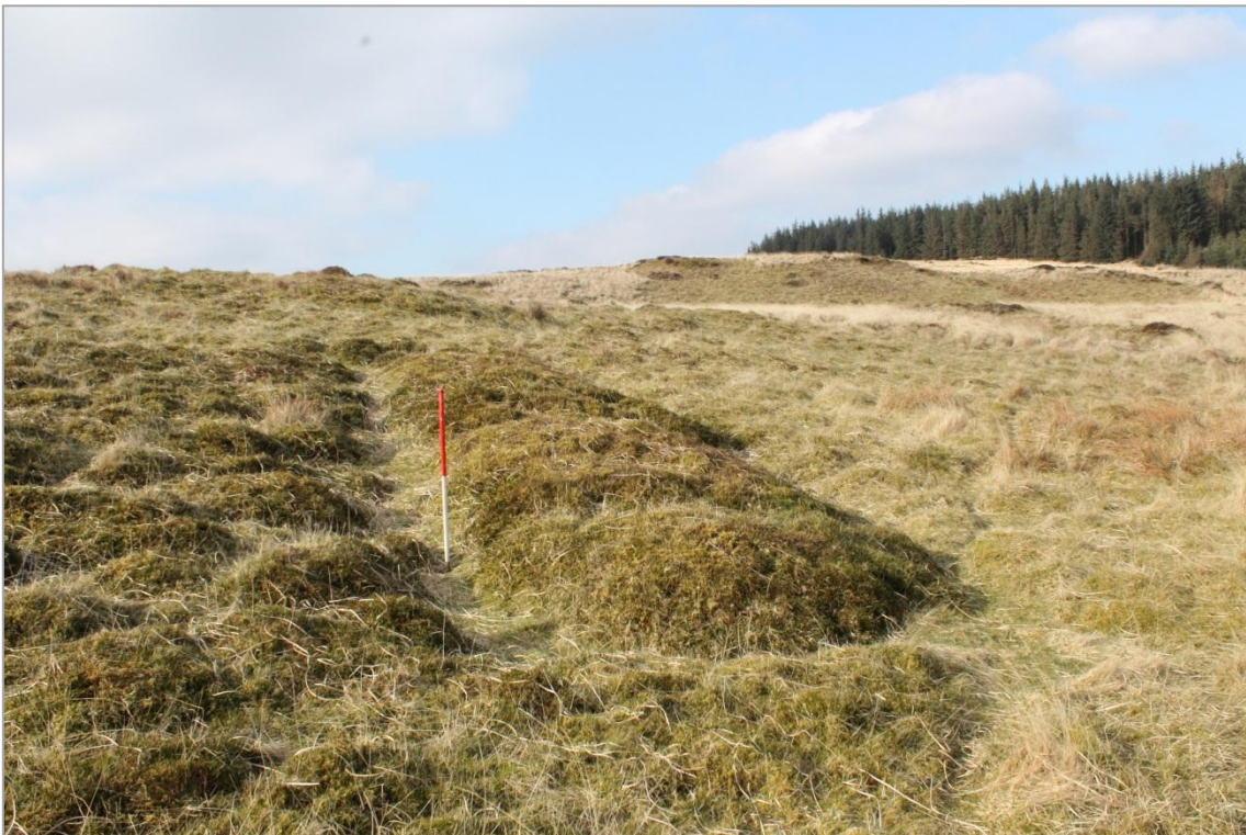
PRN 105415 PEN RHIWIAR, Carmarthenshire. A good example of a typical pillow mound. This is one of a group of four sited close together on high open moorland to the north east of the Gwenffrwd valley, Carmarthenshire.

Rabbits do not thrive in damp conditions and need well drained soil to live in. The ditch surrounding the mound would have helped to keep the burrows dry and positioning the mounds perpendicular to the slope would also have aided this.