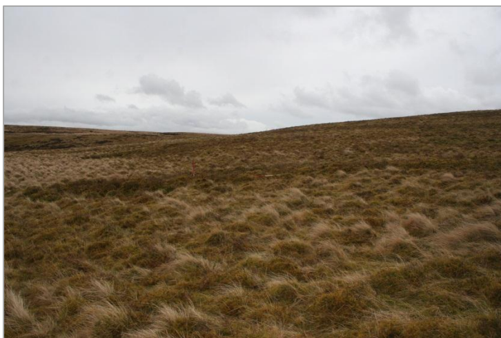
PRN 13546 MYNYDD MALLAEN Looking south at the pillow mound seen in the foreground of the aerial photograph above. The E-W mound is slightly curved, and measures c. 20m long and 2.5m at its widest. There are shallow ditches visible flanking the long sides but not at the ends. The southern ditch is more pronounced and has reeds growing in it.