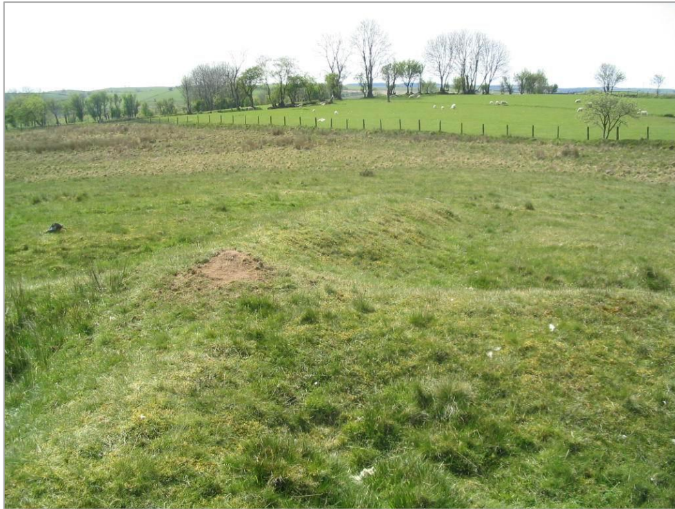
PRN 105471 TYNLLWYN, Ceredigion. A cross-shaped pillow mound built in a slightly elevated position in otherwise boggy ground. situated northeast of Blaenyorfa farm, Ceredigion.