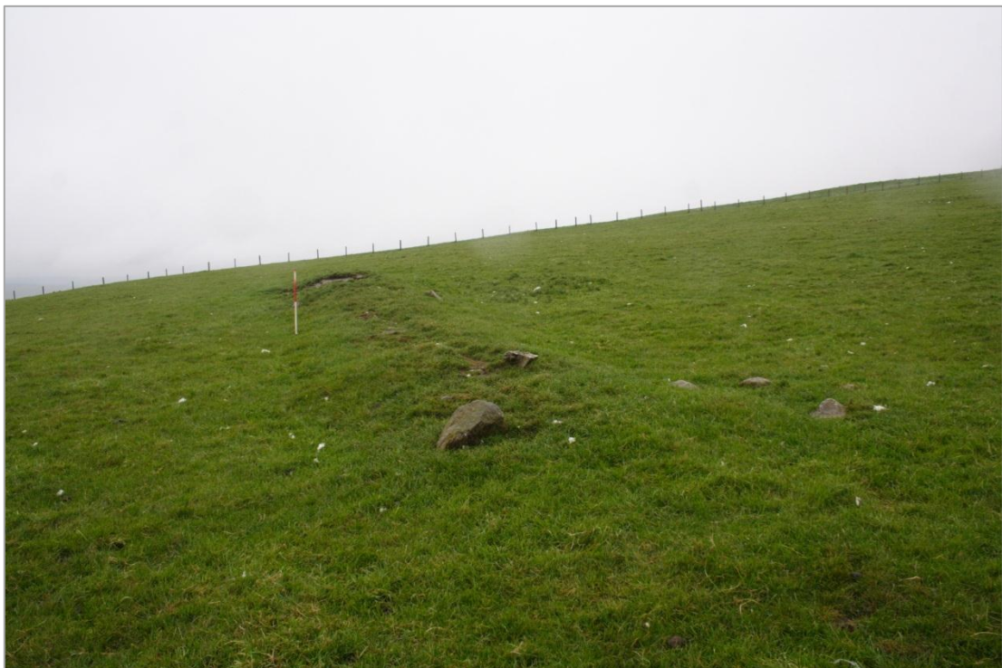
PRN 105396 MYNYDD MELYN, Pembrokeshire. A long cigar-shaped pillow mound. The top photograph shows the internal stone structure of the mound revealed by a sheep scrape.