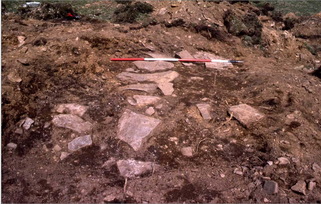
BRYN CYSEGRFAN, Ceredigion. A photograph taken in May 1978 showing the arrangement of stone slabs within a pillow mound. This pillow mound was later bulldozed flat.

from slabs of stone within the mounds. The group of over 30 pillow mounds were surveyed, with some excavation, in advance of agricultural improvement.