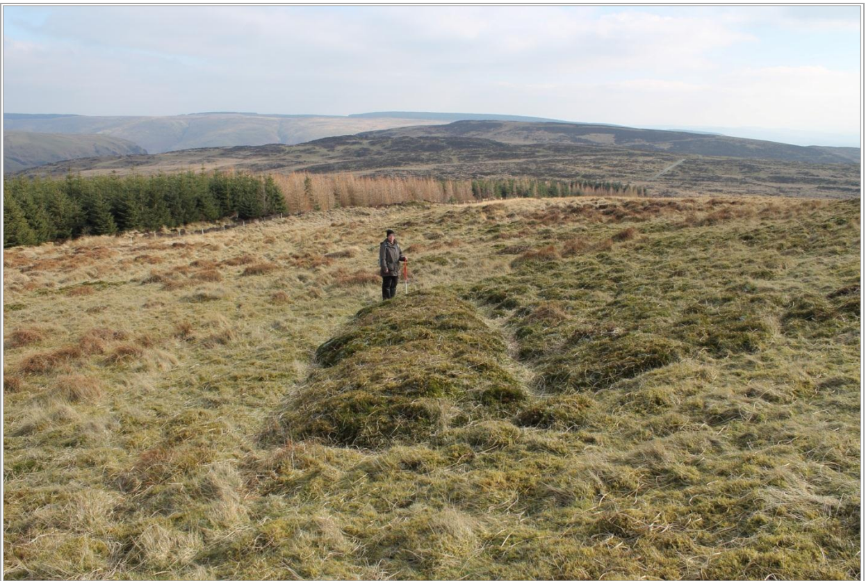
PRN 105415 One of a group of 4 pillow mounds on high open moorland, near, Rhandirmwyn, Carmarthenshire.