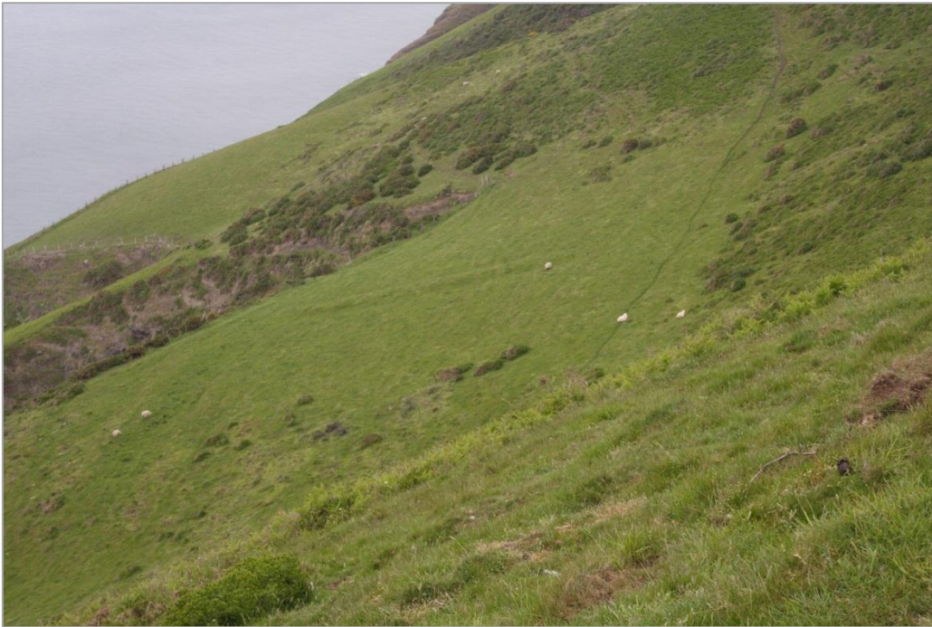
PRN 31439 PEN Y GRAIG, Ceredigion. Two pillow mounds that lie at right angles to each other. Located at the foot of a northwest facing slope on a natural terrace near the cliff edge.