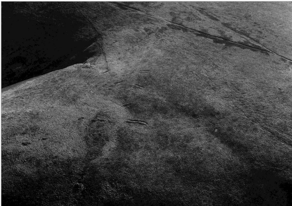
PRN 13546 & 105390/4 MYNYDD MALLAEN, Carmarthenshire. A group of 6 pillow mounds on high unenclosed moorland at 380m above sea level.

Smaller pillow mound groups have survived particularly on high upland areas. On a high northeast facing slope of Mynydd Mallaen, Carmarthenshire is a group of 6 linear pillow mounds (PRN 13546 & 105390-4), that can be seen in the aerial photograph below. They range in length from 20m to 10m.