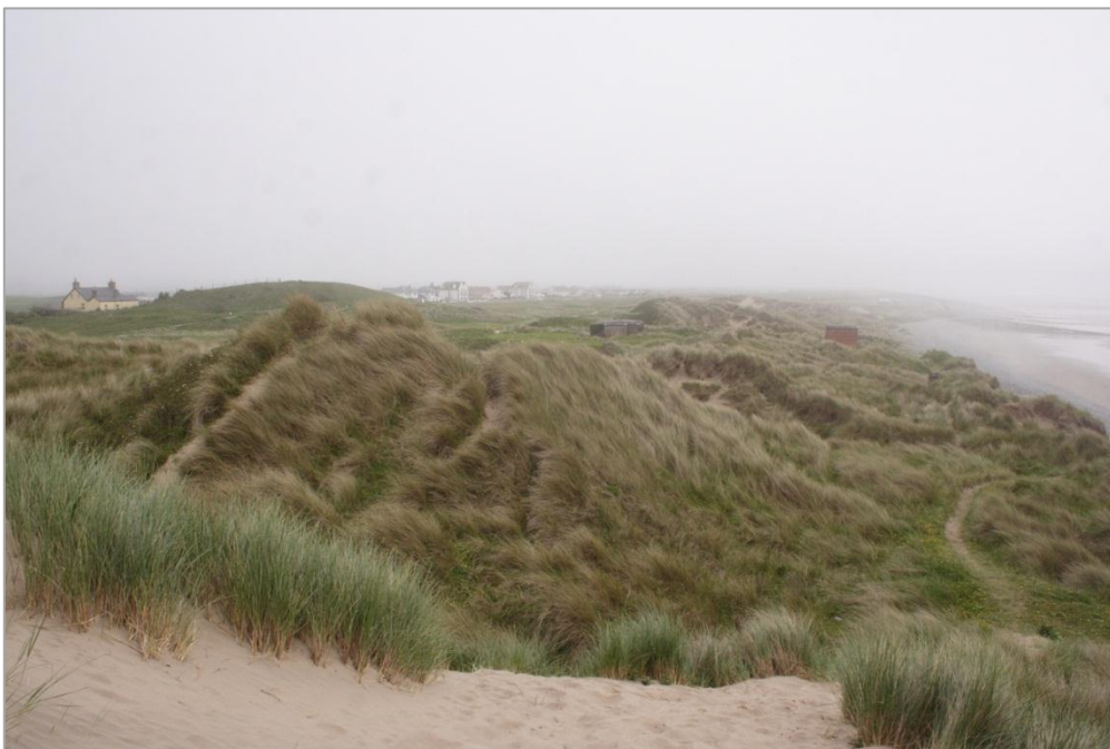
PRN 105401 YNYSLAS WARREN, Ceredigion. Twyni Mawr sand dunes, Ynyslas is recorded as a breeding place for rabbits in the post-medieval period