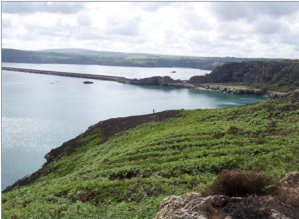
PRN 32100 THE WARREN, Pembrokeshire. Taken in 2004 a few months after the vegetation had been burnt off, this photograph shows a set of seven pillow mounds lying near the cliff edge. Map evidence suggests a date between 1845 and 1867, and the sharp profile of the mounds supports a relatively recent date.