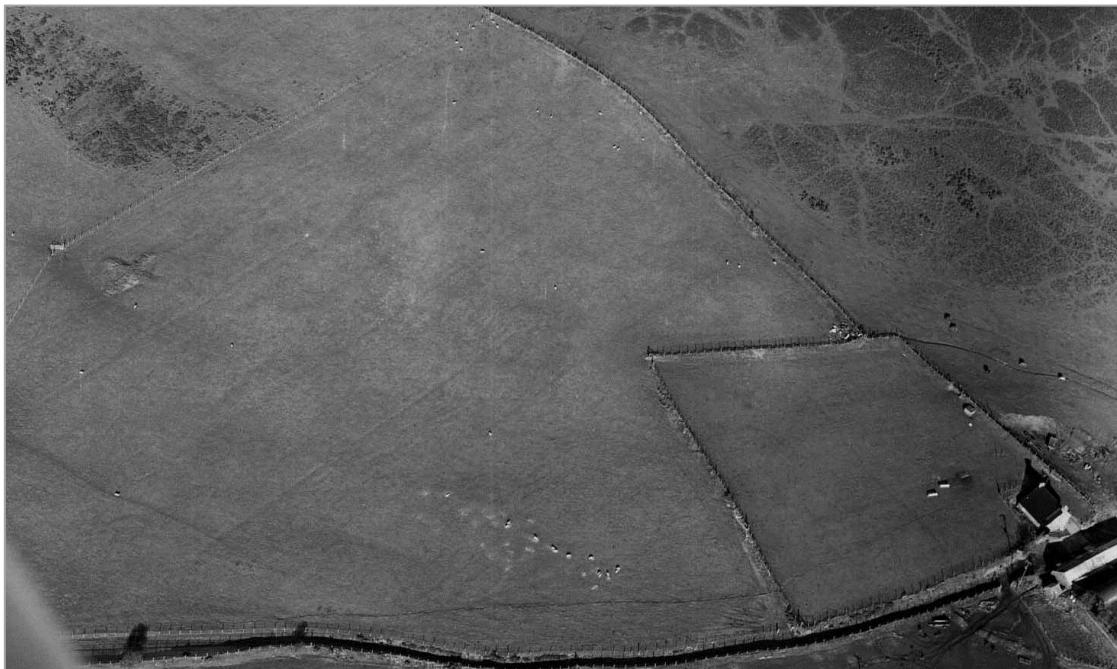
PRN 11327 GERNOS FACH A cross shaped pillow mound situated on a gentle south west facing slope 250m NW of Gernos fach farm, Preseli. The top photograph shows the site visit in 2012 and the lower photograph is an aerial photograph taken by DAT in the 1980's – the cross-shaped mound can be seen on the left hand side (DAT AP85/33.17).