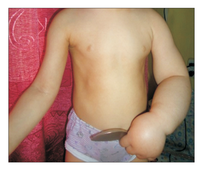
Fig. 1. Lymph edema of left upper extremity.

At the time of admission, the patient was conscious and her vital signs were within normal limits. Her height was 94 cm (90th centile according to the Center for Disease Control and Prevention [CDC] growth chart) and weight was 14 kg (between 75th–90th centile per the CDC growth chart). She had significant left-arm edema (without pain), limitation of motion, and difficulty with arm movement (Fig. 1). The circumferences of right and left arms were as