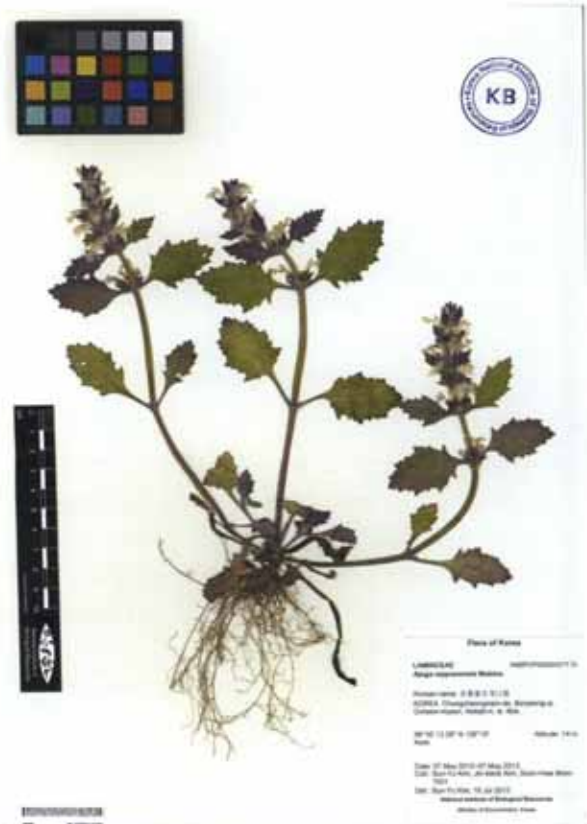
Fig. 2. Voucher specimen of Ajuga nipponensis Makino in Korea.

Ajuga nipponensis Makino, Bot. Mag. (Tokyo) 23: 67. 1909. Figs. 1-2.