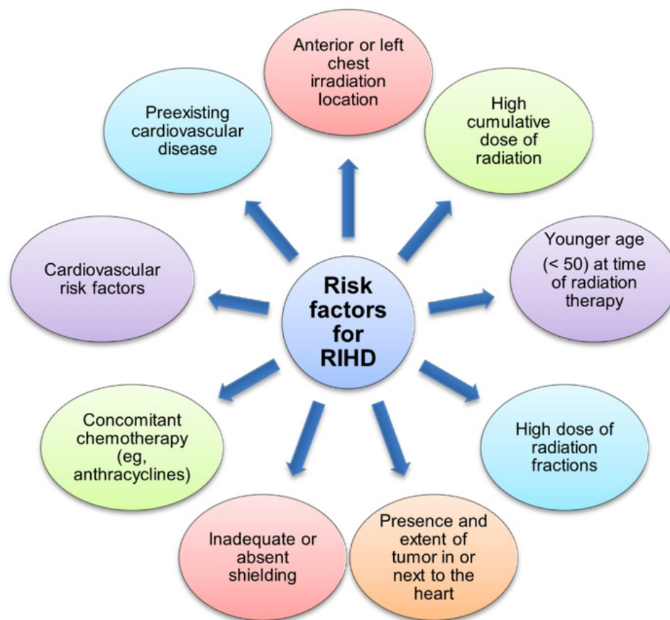
Fig. 1. Schematic diagram illustrating the risk factors for radiation-induced heart disease (RIHD).

The irradiated heart volume is the major risk factor for the development of RIHD [55]. Patients with breast cancer who had the highest doses and volumes of radiation to the heart had a threefold greater risk of cardiac death than those who underwent surgery alone after a mean follow-up of 16 years [4]. The same study has