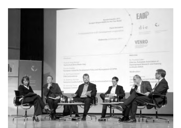
Bonner Impulse event, Bonn, 20 February 2013

An event for PhD students organised in cooperation with EADI was the ISS Development Dialogue on "Bridging Voices" at the International Institute of Social Studies in The Hague on 10/11 October. On 9 November 2013 a UEL International Development Society Undergraduate Conference entitled "Development in an Unequal World: Is there a Path to Global Equality? was held in