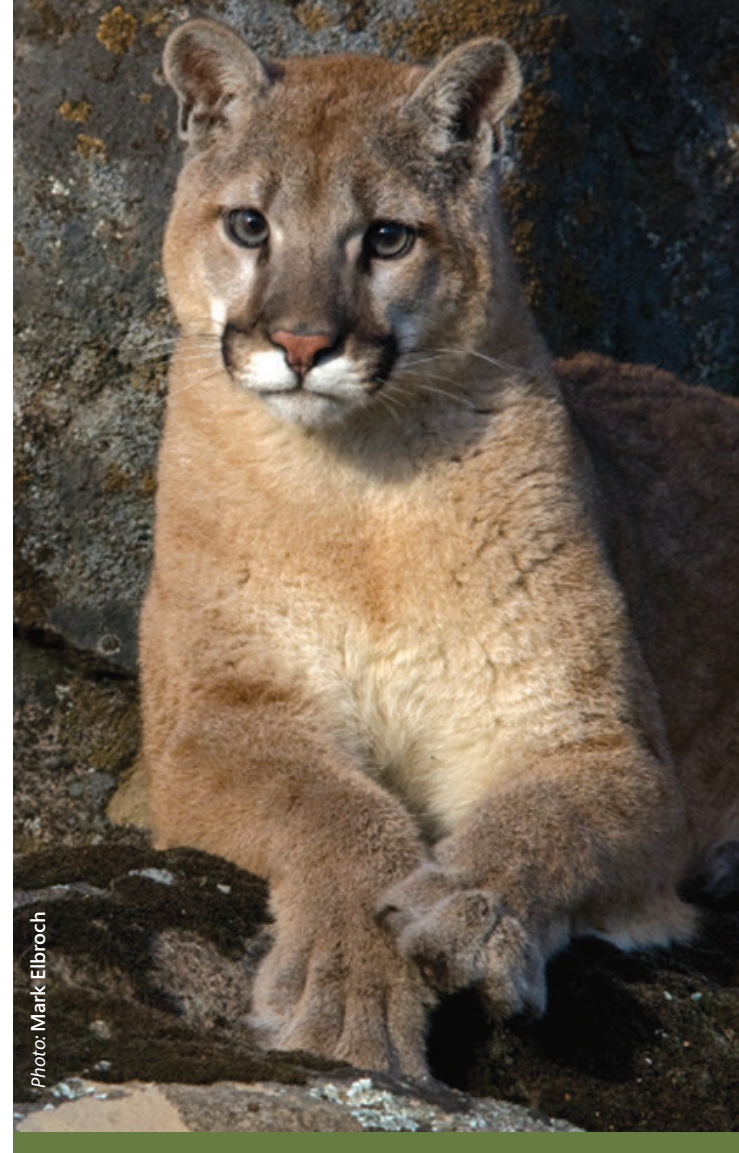
Learn about mountain lion ecology, behavior, signs, and safety tips.