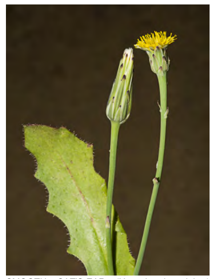
SMOOTH CAT'S-EAR (Hypochaeris glabra) Naturalized Annual - Sunflower Family -(Mar-Jun) - Common. Disturbed areas, grassland, open woodland - Plant 4-24" tall, smooth. Rays 0.2-0.3" long, barely > head bracts. Only inner fruit beaked. INVASIVE.