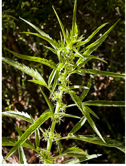
DURANGO ROOT (Datisca glomerata) Native Perennial - Datisca Family - (May–Jul) - Dry streambeds or washes - Stem 3.3-6.6' tall. Leaves ~ 6" long, lance-shaped, alternate above, opposite/whorled below. Flowers small with no petals.