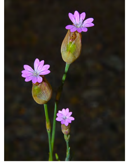
HAIRY PINK (Petrorhagia dubia) Naturalized Annual - Pink Family - (Spring-early summer) -Disturbed areas, woodland savanna - Plant 4-24" tall. Leaf blades 0.4-2.4" long. Petals pink, 0.4-0.55" long, rounded or 2-lobed, with 5-6 dark veins.