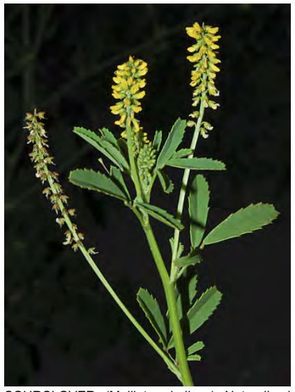
SOURCLOVER (Melilotus indicus) Naturalized Annual-Biennial - Pea Family - (Apr-Oct) - Open, disturbed areas - Stem 4-24" long. Leaflets 3, 0.4-1" long. Flowers yellow, ~0.1" long.