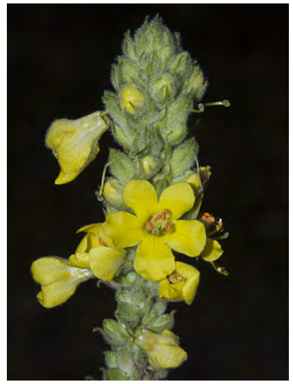
WOOLLY MULLEIN (Verbascum thapsus) Naturalized Biennial - Snapdragon Family -(May–Sep) - Roadsides, streambanks, disturbed areas - Plant woolly It-green. Stem 1-6.6' tall. Leaves 2-20" long. Flowers yellow, 0.6-1" wide, sticky.