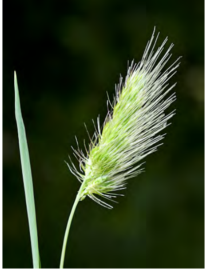
BRISTLY DOGTAIL GRASS (Cynosurus echinatus) Naturalized Annual - Grass Family - (May–Jul) - Open, disturbed sites - Tufted. Stem 4-28" long. Leaf blade 0.1-0.6" wide. Flower cluster 0.4-1.6" long, 1-sided. Fertile and sterile spikelets. INVASIVE weed.