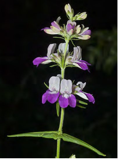
CHINESE-HOUSES (Collinsia heterophylla var. heterophylla) Native Annual - Plantain Family -(Mar–Jun) - Shady places in chaparral, open mixed woodland, oak woodland - Plant 4-20" tall. Flowers 0.6-0.8" long, upper lip whitish.