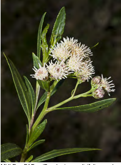
MULE FAT (Baccharis salicifolia subsp. salicifolia) Native Perennial - Sunflower Family -(All year) - Riparian woodland, canyon bottoms, disturbed sites, often forming thickets - Shrub < 13' tall, often sticky. Leaves to 6" long, with 1-3 main veins.