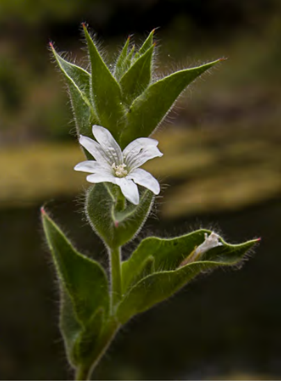
DENSE-FLOWER WILLOWHERB (Epilobium densiflorum) Native Annual - Evening Primrose Family - (May–Oct) - Streambanks, outwashes, seasonal moist flats - Plant 2-60" tall, soft-hairy. Petals 0.1-0.4", rose-purple to white. Fruit not tapered.