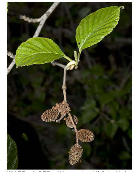
WHITE ALDER (Alnus rhombifolia) Native Perennial - Birch Family - (Apr–Jun) - Along permanent streams - Tree. Leaves flat, not rusty underneath, margins serrate, not rolled under. Female flowers cone-like. Wood used for furniture and for smoking meats.