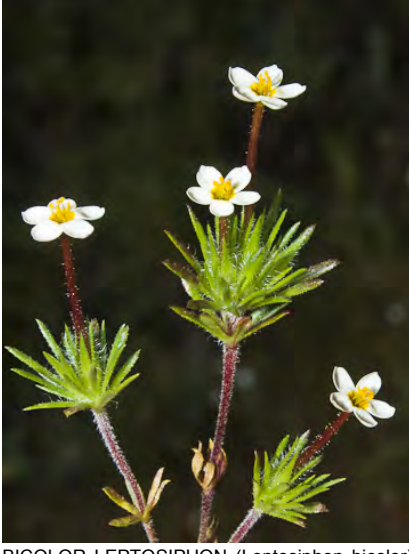
BICOLOR LEPTOSIPHON (Leptosiphon bicolor) Native Annual - Phlox Family - (Mar–Jun) -Common. Open, grassy areas, chaparral, woodland - Plant 0.8-8.3" tall, hairy. Flower lobes ~0.1" long, pink or white; tube red; stigma <=0.02" long.