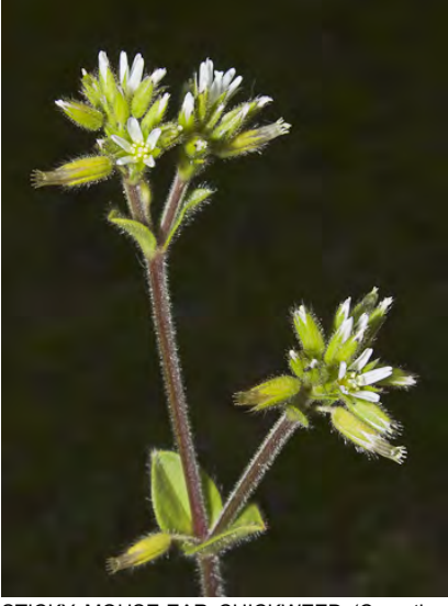
STICKY MOUSE-EAR CHICKWEED (Cerastium glomeratum) Naturalized Annual - Pink Family - (Spring) - Dry hillsides, grassland, chaparral, disturbed areas - Flowers 0.1-02" long, white, sticky-hairy. Flower bract hairs extend beyond tip; bracts herbaceous.