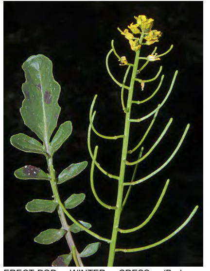
ERECT-POD WINTER CRESS (Barbarea orthoceras) Native Perennial - Mustard Family -(Mar–Jul) - Meadows, streambanks, moist woodland, grassland - Stem 8-24". Lower leaves w/large terminal lobe, upper clasping stem. Petals bright yellow, 0.2-0.3" long.