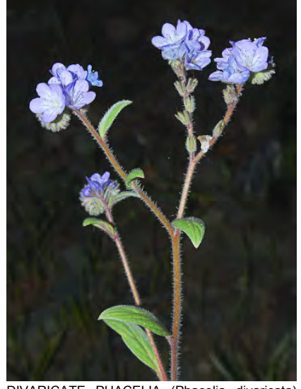
DIVARICATE PHACELIA (Phacelia divaricata) Native Annual - Borage Family - (Apr–Jun) -Open areas, chaparral, woodland, grassland -Plant 3.5-16" tall. Leaves with 0-few lobes. Flowers 0.4-0.6" long, lavender to violet. Seeds 8-16.