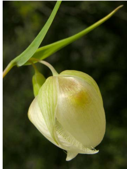
Calochortus albus White Fairy Lantern Native Perennial Liliaceae