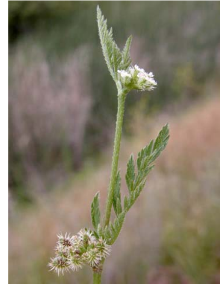
Torilis nodosa Knotted Hedge Parsley Introduced Annual Apiaceae