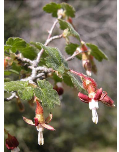
Ribes menziesii Canyon Gooseberry Native Perennial Grossulariaceae