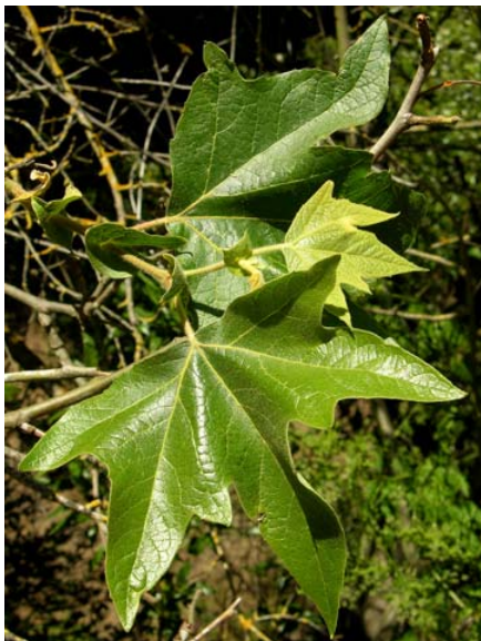
Platanus racemosa Western Sycamore Native Perennial Platanaceae