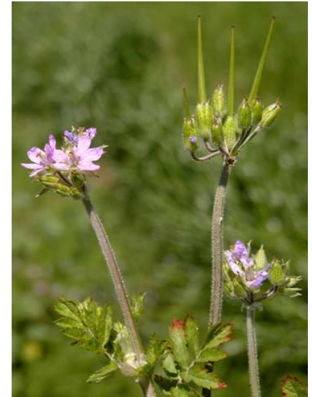
Erodium moschatum White-stem Filaree Introduced Annual Geraniaceae