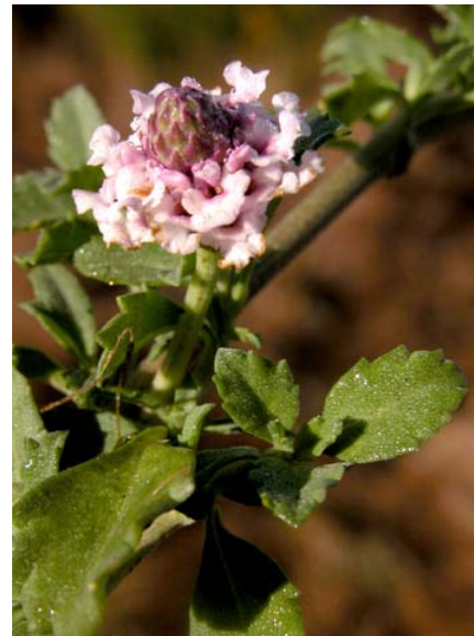
Phyla nodiflora var. nodiflora Lemon Verbena Native Perennial Verbenaceae