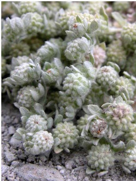
Psilocarphus tenellus var. tenellus Slender Woolly Heads Native Annual Asteraceae