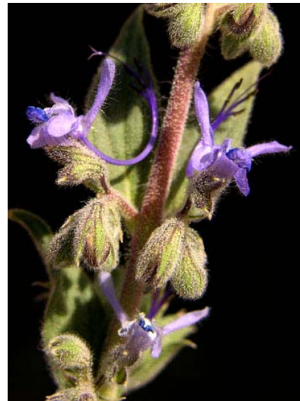
Trichostema lanceolatum Vinegar Weed Native Annual Lamiaceae