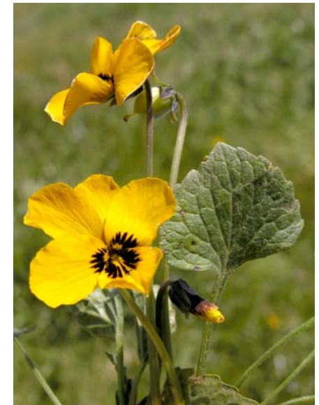
Viola pedunculata Johnny-Jump-Up / Wild Pansy Native Perennial Violaceae