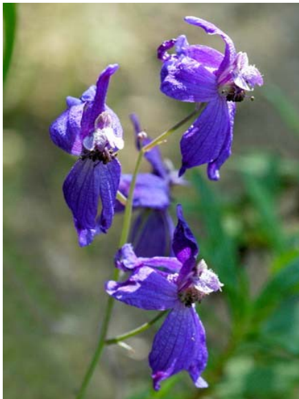
Delphinium variegatum ssp. variegatum Royal Larkspur Native Perennial Ranunculaceae