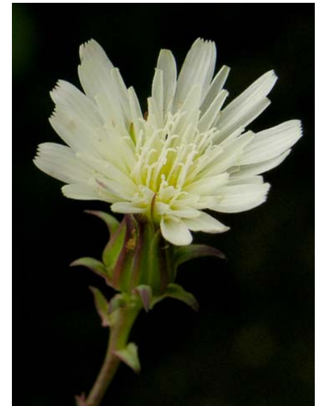
Rafinesquia californica California White Chicory Native Annual Asteraceae