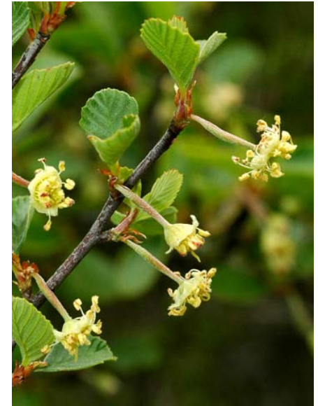
Cercocarpus betuloides var. betuloides Birch-leaf Mt. Mahogany Native Perennial Rosaceae