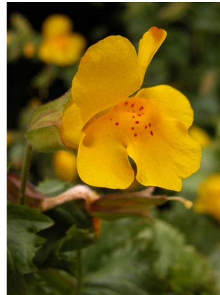
Mimulus guttatus Golden Monkey Flower Native Perennial Scrophulariaceae