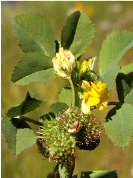
Medicago polymorpha California Bur Clover Introduced Annual Fabaceae