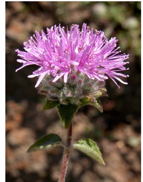
Monardella villosa ssp. villosa Common Coyotemint Native Perennial Lamiaceae