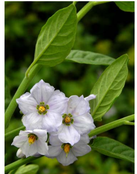
Solanum umbelliferum Blue Witch Native Perennial Solanaceae