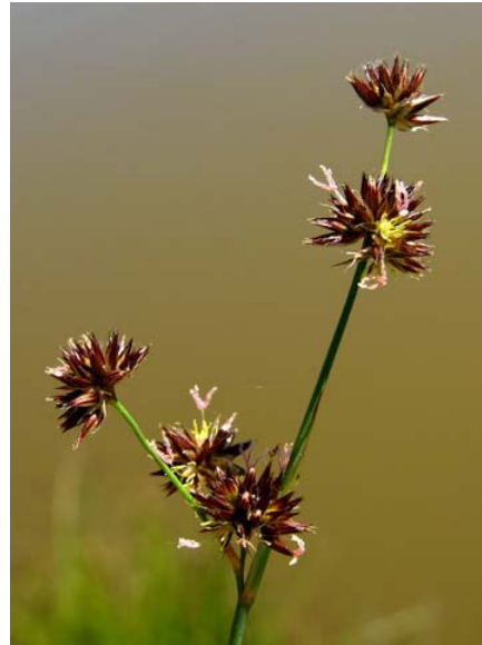
Juncus xiphioides Iris-leaf Rush Native Perennial Juncaceae