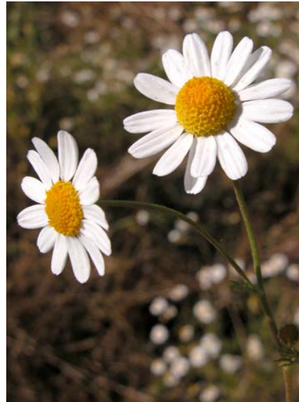
Anthemis cotula Mayweed Introduced Annual Asteraceae