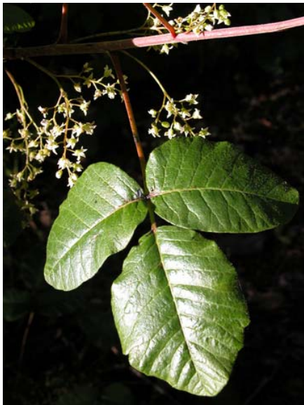
Toxicodendron diversilobum Poison Oak Native Perennial Anacardiaceae