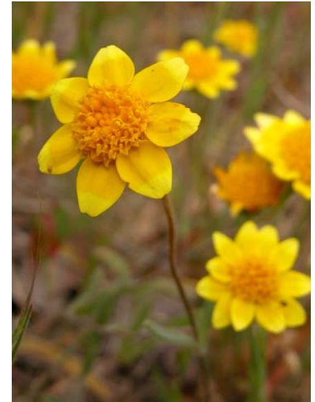
Lasthenia californica Goldfields Native Annual Asteraceae