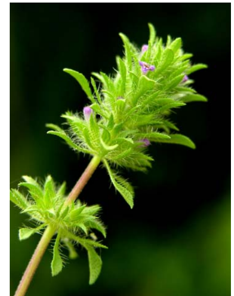
Pogogyne serpylloides Thymelike Pogogyne Native Annual Lamiaceae