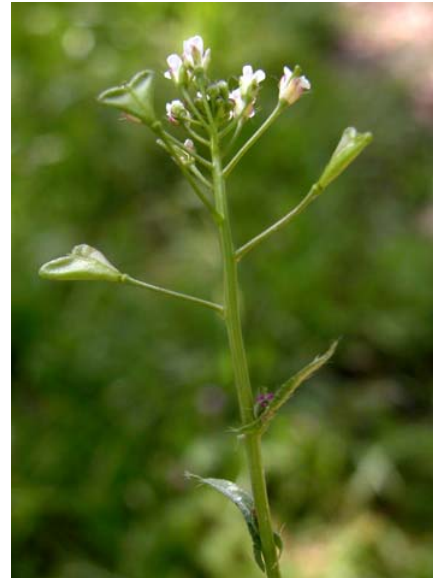
Capsella bursa-pastoris Shepherd's Purse Introduced Annual Brassicaceae