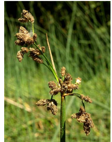
Scirpus acutus var. occidentalis Hardstem Bulrush Native Perennial Cyperaceae