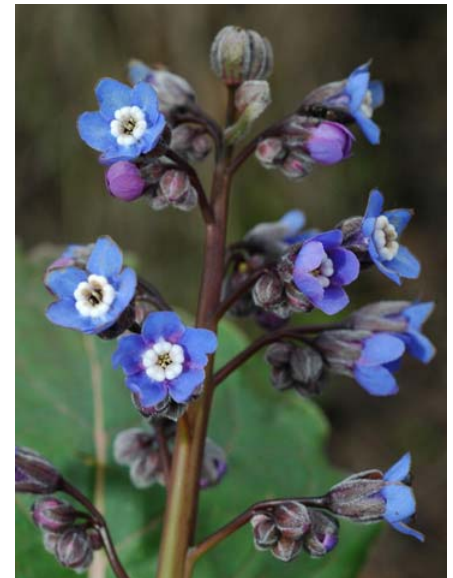
Cynoglossum grande Large Hound's Tongue Native Perennial Boraginaceae