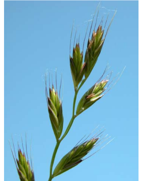
Lolium multiflorum Awned Italian Rye Grass Introduced Perennial Poaceae