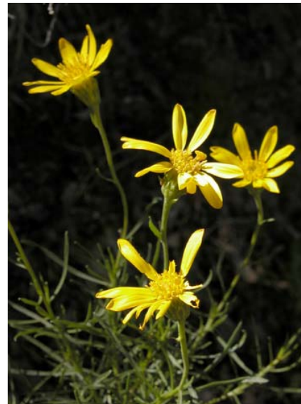
Ericameria linearifolia Interior Golden Bush Native Perennial Asteraceae