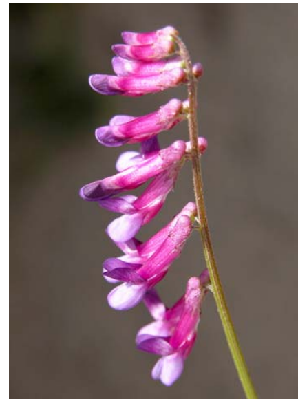
Vicia villosa ssp. varia Winter Vetch Introduced Annual-Biennial Fabaceae