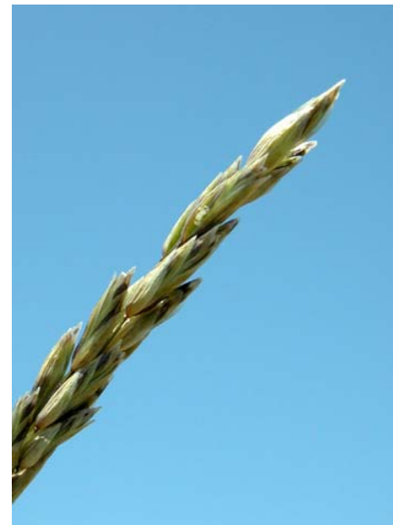
Poa secunda ssp. secunda One-side Blue Grass Native Perennial Poaceae