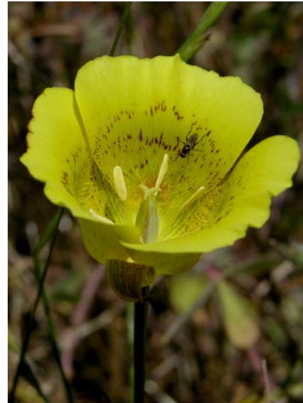
Calochortus luteus Yellow Mariposa Lily Native Perennial Liliaceae