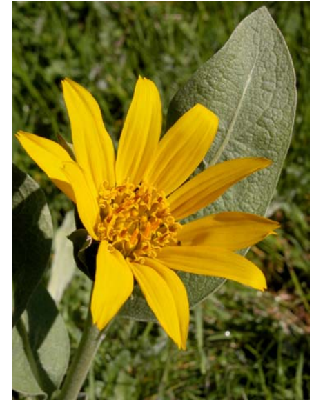
Wyethia helenioides Gray Mule's Ear Native Perennial Asteraceae