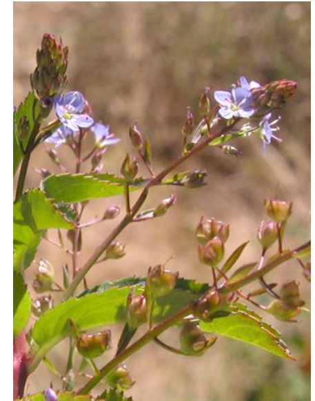
Veronica americana American Brooklime Speedwell Native Perennial Scrophulariaceae