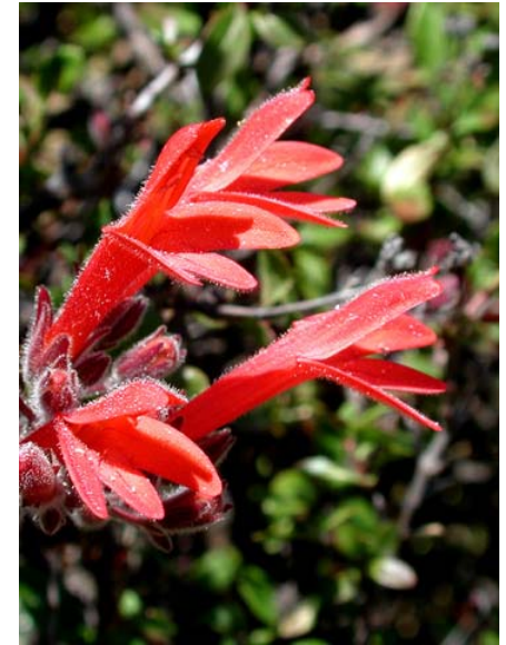
Epilobium canum ssp. canum California Fuchsia Native Perennial Onagraceae