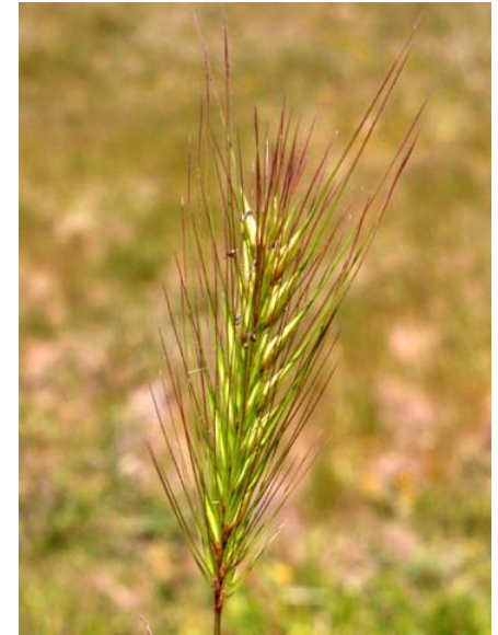
Hordeum marinum ssp. gussoneanum Mediterranean Barley Introduced Annual Poaceae