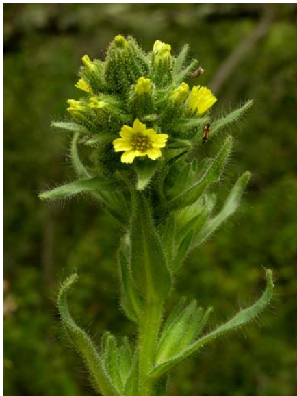
Madia sativa Common / Coast Tarweed Native Annual Asteraceae