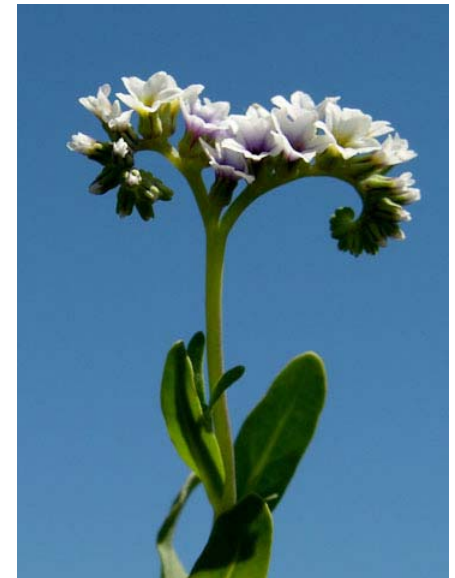
Heliotropium curassavicum Seaside Heliotrope Native Perennial Boraginaceae