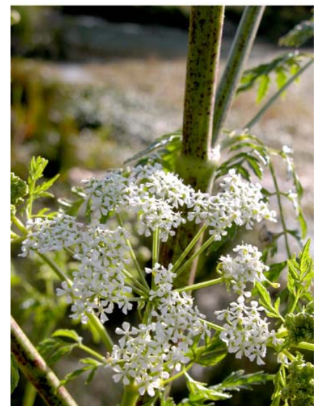
Conium maculatum Poison Hemlock Introduced Biennial Apiaceae