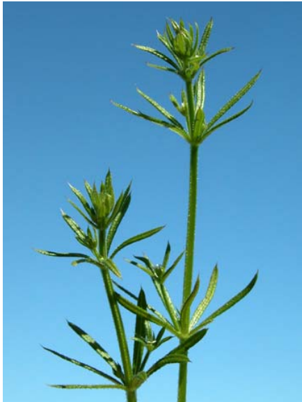
Galium aparine Goosegrass Bedstraw Native Annual Rubiaceae