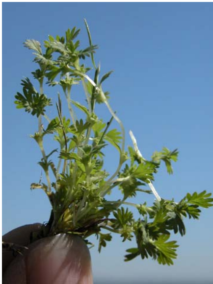
Aphanes occidentalis Lady's Mantle Native Annual Rosaceae