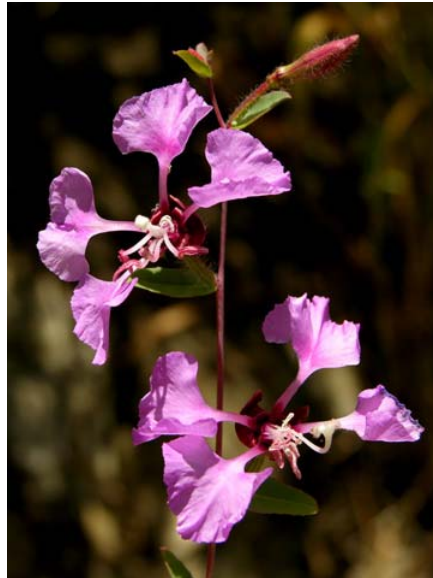
Clarkia unguiculata Elegant Clarkia Native Annual Onagraceae