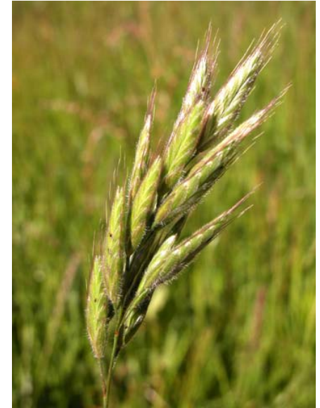
Bromus hordeaceus Soft Brome Introduced Annual Poaceae