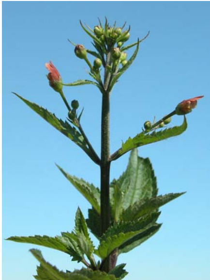
Scrophularia californica ssp. californica California Figwort Native Perennial Scrophulariaceae