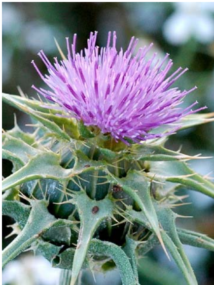
Silybum marianum Milk Thistle Introduced Annual-Biennial Asteraceae