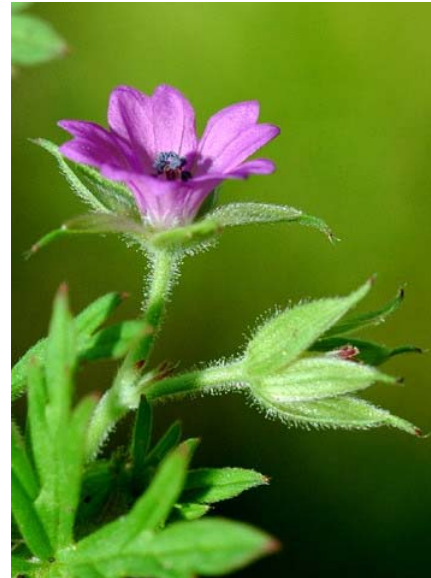
Geranium dissectum Purpletip Cut-leaf Geranium Introduced Annual Geraniaceae