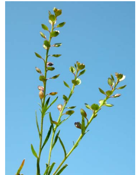
Lepidium nitidum var. nitidum Threadleaf Peppergrass Native Annual Brassicaceae