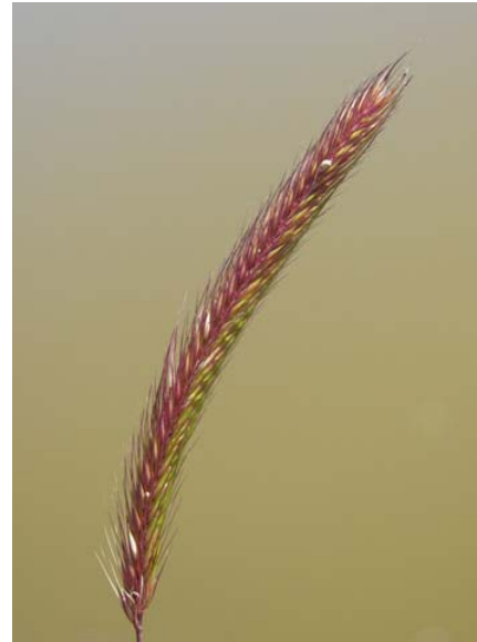
Hordeum brachyantherum ssp. brachyantherum Meadow Barley Native Perennial Poaceae