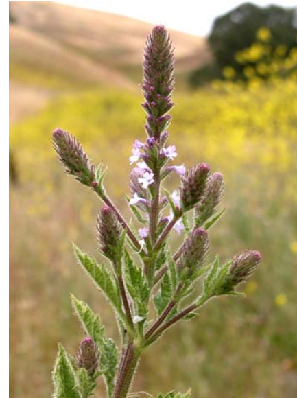
Verbena lasiostachys var. scabrida Robust Vervain Native Perennial Verbenaceae