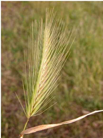
Hordeum marinum ssp. leporinum Hare Barley Introduced Annual Poaceae