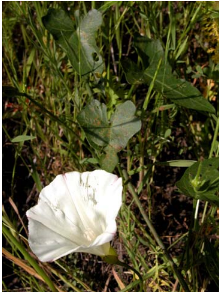
Calystegia purpurata ssp. purpurata Climbing Morning Glory Native Perennial Convolvulaceae