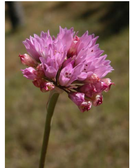
Allium serra Pink / Serrated Onion Native Perennial Liliaceae