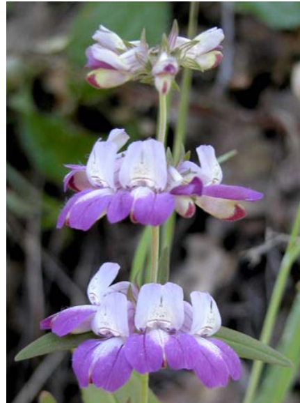
Collinsia heterophylla Chinese Houses Native Annual Scrophulariaceae