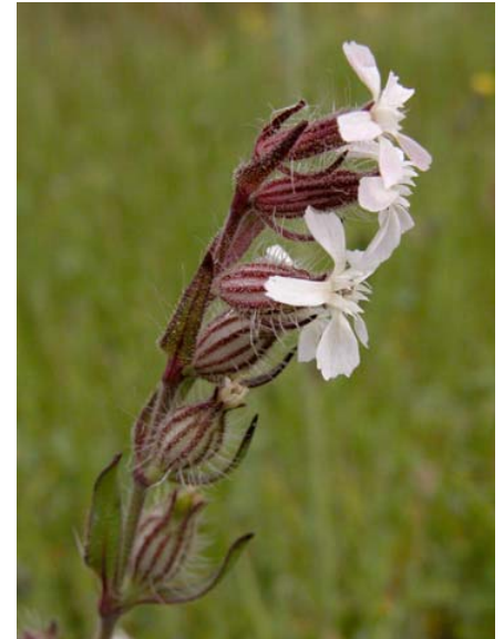
Silene gallica Windmill Pink Introduced Annual Caryophyllaceae