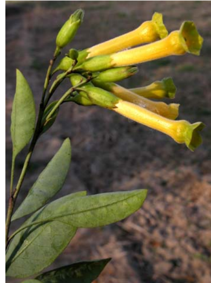
Nicotiana glauca Tree Tobacco Introduced Perennial Solanaceae