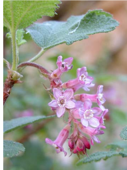
Ribes malvaceum var. malvaceum Chaparral Currant Native Perennial Grossulariaceae