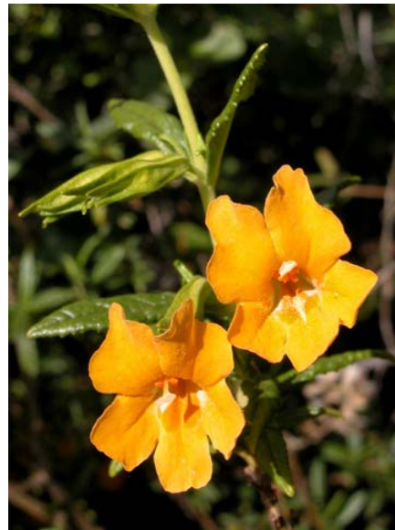
Mimulus aurantiacus Bush Monkey Flower Native Perennial Scrophulariaceae