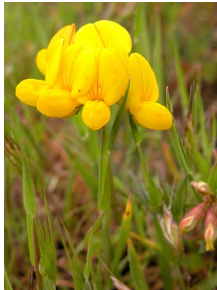
Lotus corniculatus Bird's-foot Deerweed Introduced Perennial Fabaceae