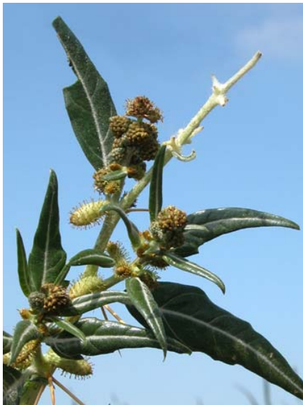
Xanthium spinosum Spiny Clobur Native Annual Asteraceae