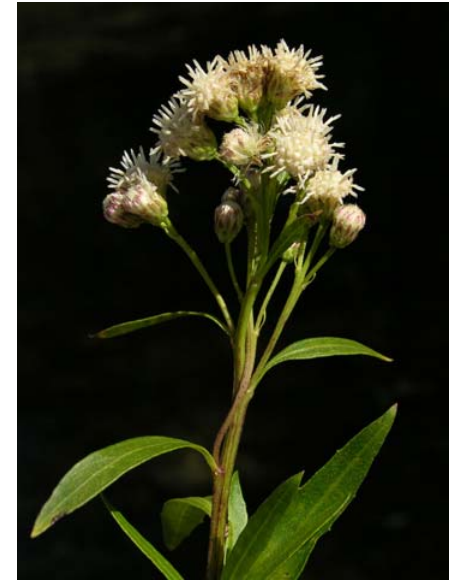
Baccharis salicifolia Mulefat Native Perennial Asteraceae