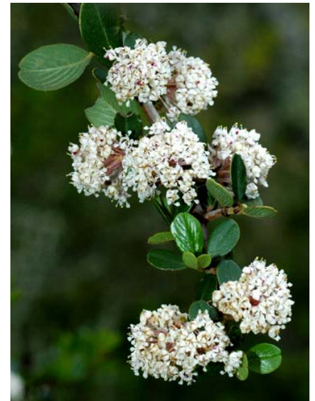
Ceanothus cuneatus var. cuneatus Buckbrush Native Perennial Rhamnaceae