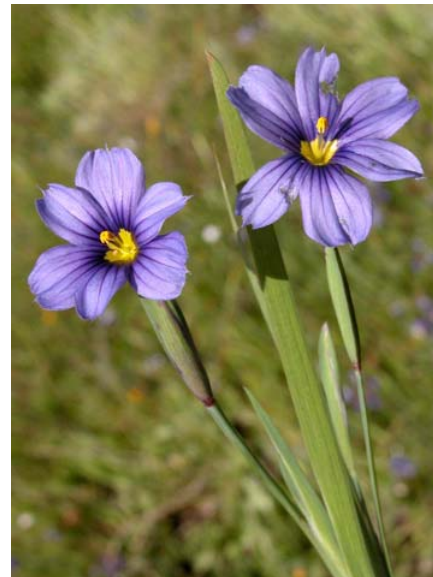
Sisyrinchium bellum Blue-eyed Grass Native Perennial Iridaceae