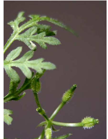
Anthriscus caucalis Bur-chervil Introduced Annual Apiaceae