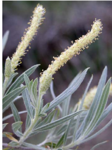
Salix exigua Narrowleaf Willow Native Perennial Salicaceae