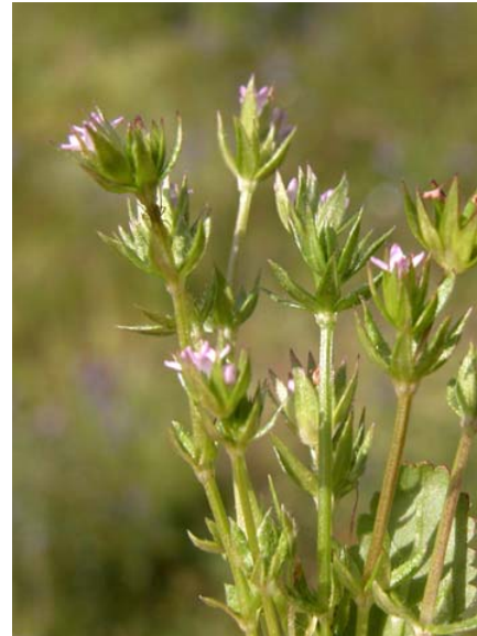
Sherardia arvensis Blue Field Madder Introduced Annual Rubiaceae