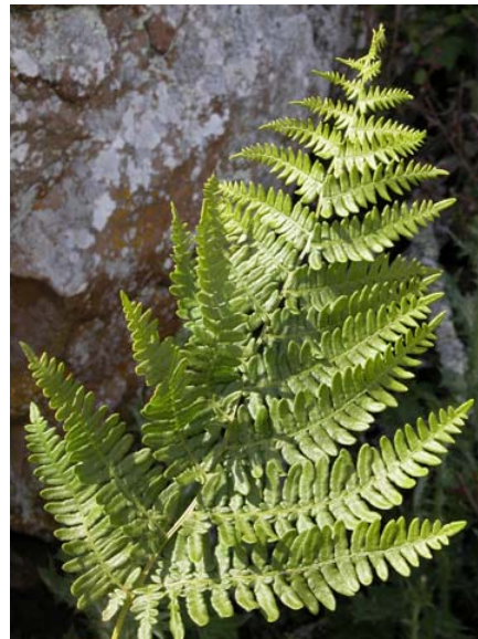
Pteridium aquilinum var. pubescens Bracken Fern Native Perennial Dennstaedtiaceae