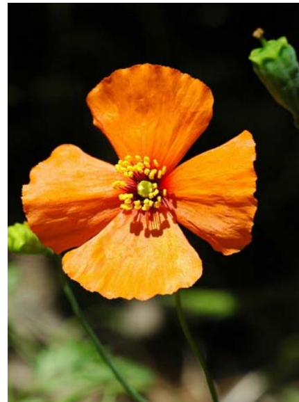
Stylomecon heterophylla Wind Poppy Native Annual Papaveraceae