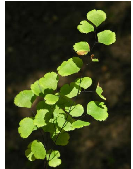
Adiantum jordanii Calif. Maidenhair Fern Native Perennial Pteridaceae