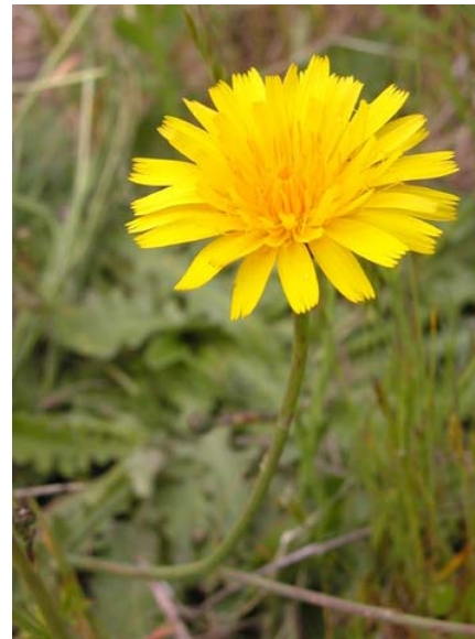
Hypochaeris radicata Rough Cat's-ear Introduced Perennial Asteraceae