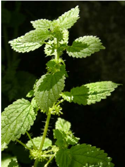
Urtica urens Dwarf Stinging Nettle Introduced Annual Urticaceae