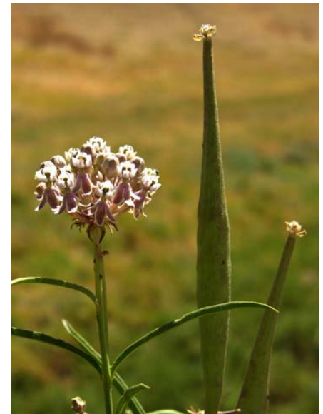
Asclepias fascicularis Whorled/Narrow-leaf Milkweed Native Perennial Asclepiadaceae