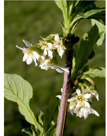
Oemleria cerasiformis Oso Berry Native Perennial Rosaceae