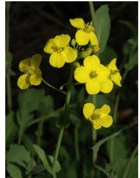
Brassica rapa Yellow Field Mustard Introduced Annual Brassicaceae