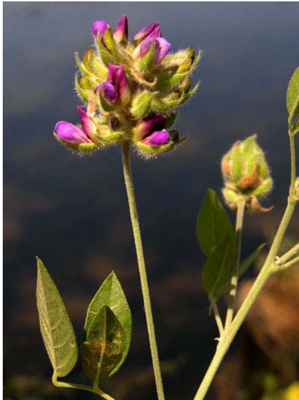
Rupertia physodes California Tea Native Perennial Fabaceae