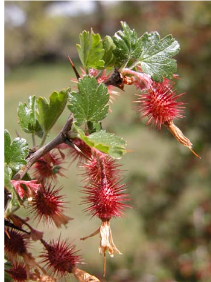
Ribes californicum var. californicum Hillside Gooseberry Native Perennial Grossulariaceae