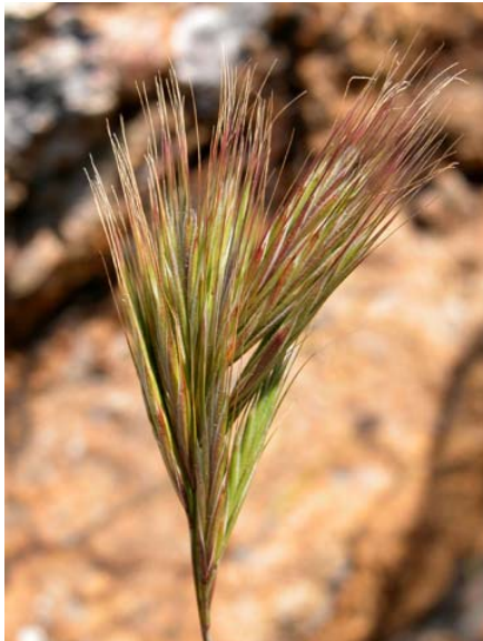
Bromus madritensis ssp. rubens Red Foxtail Brome Introduced Annual Poaceae