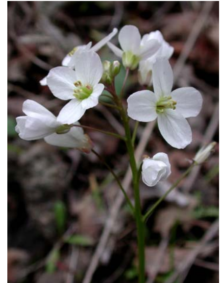
Cardamine californica Milkmaids Native Perennial Brassicaceae