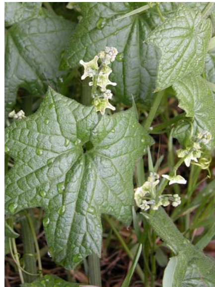
Marah fabaceus Common / California Manroot Native Perennial Cucurbitaceae