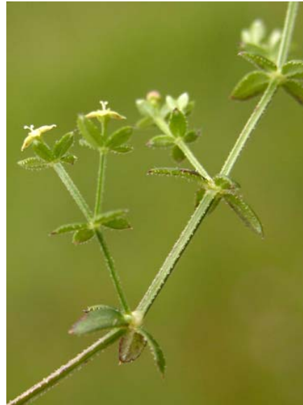
Galium porrigens var. porrigens Climbing Bedstraw Native Perennial Rubiaceae