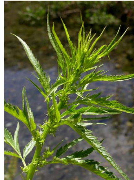
Datisca glomerata Durango Root Native Perennial Datisaceae