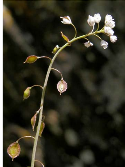
Thysanocarpus curvipes Hairy Fringepod Native Annual Brassicaceae