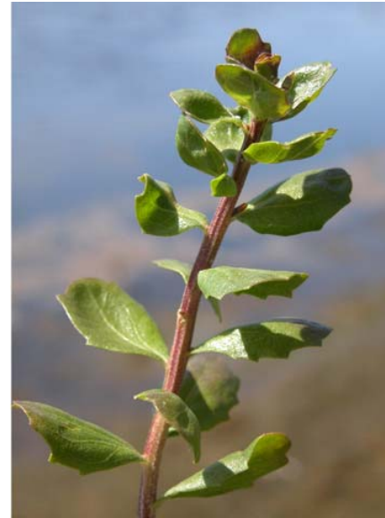
Baccharis pilularis Coyote Bush Native Perennial Asteraceae