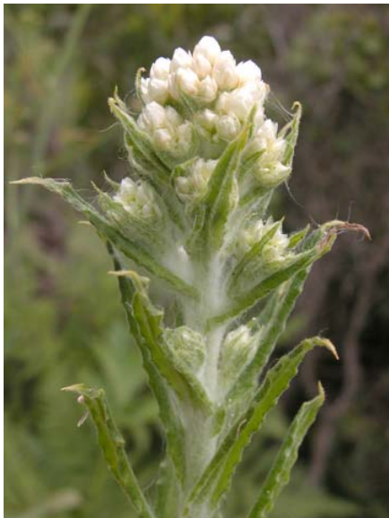
Gnaphalium californicum California Everlasting Native Biennial Asteraceae