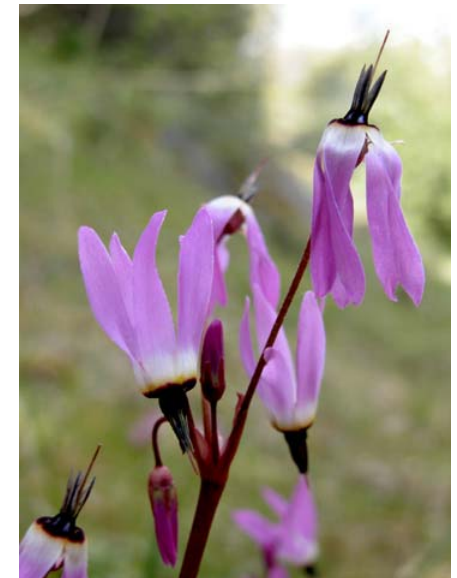
Dodecatheon hendersonii Mosquitobills Shooting Star Native Perennial Primulaceae