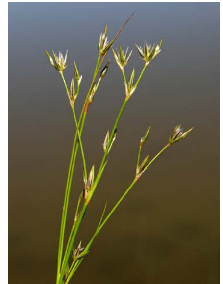
Juncus bufonius var. bufonius Toad Rush Native Annual Juncaceae