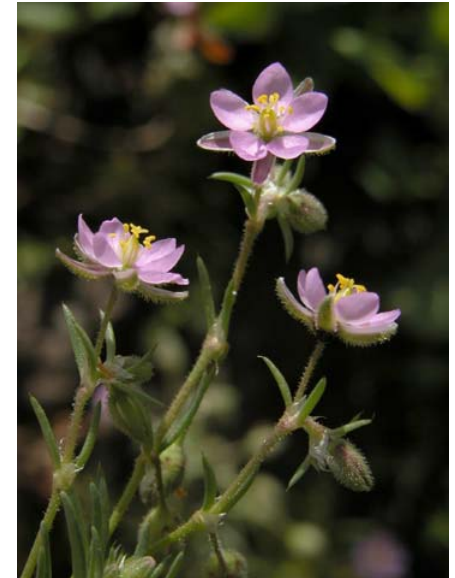
Spargularia rubra Ruby Sand Spurry Introduced Annual-Perennial Caryophyllaceae