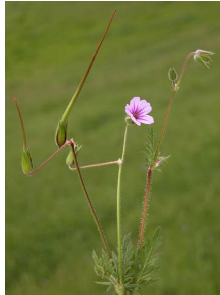
Erodium botrys Long-beaked Filaree Introduced Annual Geraniaceae