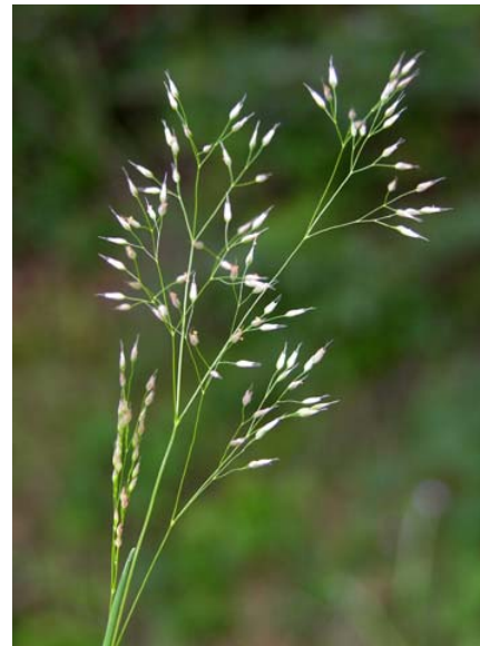
Aira caryophyllea Silver European Hair Grass Introduced Annual Poaceae