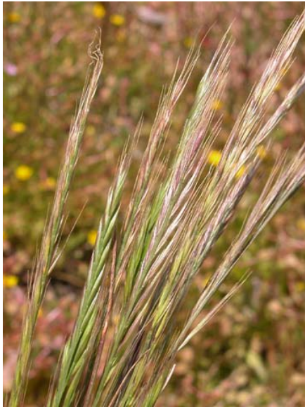
Vulpia bromoides Six-weeks Fescue Introduced Annual Poaceae