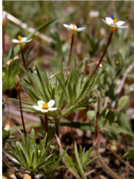
Linanthus bicolor Bicolor Linanthus Native Annual Polemoniaceae