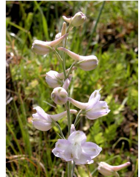
Delphinium hesperium ssp. pallescens Pale Western Larkspur Native Perennial Ranunculaceae