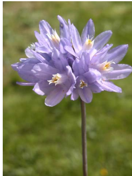
Dichelostemma capitatum ssp. capitatum Blue Dicks Native Perennial Liliaceae