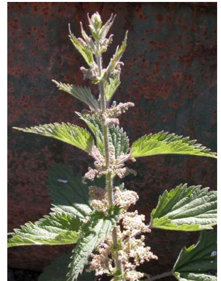
Urtica dioica ssp. holosericea Creek Stinging Nettle Native Perennial Urticaceae