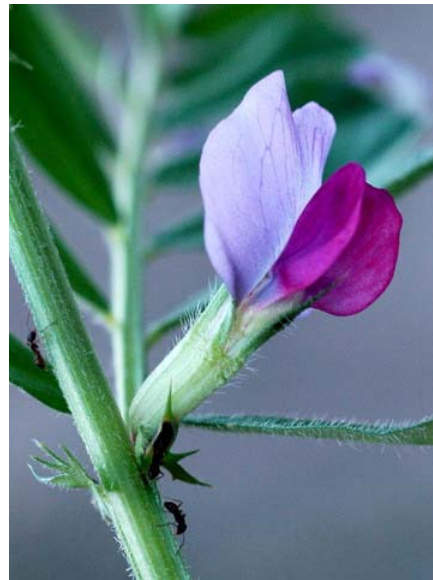
Vicia sativa ssp. sativa Spring Vetch Introduced Annual Fabaceae