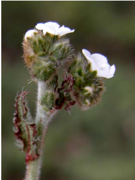
Plagiobothrys nothofulvus Nievitas Popcorn Flower Native Annual Boraginaceae