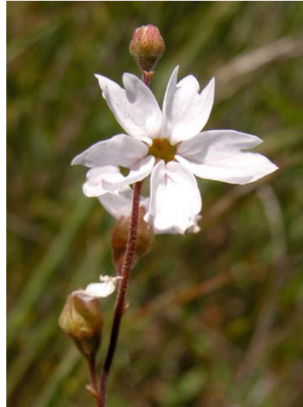
Lithophragma affine Woodland Star Native Perennial Saxifragaceae