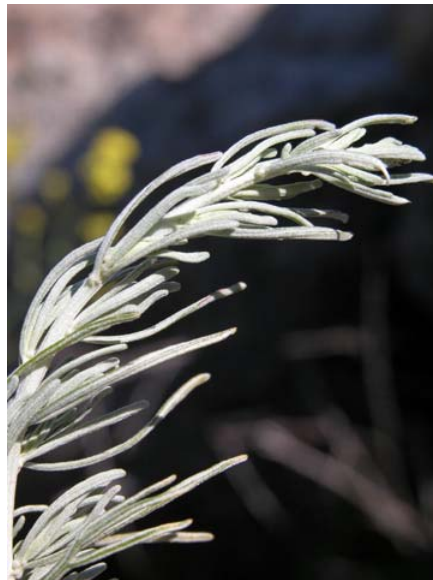
Artemisia californica California Sagebrush Native Perennial Asteraceae