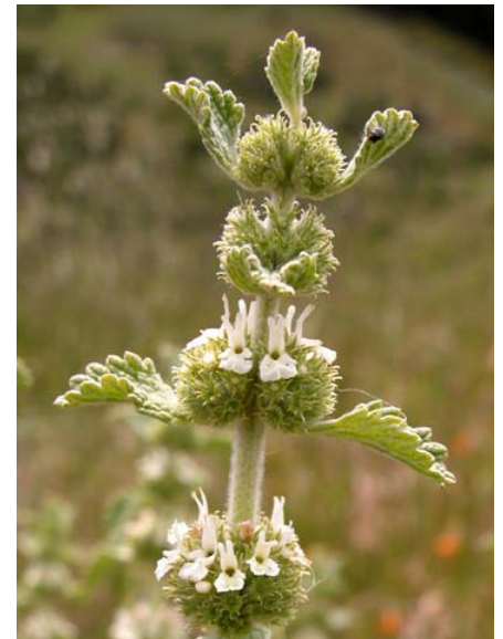
Marrubium vulgare Common Horehound Introduced Perennial Lamiaceae