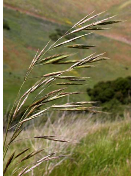
Bromus carinatus var. carinatus California Brome Native Perennial Poaceae