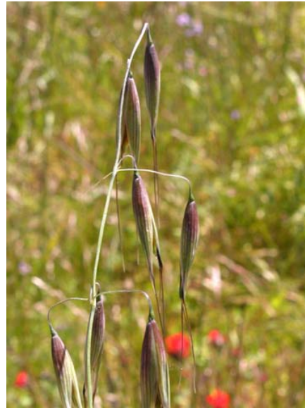
Avena fatua Wild Oat Introduced Annual Poaceae