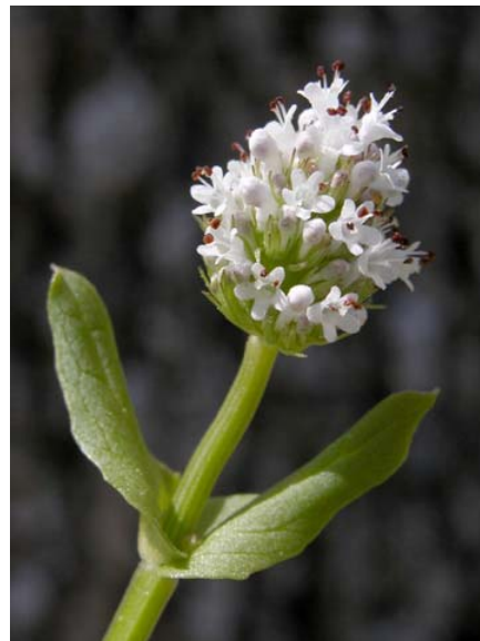
Plectritis macrocera Longhorn Plectritis Native Annual Valerianaceae