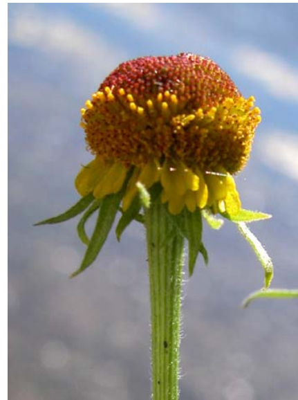
Helenium puberulum Rosilla Native Biennial Asteraceae