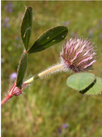
Trifolium hirtum Rose Clover Introduced Annual Fabaceae