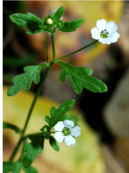
Nemophila heterophylla Variable-leaf Nemophila Native Annual Hydrophyllaceae