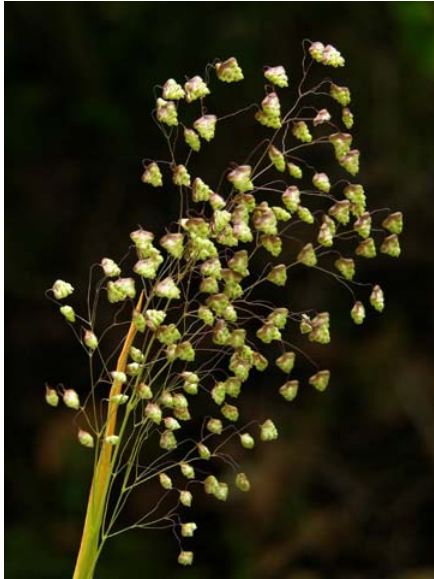
Briza minor Little Quaking Grass Introduced Annual Poaceae