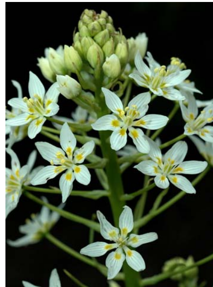
Zigadenus fremontii Common Star Lily Native Perennial Liliaceae