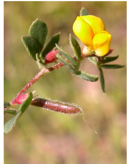
Lotus wrangelianus California Lotus Native Annual Fabaceae