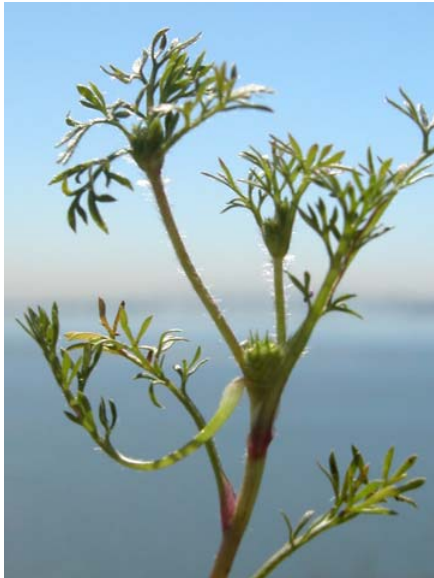
Soliva sessilis Common Soliva Introduced Annual Asteraceae