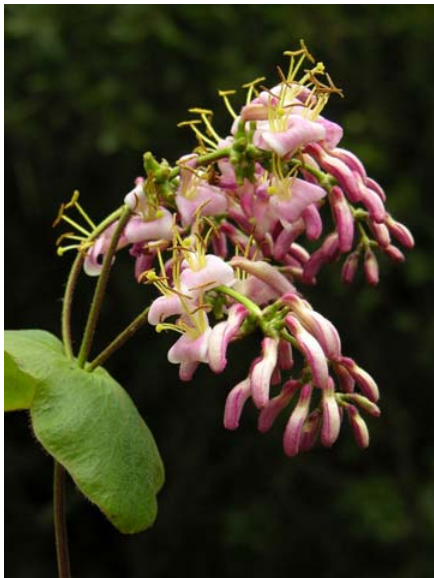
Lonicera hispidula var. vacillans Hairy Vine Honeysuckle Native Perennial Caprifoliaceae