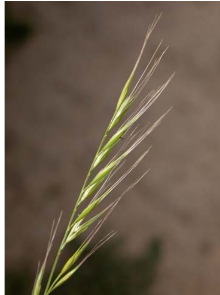
Vulpia microstachys var. pauciflora Few-flower Fescue Native Annual Poaceae