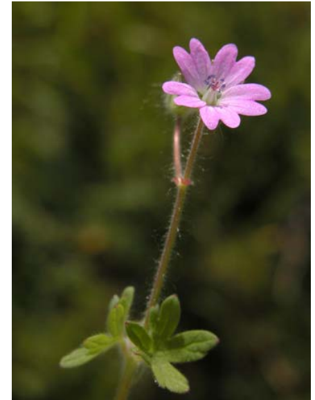
Geranium molle Hairy Dove's Foot Geranium Introduced Annual Geraniaceae