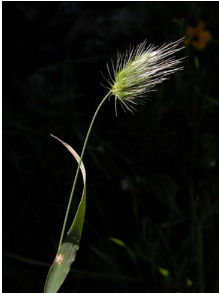
Cynosurus echinatus Hedgehog Dogtail Grass Introduced Annual Poaceae