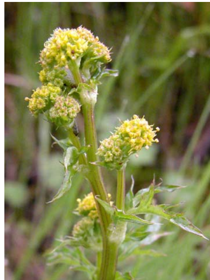
Sanicula crassicaulis Pacific Woodland Sanicle Native Perennial Apiaceae