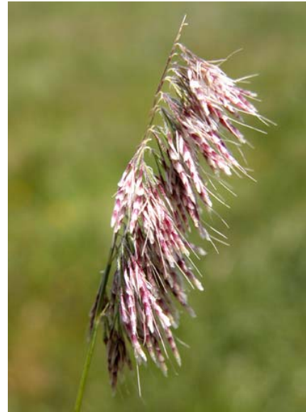
Lamarckia aurea Goldentop Grass Introduced Annual Poaceae