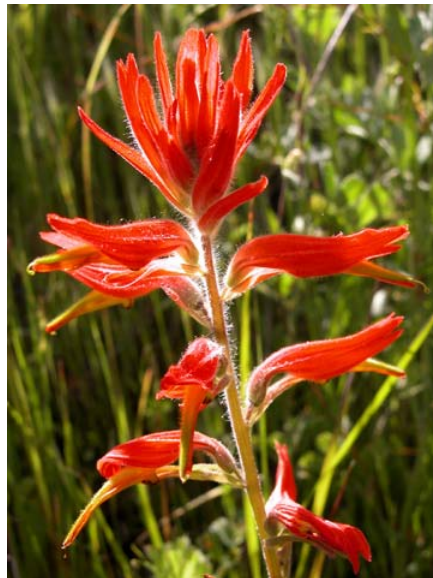
Castilleja affinis ssp. affinis Common Indian Paintbrush Native Perennial Scrophulariaceae