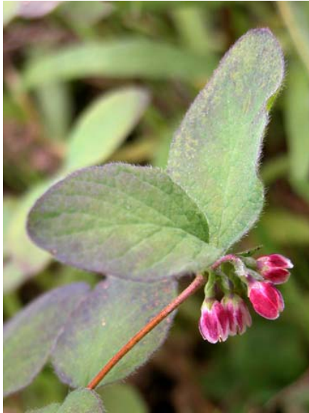
Symphoricarpos mollis Creeping Snowberry Native Perennial Caprifoliaceae