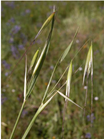
Avena barbata Slender Wild Oat Introduced Annual Poaceae