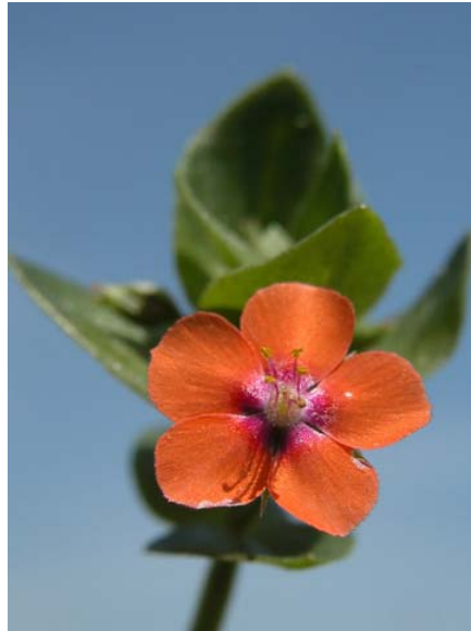
Anagallis arvensis Scarlet Pimpernel Introduced Annual Primulaceae