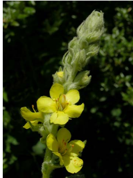
Verbascum thapsus Common Woolly Mullein Introduced Biennial Scrophulariaceae