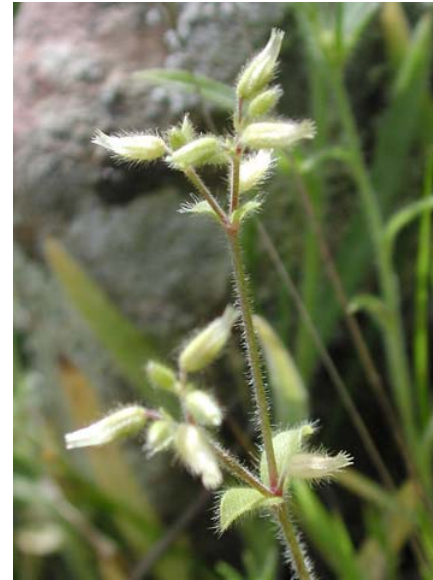
Cerastium glomeratum Mouse-ear Chickweed Introduced Annual Caryophyllaceae