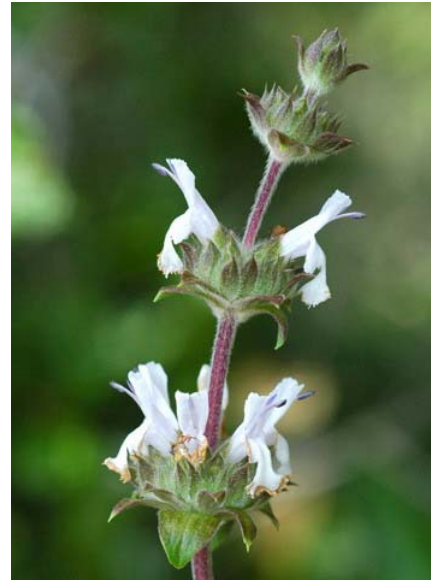
Salvia mellifera Black Sage Native Perennial Lamiaceae