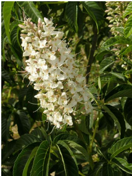
Aesculus californica California Buckeye Native Perennial Hippocastanaceae