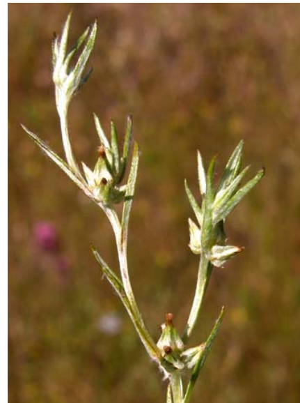
Filago gallica Fluffweed Introduced Annual Asteraceae