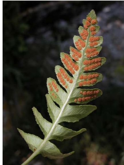
Polypodium calirhiza Polypody Fern Native Perennial Polypodiaceae