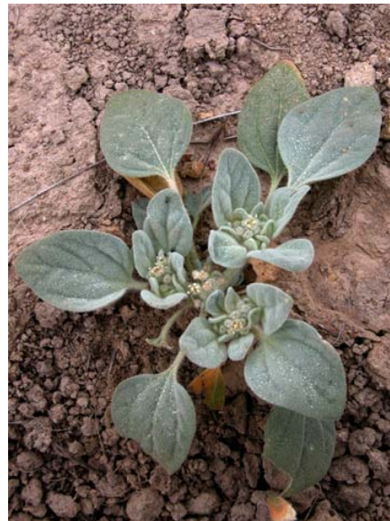
Eremocarpus setigerus Turkey Mullain Native Annual Euphorbiaceae