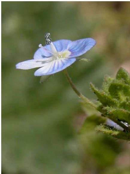
Veronica persica Persian Speedwell Introduced Annual Scrophulariaceae