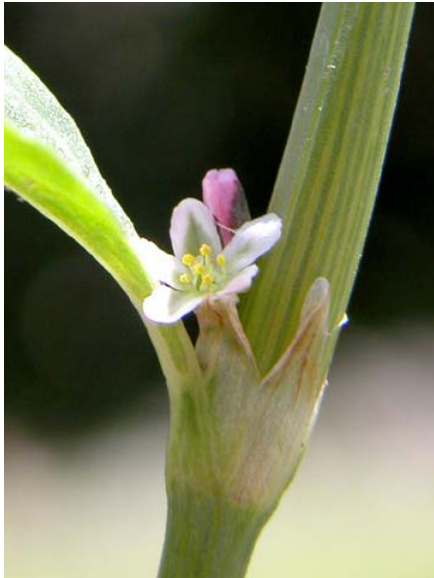
Polygonum arenastrum Common Yard Knotweed Introduced Annual Polygonaceae