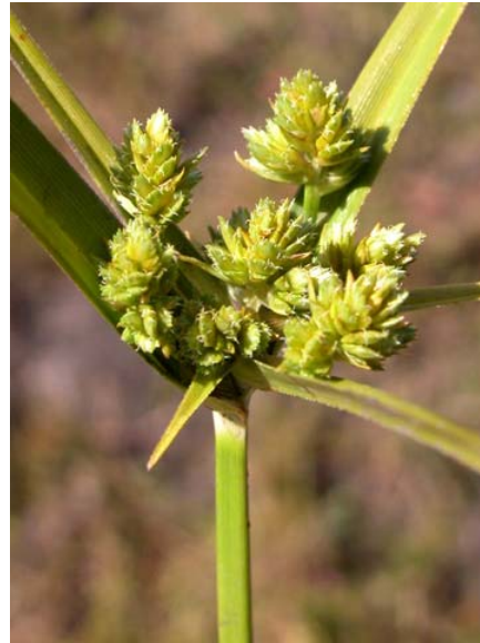
Cyperus eragrostis Tall Nutsedge Native Perennial Cyperaceae