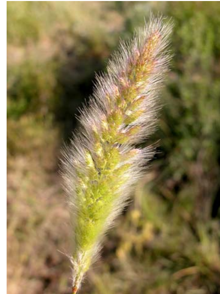
Polypogon monspeliensis Annual Rabbitfoot Grass Introduced Annual Poaceae