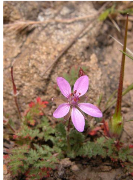
Erodium cicutarium Red-stem Filaree Introduced Annual Geraniaceae