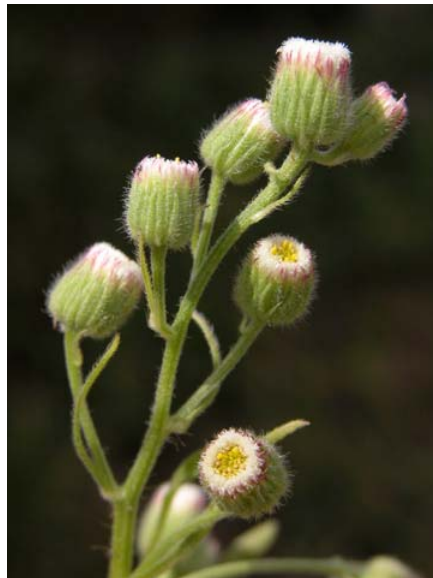
Conyza bonariensis South American Horseweed Introduced Annual Asteraceae