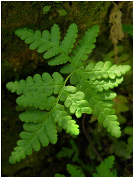
Pentagramma triangularis ssp. triangularis Goldenback Fern Native Perennial Pteridaceae