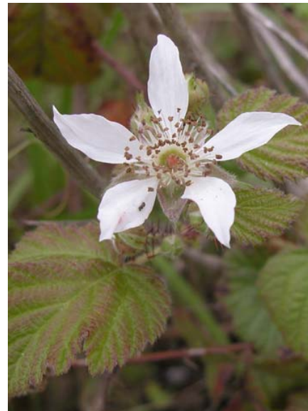
Rubus ursinus Native California Blackberry Native Perennial Rosaceae