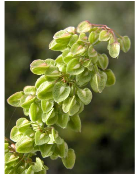
Rumex crispus Curly Dock Introduced Perennial Polygonaceae