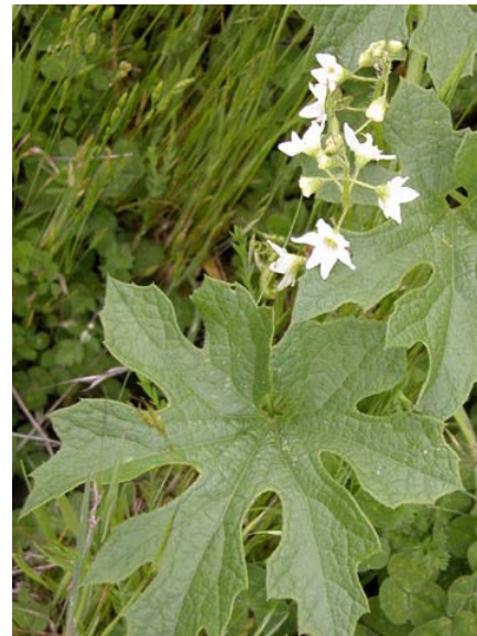
Marah oregonus Oregon / Coast Manroot Native Perennial Cucurbitaceae