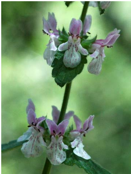
Stachys ajugoides var. rigida Common Rigid Hedge Nettle Native Perennial Lamiaceae