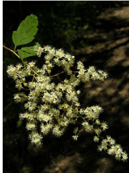
Holodiscus discolor Creambush / Ocean Spray Native Perennial Rosaceae