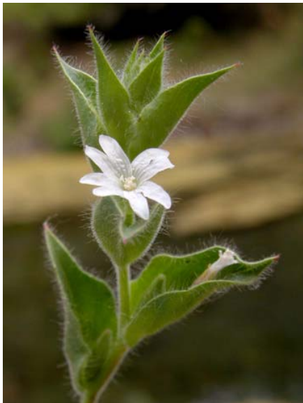
Epilobium densiflorum Dense-flower Willowherb Native Annual Onagraceae