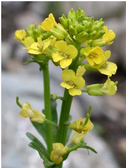
Barbarea orthoceras Erect-pod Winter Cress Native Perennial Brassicaceae