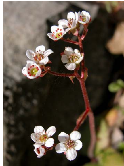
Saxifraga californica California Saxifrage Native Perennial Saxifragaceae