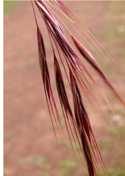
Bromus diandrus Rippgut Brome Introduced Annual Poaceae