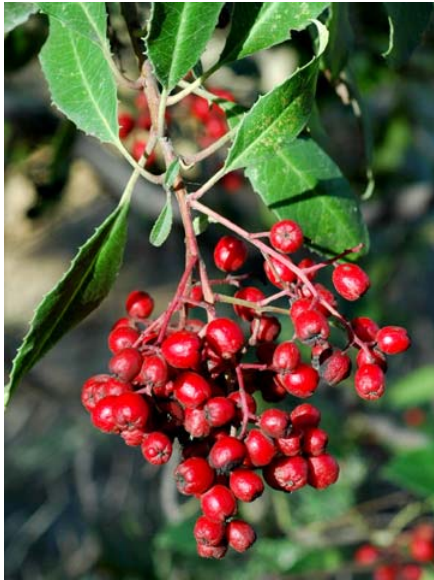
Heteromeles arbutifolia Toyon Native Perennial Rosaceae