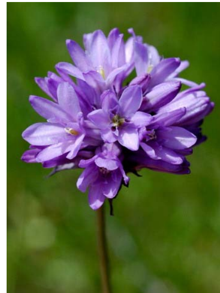
Dichelostemma congestum Ookow Native Perennial Liliaceae