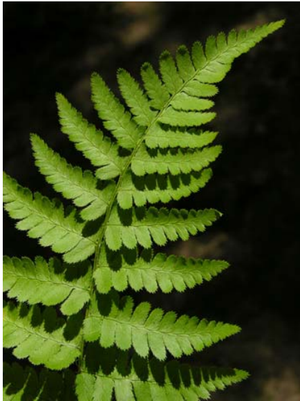
Dryopteris arguta Coastal Wood Fern Native Perennial Dryopteridaceae