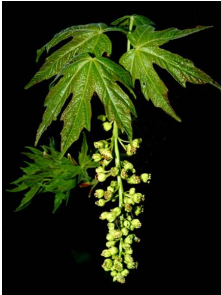
Acer macrophyllum Bigleaf Maple Native Perennial Aceraceae