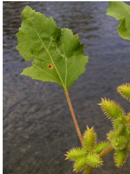
Xanthium strumarium Cocklebur Native Annual Asteraceae