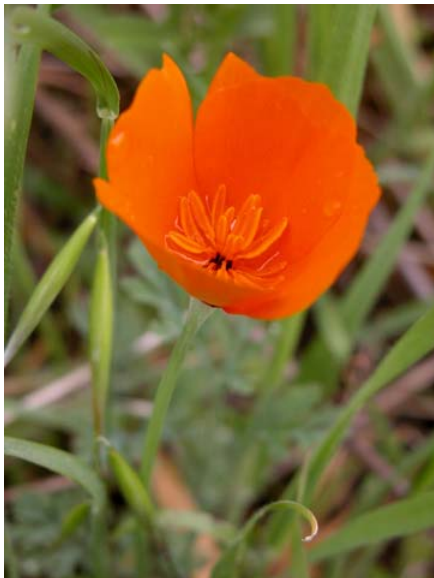
Eschscholzia californica California Poppy Native Perennial Papaveraceae