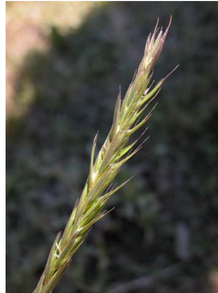
Elymus glaucus ssp. glaucus Blue Wild Rye Native Perennial Poaceae