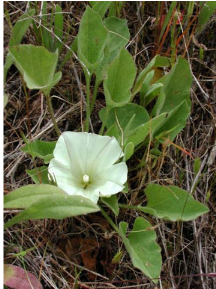
Calystegia subacaulis ssp. subacaulis Shortstem Morning Glory Native Perennial Convolvulaceae