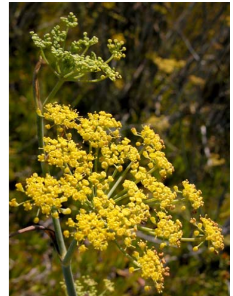
Foeniculum vulgare Sweet Fennel Introduced Perennial Apiaceae