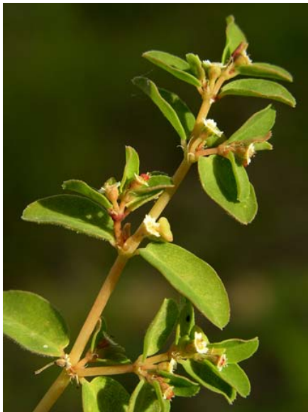
Chamaesyce serpyllifolia ssp. serpyllifolia Thymeleaf Spurge Native Annual Euphorbiaceae