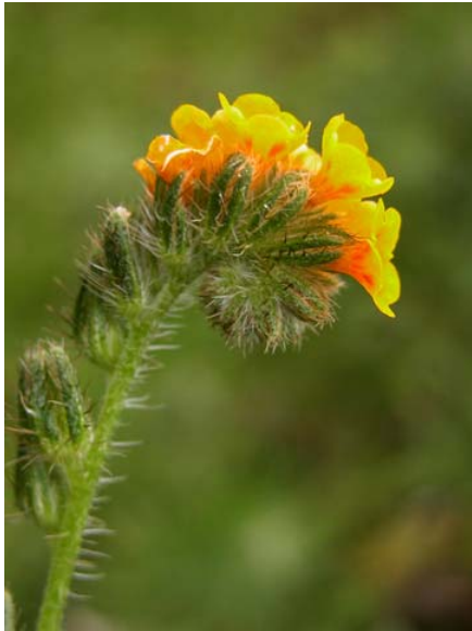
Amsinckia menziesii var. intermedia Common Fiddleneck Native Annual Boraginaceae