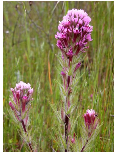
Castilleja exserta ssp. exserta Purple Owl's Clover Native Annual Scrophulariaceae