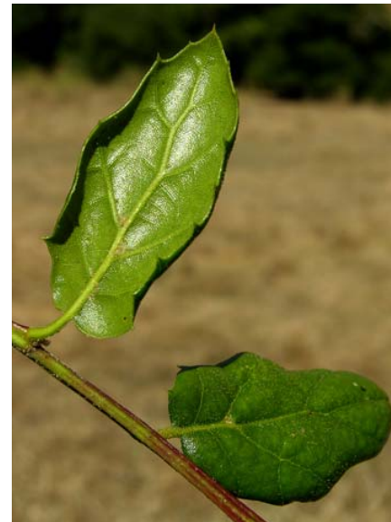
Quercus agrifolia var. agrifolia Coast Live Oak Native Perennial Fagaceae