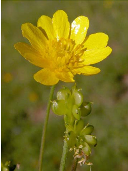
Ranunculus californicus California Buttercup Native Perennial Ranunculaceae