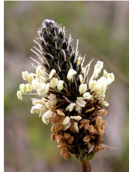
Plantago lanceolata English Plantain Introduced Annual Plantaginaceae