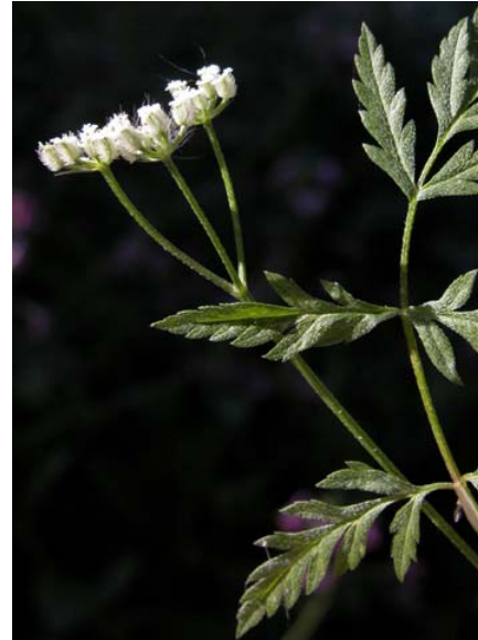
Torilis arvensis Hedge Parsley Introduced Annual Apiaceae