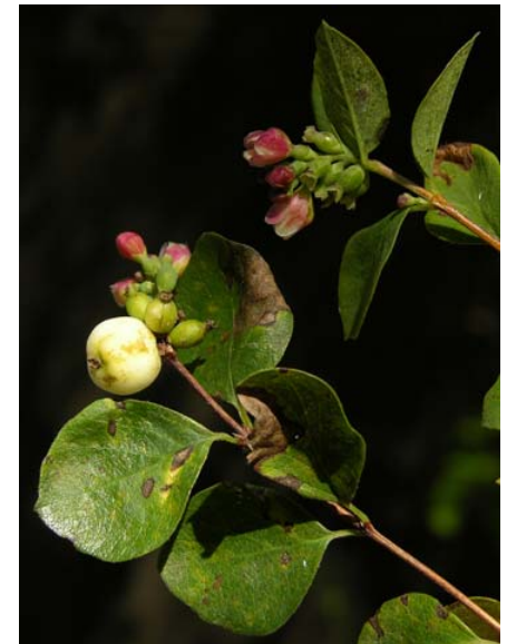
Symphoricarpos albus var. laevigatus Bush / Common Snowberry Native Perennial Caprifoliaceae