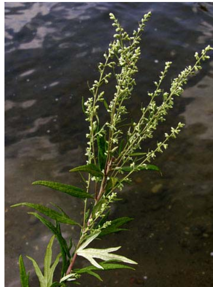
Artemisia douglasiana California Mugwort Native Perennial Asteraceae