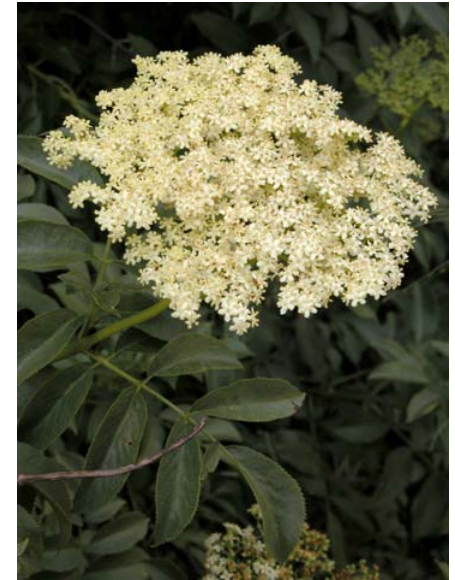
Sambucus mexicana Blue Elderberry Native Perennial Caprifoliaceae