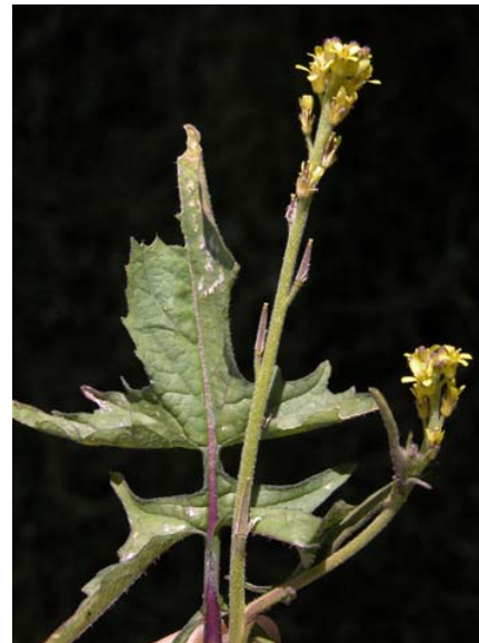
Brassica nigra Black Mustard Introduced Annual Brassicaceae