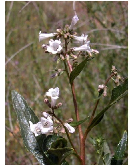
Eriodictyon californicum Yerba Santa Native Perennial Hydrophyllaceae