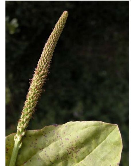
Plantago major Common Plantain Introduced Annual-Perennial Plantaginaceae