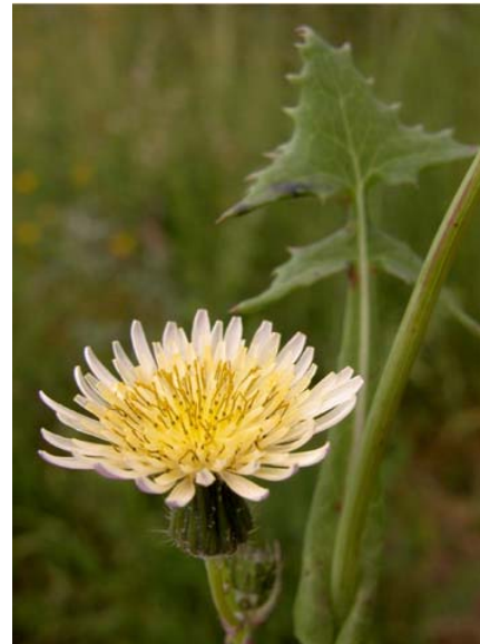
Sonchus oleraceus Common Sow Thistle Introduced Annual Asteraceae