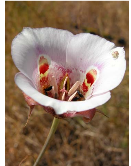
Calochortus venustus White Butterfly Mariposa Lily Native Perennial Liliaceae