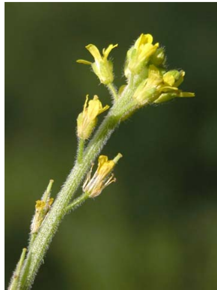
Sisymbrium officinale Hedge Mustard Introduced Annual Brassicaceae