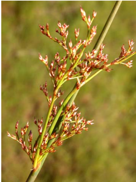
Juncus patens Spreading Rush Native Perennial Juncaceae