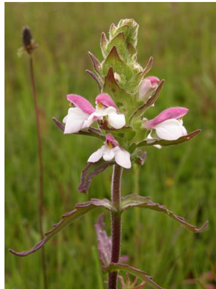
Bellardia trixago Bellardia Introduced Annual Scrophulariaceae