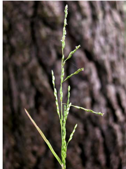
Melica imperfecta Coast Range Melic Grass Native Perennial Poaceae