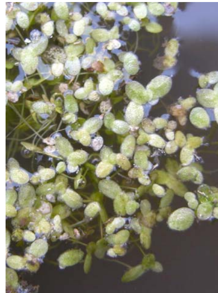
Lemna minor Common Lesser Duckweed Native Perennial Lemnaceae