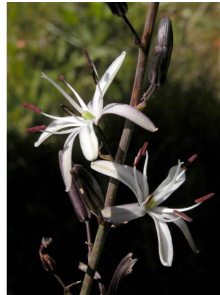
Chlorogalum pomeridianum var. pomeridianum Common Soap Plant Native Perennial Liliaceae