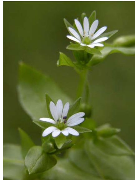
Stellaria media Common Chickweed Introduced Annual Caryophyllaceae