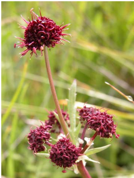
Sanicula bipinnatifida Purple Sanicle Native Perennial Apiaceae