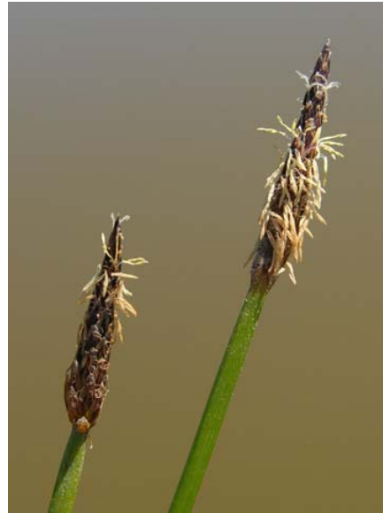
Eleocharis macrostachya Common Spikerush Native Perennial Cyperaceae