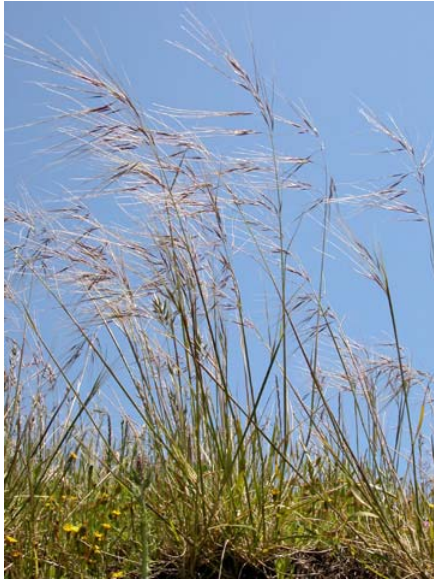
Nassella pulchra Purple Needle Grass Native Perennial Poaceae