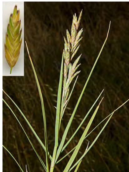
SALT GRASS ( Distichlis spicata ) Native Perennial - Grass Family - (Apr-Sep) - Salt marshes, coastal dunes, moist, alkaline areas - Stem 4-20" long. Leaves 0.8-4" long, flat, stiff. Flower cluster 0.8-3" long, narrow. Spikelets straw-colored to purple, 2-20/group, 0.24-0.8" long.