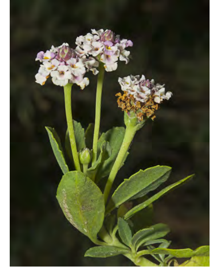
LEMON VERBENA ( Phyla nodiflora ) Native Perennial - Vervain Family - (May–Nov) - Wet places, pond margins - Mat-like. Leaf blade 0.2-1.2" long, < 0.4" wide, 5-11 teeth. Flowers white to red. Flower stem 0.6-3.5" tall. Ornamental.