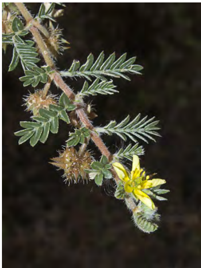
PUNCTURE VINE ( Tribulus terrestris ) Naturalized Annual - Caltrop Family - (Apr–Oct) - Dry, disturbed areas incl roadsides, railways, vacant lots - Sprawling. Leaflets 6-12. Flowers yellow, < 0.2" wide. Fruits star-like, spines 0.16-0.28" long. NOXIOUS.