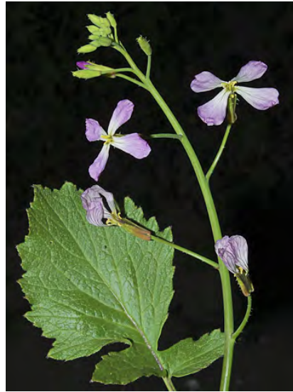
RADISH ( Raphanus sativus ) Naturalized Annual - Mustard Family - (May-Jul) - Disturbed areas, fields - Stem 16-51" long. Petals 0.6-1" long, white to purple. Fruit a fat cylinder w/constrictions between seeds. INVASIVE weed.