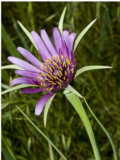
PURPLE SALSIFY ( Tragopogon porrifolius ) Naturalized Biennial-Perennial - Sunflower Family - (Mar-Nov) - Common. Disturbed places - Plant 16-39" tall, milky sap. Leaves 0.8-1.6" long, very narrow, waxy blue. Flowers purple.