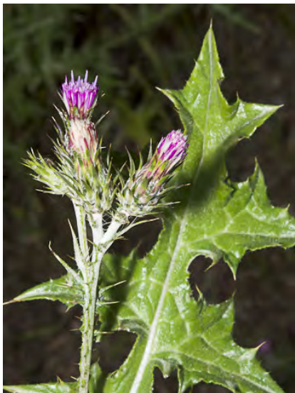
ITALIAN THISTLE ( Carduus pycnocephalus subsp. pycnocephalus ) Naturalized Annual - Sunflower Family - (Mar-Jul) - Roadsides, pastures, disturbed areas - Stems 8-79", narrow spiny-wings. Lower leaves 4-10 lobed, heads 2-5, flower bracts woolly. NOXIOUS.