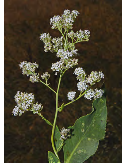
PERENNIAL PEPPERGRASS ( Lepidium latifolium ) Naturalized Perennial - Mustard Family - (Jun–Sep) - Pastures, disturbed areas, fields, grassland, saline meadows, streambanks, sagebrush scrub, edge of marshes - Plant 14-47". Petals white. NOXIOUS.