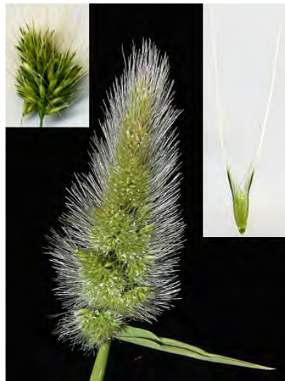
RABBITFOOT GRASS ( Polyopogon monspeliensis ) Naturalized Annual - Grass Family - (Apr-Aug) - Moist places, along streams - Stem 8-39". Leaf 0.4-8" long, 0.16-0.24" wide. Flower cluster 0.4-6.7" long, plume-like. Glume awn > 0.14". Lemma awn gen < 0.1". INVASIVE.