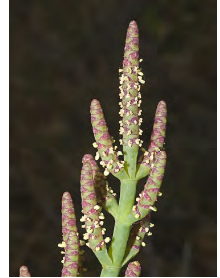
PACIFIC PICKLEWEED ( Salicornia pacifica ) Native Perennial - Goosefoot Family - (Jul-Nov) - Salt marshes, alkaline flats - Plant 4-28" tall, branching from base, branches opposite. Flower clusters 0.8-3.3" long, 0.1-0.2" wide.