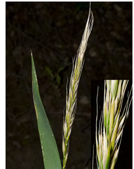
BEARDLESS WILD RYE ( Elymus triticoides ) Native Perennial - Grass Family - (Jun-Jul) - Dry to moist, often saline, meadows - Plant 18-50" tall, from rhizomes. Flower cluster 2-8" long. Spikelets generally 2/node. Lemmas 3-7, 0.2-0.5" long, awn to 0.12" long.