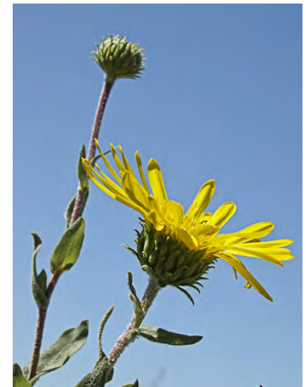
MARSH GUMPLANT ( Grindelia stricta var. angustifolia ) Native Perennial - Sunflower Family - (May-Dec) - Tidal wetlands - Plant 3.3-6.6' tall, woody base, evergreen. Leaves 0.4-6" long, fleshy, not resinous. Flower rays yellow, 16-56, 0.5-0.7" long.