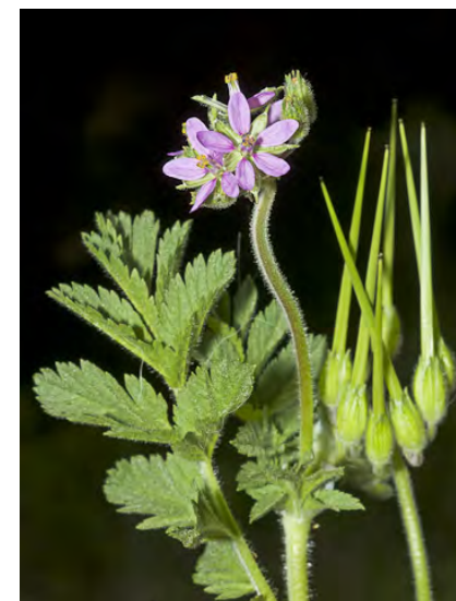
GREENSTEM FILAREE ( Erodium moschatum ) Naturalized Annual - Geranium Family - (Feb-Sep) - Open, disturbed sites - Stem 4-24", short-hairy. Leaves compound, leaflets toothed. Sepal tip glabrous. Petals 0.4-0.6" long, pink. Fruit beak 0.8-1.6" long.