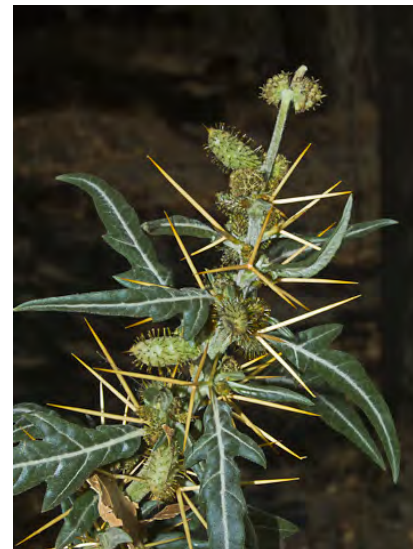
SPINY COCKLEBUR ( Xanthium spinosum ) Native Annual - Sunflower Family - (Jul-Oct) - Disturbed, seasonally wet, often alkaline sites, in grassland, marshes, watercourses - Plant 4-24". Stem node spines 0.6-1.2" long, golden, gen 3-lobed. Bur 0.4-0.5" long.