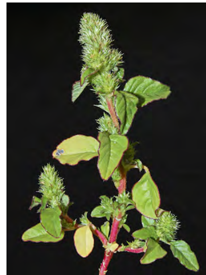
REDROOT PIGWEED ( Amaranthus retroflexus ) Naturalized Annual - Amaranth Family - (Jun-Nov) - Common. Wet fields, roadside ditches, waste places, agricultural fields - Stem upright, 0.5-6' tall. Flower clusters green, dense, at leaf bases and stem tips.