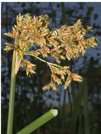
SOUTHERN BULRUSH ( Schoenoplectus californicus ) Native Perennial - Sedge Family - (Spring-summer) - Common. Brackish to fresh marshes, shores - Stem 3.3-13' tall, slender, bright green, bluntly 3-angled. Flower cluster somewhat open.