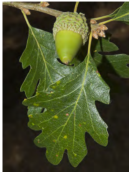
VALLEY OAK ( Quercus lobata ) Native Perennial - Oak Family - (Mar–Apr) - Slopes, valleys, savanna - Tree < 115' tall, deciduous. Leaves 2–5" long, not leathery, deeply lobed, lobes without bristles. Acorns 1.2–2" long, slender, cup 0.4–1.2" deep.