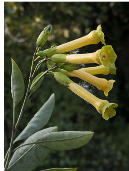
TREE TOBACCO ( Nicotiana glauca ) Naturalized Perennial - Nightshade Family - (Apr-Aug) - Open, disturbed flats or slopes - Shrub or small tree, waxy-blue. Leaves 2-8" long. Flowers yellow, 1.2-1.4" long. INVASIVE. TOXIC to livestock.