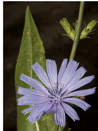
CHICORY ( Cichorium intybus ) Naturalized Perennial - Sunflower Family - (Apr-Oct) - Common. Roadsides, disturbed places - Plants 16-78" tall. Stems leafless. Leaves dandelion-like. Flowers pale blue, 0.8-1.6" wide. Roots roasted as coffee substitute.