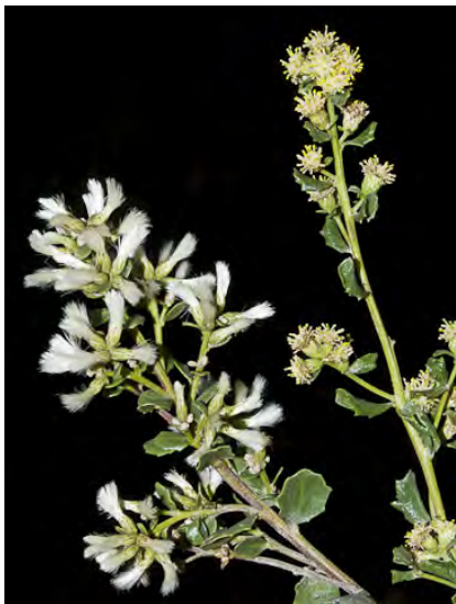
COYOTE BRUSH ( Baccharis pilularis subsp. consanguinea ) Native Perennial - Sunflower Family - (Jul-Dec) - Coastal bluffs, woodland, grassland, disturbed sites, occ on serpentine - Shrub < 15' tall, brittle, common. Leaves gen 0.6-1.6" long.