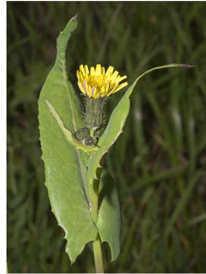
COMMON SOW THISTLE ( Sonchus oleraceus ) Naturalized Annual - Sunflower Family - (All year) - Abundant. Disturbed places - Plant 4–55" tall. Leaf teeth soft to touch. Basal lobes of upper leaves sharply pointed, straight to curving upward.