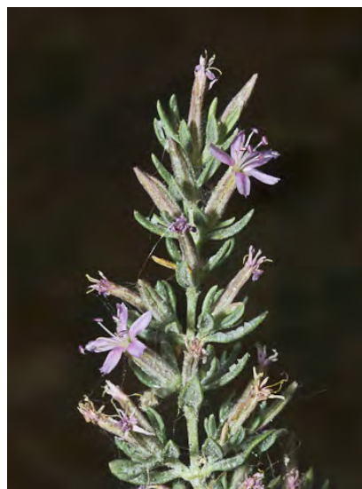
ALKALI HEATH ( Frankenia salina ) Native Perennial - Frankenia Family - (Apr-Sep) - Salt marshes, alkali flats - Matted subshrub, to 1' tall. Leaf blade 0.16-0.6" long, <= 0.24" wide. Petals white to pink or blue-purple, 0.24-0.55" long; gen 6 stamens.