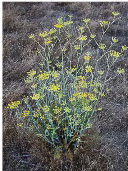
FENNEL ( Foeniculum vulgare ) Naturalized Perennial - Carrot Family - (May–Sep) - Roadsides, disturbed sites - Plants 3-6.5' tall, anise-scented. Stems waxy-blue, canelike. Flowers yellow. Leaf segments thread-like, edible when young. INVASIVE weed.