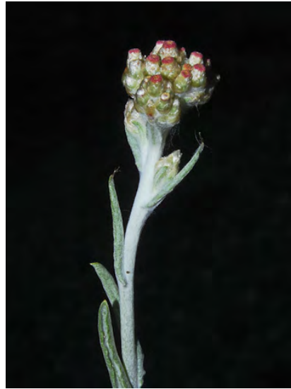
WEEDY CUDWEED ( Pseudognaphalium luteoalbum ) Naturalized Annual - Sunflower Family - (Apr-Aug) - Disturbed sites, fields, streambeds - Heads 0.12-0.16" long, yellowish, female flowers < 0.08" long, pappus bristles connected.