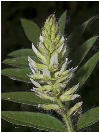
WILD LICORICE ( Glycyrrhiza lepidota ) Native Perennial - Pea Family - (May–Jul) - In colonies, moist, gen open, disturbed areas incl streambanks, roadsides, alkaline soils or not - Plant to 47" tall. Leaflets 9-19. Flowers whitish, 0.43-0.55". Fruit w/hooked prickles.