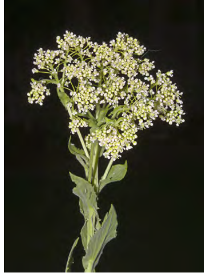
HEART-PODDED HOARY CRESS ( Lepidium draba ) Naturalized Perennial - Mustard Family - (Apr–Aug) - Disturbed areas, saline soils, pastures, fields - Stem gen 9-26" tall. Flowers white. Sepals smooth. Fruit smooth, heart-shaped. NOXIOUS weed.