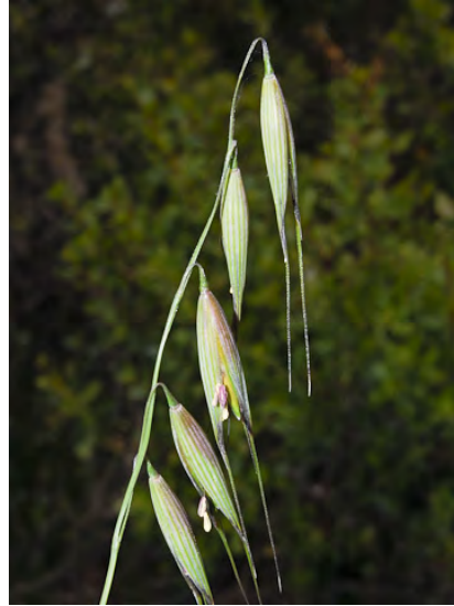
WILD OAT ( Avena fatua ) Naturalized Annual - Grass Family - (Apr-Jun) - Disturbed sites - Plants 1-5' tall. Spikelets 0.7-1.3" long. Low awn 1-1.6" long. Lemma tip bristles < 0.04 " long. Seeds EDIBLE whole or ground for flour. INVASIVE weed.