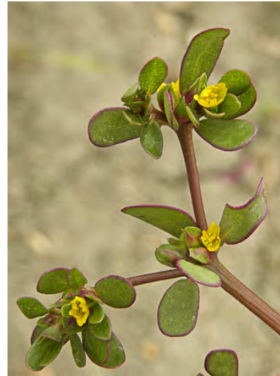
PURSLANE ( Portulaca oleracea ) Naturalized Perennial - Purslane Family - (Late spring-early fall) - Disturbed soil - Stem 1.2-16" long, spreading. Leaves 0.12-1.2" long, ~ spoon-shaped, flat. Flowers solitary. Petals yellow, 4-6, 0.12-0.2" long.