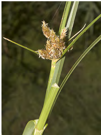
SEACOAST BULRUSH ( Bolboschoenus robustus ) Native Perennial - Sedge Family - (Summer) - Brackish to saline coastal marshes - Plant 20-60" tall. Stem sharply triangular. Flower cluster dense, stemless, just above bracts. Spikelets 5-25, 0.4-1.2" long.