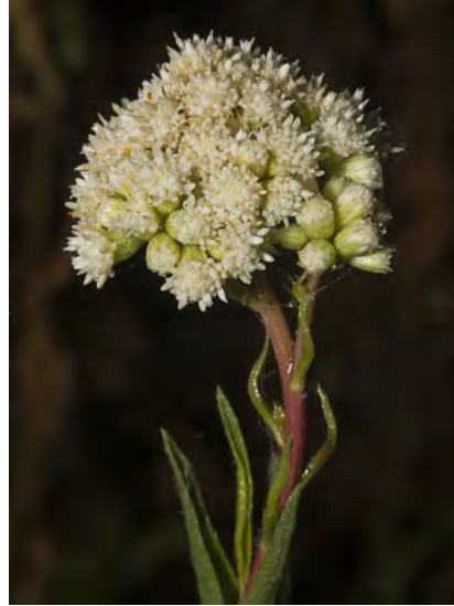
MARSH BACCHARIS ( Baccharis glutinosa ) Native Perennial - Sunflower Family - (Jul–Oct) - Coastal freshwater and saltwater marshes, streambanks - Plant herbaceous, sticky, 3-6' tall. Leaf blades lance-shaped, < 5" long, 0.5-1.2" wide.