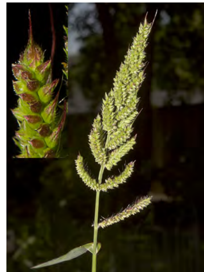
BARNYARD GRASS ( Echinochloa crus-galli ) Naturalized Annual - Grass Family - (Jun-Oct) - Gen wet, disturbed sites, fields, roadsides - Stem 12-39" long. Leaf blades to 25" long, 0.2-1.2" wide. Spikelet 0.1-0.16" long, floret \sim 0.14 " long, 1 per node. Awns 0-2" long on same plant.