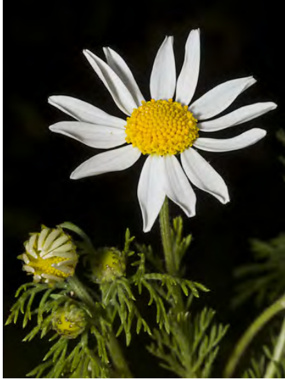
MAYWEED ( Anthemis cotula ) Naturalized Annual - Sunflower Family - (Apr–Aug) - Common. Disturbed areas, fields, coastal dunes, chaparral, oak woodland - Leaves finely divided into thread-like lobes. Flowers > 0.6" wide, many on top of a well-branched stem.