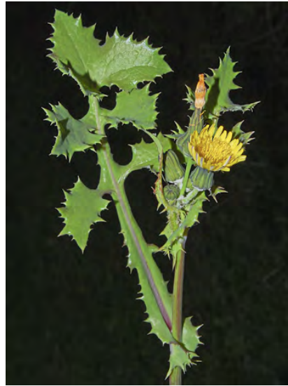
PRICKLY SOW THISTLE ( Sonchus asper subsp. asper ) Naturalized Annual - Sunflower Family - (All year) - Common. Slightly moist disturbed sites, along streams - Plant 4–48". Leaf teeth prickly. Basal lobes of upper leaves rounded, curving downward.