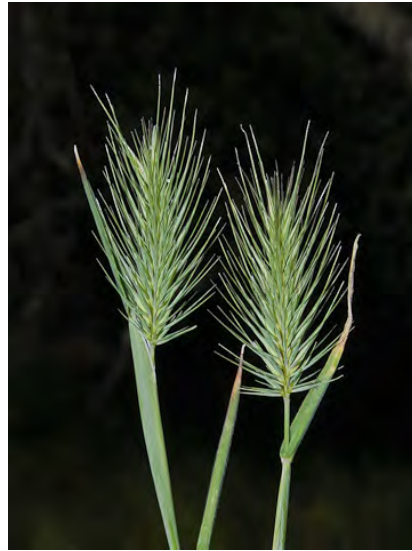
MEDITERRANEAN BARLEY ( Hordeum marinum subsp. gussoneanum ) Naturalized Annual - Grass Family - (Apr-Jun) - Dry to moist, disturbed sites - Stem 4-20". Leaf blades to 32" long, auricles < 0.08". Central lemma awn 0.25-0.7" long. INVASIVE weed.