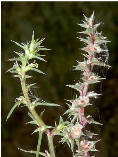
RUSSIAN THISTLE ( Salsola tragus ) Naturalized Annual-Perennial - Goosefoot Family - (Jul-Oct) - Common. Disturbed places - Plant < 5' tall. Stem gen red-stripped, widely branched. Leaves succulent, 0.3-2" long, upper spine-tipped. NOXIOUS.