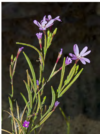
PANICLED / WEEDY WILLOWHERB ( Epilobium brachycarpum ) Native Annual - Evening Primrose Family - (Jun-Sep) - Common. Dry open or disturbed woodland, grassland, roadsides - Plant 8-79" tall, diffuse. Petals 2-15 mm long, white to rose-purple.