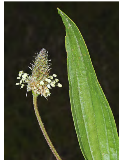
ENGLISH PLANTAIN ( Plantago lanceolata ) Naturalized Annual - Plantain Family - (Apr–Aug) - Common. Disturbed areas - Leaves basal, hairy, 2-10" long, <= 1" wide. Flowers + stem 8-31" tall, flower cluster 0.8-3" long. INVASIVE, lawn weed.