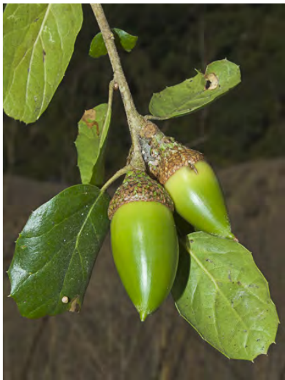
COAST LIVE OAK ( Quercus agrifolia var. agrifolia ) Native Perennial - Oak Family - (Mar–Apr) - Valleys, slopes, mixed-evergreen forest, woodland - Tree 30–80'. Leaves convex, hair-tuft below in vein axils. Acorns on 1st year twigs, shell glabrous inside.