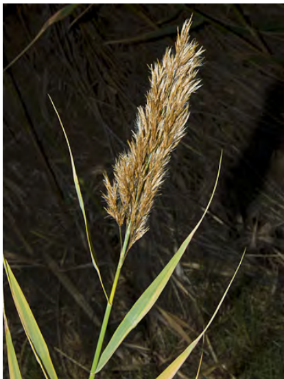
COMMON REED ( Phragmites australis ) Native Perennial - Grass Family - (Jul-Nov) - Pond & lake margins, sloughs, marshes - Stem 6.6-13', gen < 0.4" diam. Leaf blades gen 8-18" long, base gradually narrowed. Flower cluster 6-20". Spikelet 0.4-0.6", lemmas smooth.