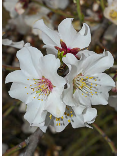
ALMOND ( Prunus dulcis ) Naturalized Perennial - Rose Family - (Feb-Mar) - Canyons, roadsides, grassland (as waif) - Tree 16-26' tall. Leaf blades 1-4" long. Flowers 1-3/cluster. Petals pink to nearly white, 0.5-1" long. Fruit 1-1.6" long, hairy. Cultivar.