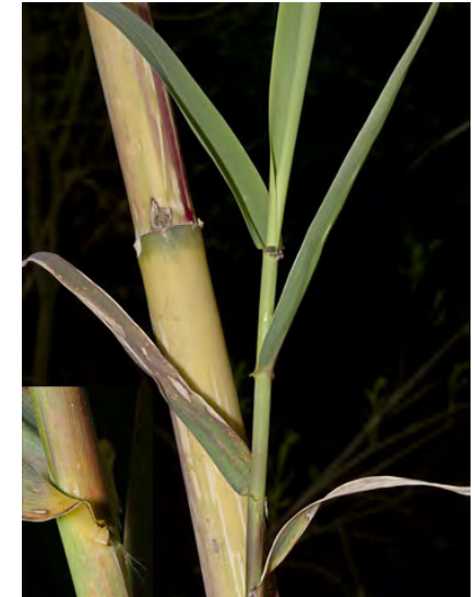
GIANT REED ( Arundo donax ) Naturalized Perennial - Grass Family - (Mar–Sep) - Moist places, seeps, ditchbanks - Stem 6-33' tall, matures woody. Leaves evenly spaced on stem. Flower cluster 8-28" tall, up to 5" wide. Spikelet ~0.5" long. NOXIOUS weed.