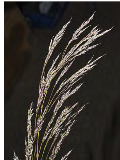
SMILO GRASS ( Stipa miliacea var. miliacea ) Naturalized Perennial - Grass Family - (Mar-Sep) - Salt marshes, streambanks, chaparral, open woodland, disturbed - Stems green, large tufts, sheaths lt. Inflor arching. INVASIVE weed.