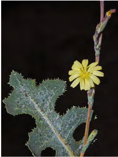
PRICKLY LETTUCE ( Lactuca serriola ) Naturalized Annual - Sunflower Family - (May–Oct) - Abundant. Disturbed places - Stem 1.6–10' tall, prickly-bristly. Leaves deeply-lobed, midvein and edges prickly-bristly. Flowers pale yellow, 0.16–0.2" wide.