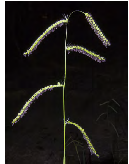
DALLIS GRASS ( Paspalum dilatatum ) Naturalized Perennial - Grass Family - (May-Nov) - Disturbed areas - Tufted, weedy. Stem 1.6-5.7' tall. Leaves to 14" long. Flowering stem w/3-6 branches. Spikelet groups 2-7, each 0.6-4.7" long. Spikelets ~0.14", paired.