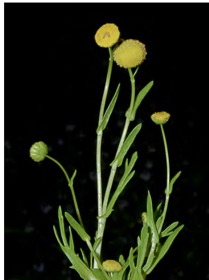
BRASS-BUTTONS ( Cotula coronopifolia ) Naturalized Perennial - Sunflower Family - (Mar-Dec) - Common. Saline and freshwater marshes, mud flats - Plant 2-16"+ tall, smooth, ± fleshy. Leaves linear to lance-shaped w/linear teeth or lobes. INVASIVE.