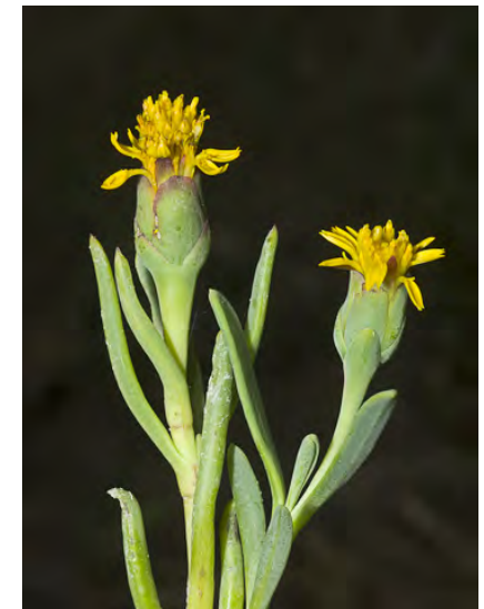
FLESHY JAUMEA ( Jaumea carnosa ) Native Perennial - Sunflower Family - (Apr-Dec) - Coastal salt marshes, bases of sea cliffs - Stem trailing. Leaf gen 0.6-2" long, fleshy. Flower head yellow, 0.5-0.8" long; rays 0.4-0.2" long, disks ~ 0.25" long. Aromatic.