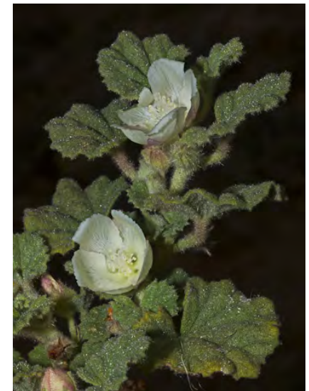
ALKAL-MALLOW ( Malvella leprosa ) Native Perennial - Mallow Family - (Apr-Nov) - Valleys, gen saline - Stem 4-16" long. Leaf blade 0.4-1.4" long, toothed, densely short-hairy. Petals cream-white to yellow, 0.4-0.6" long.