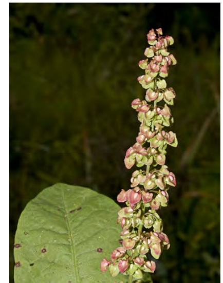
CURLY DOCK ( Rumex crispus ) Naturalized Perennial - Buckwheat Family - (All year) - Abundant. Disturbed places - Stem 16-39" tall. Flower cluster dense, valves 0.2-0.24", winged around tubercles, smooth edged. 1 tubercle enlarged. INVASIVE.