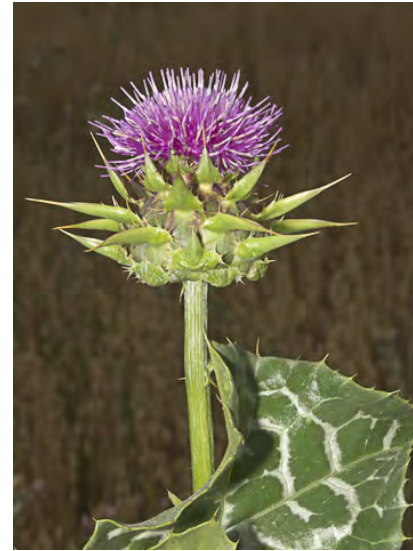
MILK THISTLE ( Silybum marianum ) Naturalized Annual-Biennial - Sunflower Family - (Feb-Jun) - Roadsides, pastures, disturbed areas - Stem 1-10', stout. Leaves spiny, shiny green w/white veins and spots. Flowers red-purple. INVASIVE weed.