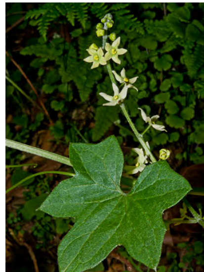
CALIFORNIA MAN-ROOT ( Marah fabacea ) Native Perennial - Gourd Family - (Feb-Apr) - Streamsides, washes, shrubby open areas - Vine 6-20' long. Leaves moderately lobed. Flowers cream or white, < 0.3" wide. Fruit spiny all over.