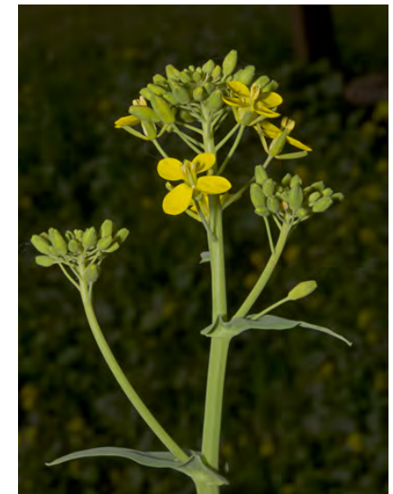
TURNIP ( Brassica rapa ) Naturalized Annual - Mustard Family - (Jan–May) - Disturbed areas - Stem 8-40" tall. Leaves clasping, upper smooth-edged & waxy. Petals yellow, 0.2-0.4" long, stalk 0.3-1"; fruit beak > 0.4". INVASIVE weed.