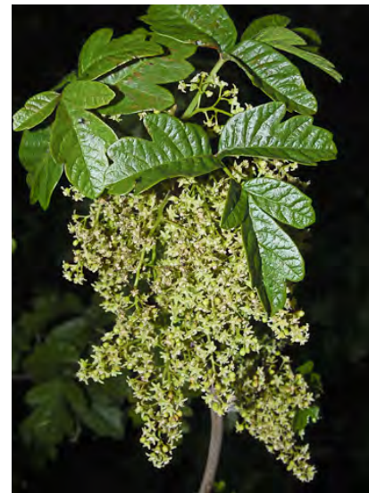
WESTERN POISON OAK ( Toxicodendron diversilobum ) Native Perennial - Sumac Family - (Apr–Jun) - Canyons, slopes, chaparral, coastal scrub, oak woodland - Shrub or vine. Leaflets 3, red in fall, mid leaflet stalked. Flowers green. Fruits white. TOXIC.