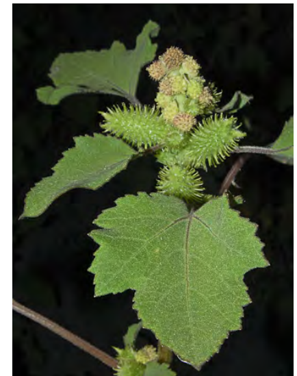
COCKLEBUR ( Xanthium strumarium ) Native Annual - Sunflower Family - (Jul-Oct) - Disturbed, seasonally wet, often alkaline sites, in grassland, marshes, watercourses - Plant 4-32" tall. Stem spineless. Bur 0.4-1.2"+ long.