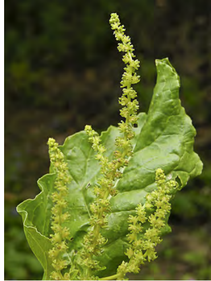
SEA BEET ( Beta vulgaris subsp. maritima ) Naturalized Annual - Goosefoot Family - (Feb-Sep) - Moist sandy places, disturbed areas - Plant succulent. Stem < 32" tall. Leaf blades < 4" long. Fruits fall in clusters.