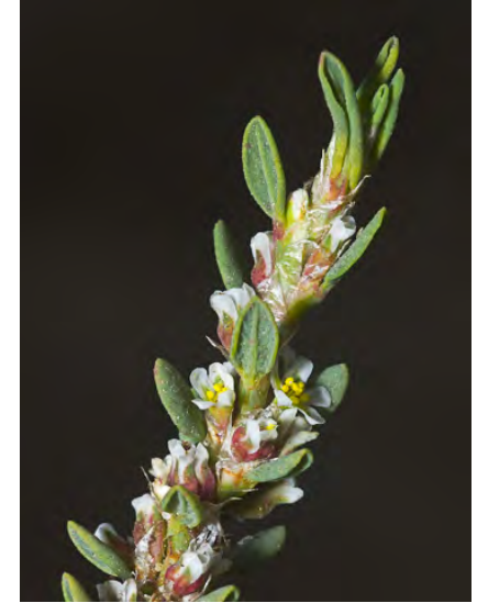
KNOTWEED ( Polygonum aviculare subsp. depressum ) Naturalized Annual - Buckwheat Family - (May-Nov) - Disturbed places - Stem 4-20", mat-forming. Flowers 2-8/leaf axil, ~0.1" long, fused 1/2 length, w/white or pink margins.