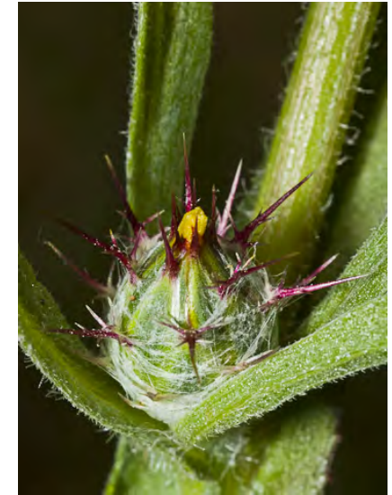
TOCALOTE ( Centaurea melitensis ) Naturalized Annual - Sunflower Family - (Apr-Jul) - Disturbed fields, open woodland - Plant 4-39", gray-hairy, resinous. Leaves 0.8-6" long. Flowers yellow, 0.4-0.8" long, bracts tipped w/purple spines. NOXIOUS weed.