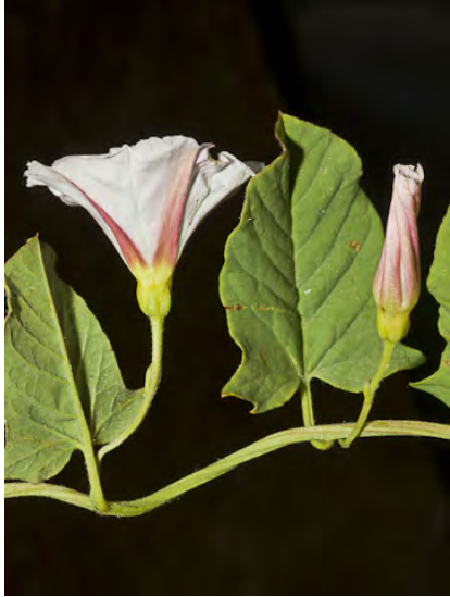
BINDWEED ( Convolvulus arvensis ) Naturalized Perennial - Morning-glory Family - (Mar–Oct) - Roadsides, open areas in many pl communities - Trailing. Leaf 0.8-1.2" long, w/round tip, pointed lobes. Flowers white to pink, 0.8-1" long. NOXIOUS.