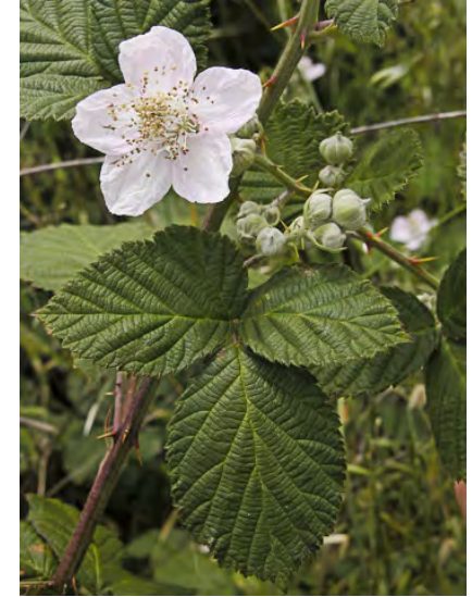
HIMALAYAN BLACKBERRY ( Rubus armeniacus ) Naturalized Perennial - Rose Family - (Mar-Jun) - Common. Disturbed areas, roadsides - Shrub w/thorny 5-angled stem. Leaflets 3-5, white-hairy beneath. Blackberry-type fruit. INVASIVE.