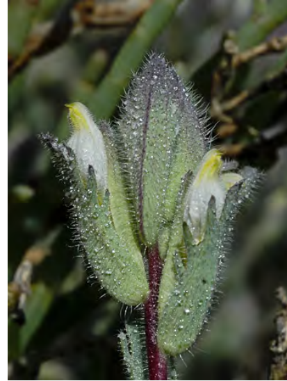
SOFT SALTY BIRD'S-BEAK ( Chloropyron molle subsp. molle ) Native Annual - Broom-rape Family - (Jul-Nov) - Coastal salt marshes - Plant 4-16" tall, gen soft-hairy. Flowers white to yellowish, 0.6-0.8" long. Fed: ENDANGERED Cal: RARE.