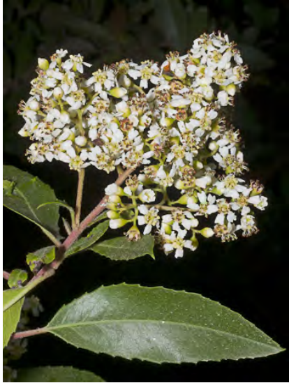
CHRISTMAS BERRY / TOYON ( Heteromeles arbutifolia ) Native Perennial - Rose Family - ((May)Jun-Aug) - Chaparral, oak woodland, mixed-evergreen forest - Shrub-tree < 33' tall, evergreen. Leaf 2-4" long. Petals white, < 0.16" long. Fruit bright red.