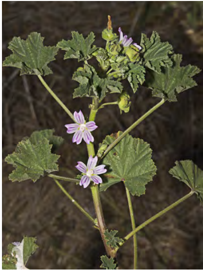
BULL MALLOW ( Malva nicaeensis ) Naturalized Annual - Mallow Family - (Mar-Jun) - Disturbed places - Stem 0.7-2'. Leaf blade 1.2-4.7" wide, 5-7 shallow lobes. Bractlets egg-shaped, 0.16-0.2" long. Petals pink to blue-violet, 0.2-0.5" long.