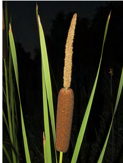
NARROW-LEAVED CATTAIL ( Typha angustifolia ) Native Perennial - Cattail Family - (May–Aug) - Nutrient-rich freshwater to brackish marshes, wet disturbed places - Plant 4.9-9.8' tall. Leaves gen < 0.4" wide. Flower cluster gap > 0.4".