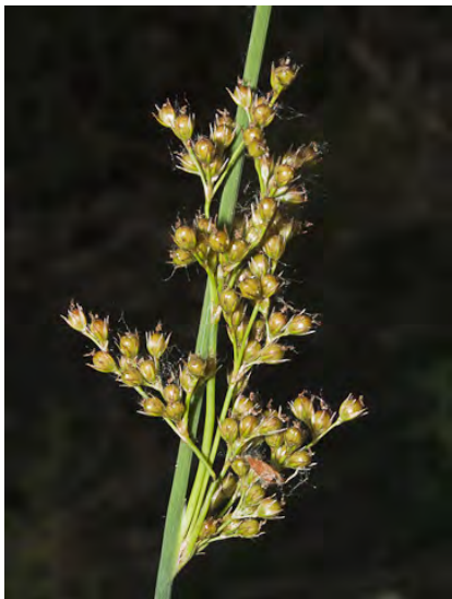
SPREADING RUSH ( Juncus patens ) Native Perennial - Rush Family - (Jun-Oct) - Marshy places, creeks, seeps - Plant 12-41" tall, densely tufted. Stems blue-gray-green & distinctly grooved when fresh. Stamens 6.