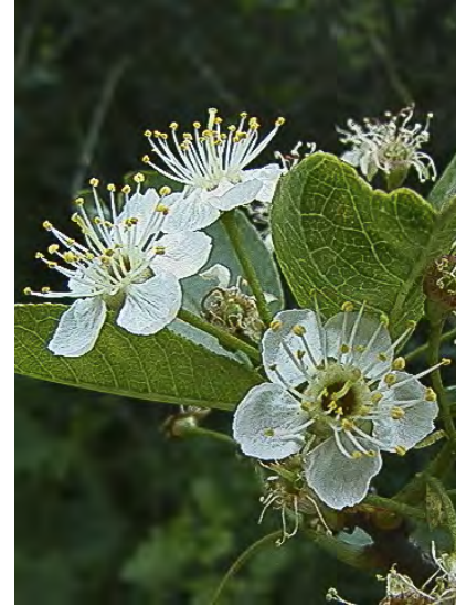
BITTER CHERRY ( Prunus emarginata ) Native Perennial - Rose Family - (Apr-Jun) - Rocky slopes, canyons, chaparral, mixed-evergreen, conifer forest - Shrub/tree < 50'. Leaf: stem 0.1-0.5", blade 0.6-2.4" long. Petals white, 0.12-0.3" long. Fruit red to purple.