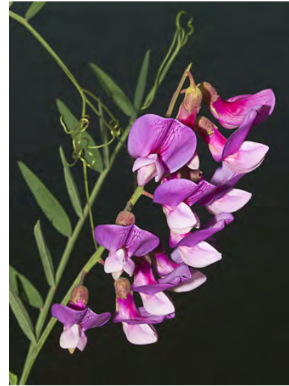
DELTA TULE PEA ( Lathyrus jepsonii var. jepsonii ) Native Perennial - Pea Family - (Apr-Aug) - Coastal, estuarine marshes - Plant < 8' tall, smooth. Stem climbing, winged. Flowers 0.6-0.8" long, pink to pink-purple. CNPS: FAIRLY ENDANGERED.