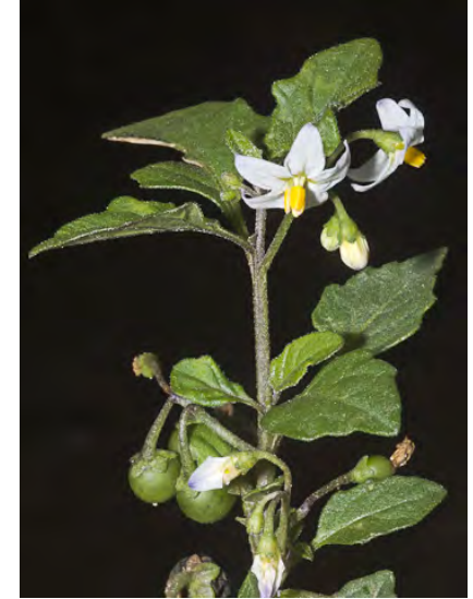
BLACK NIGHTSHADE ( Solanum nigrum ) Naturalized Annual - Nightshade Family - (Mar–Oct) - Disturbed places - Flower 0.4" wide w/deep lobes, white. Anthers 0.08" long. Seeds 0.08". Bracts 0.08-0.12" long, not curled back in fruit.