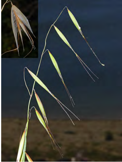
SLENDER WILD OAT ( Avena barbata ) Naturalized Annual - Grass Family - (Mar-Jun) - Disturbed sites - Plants gen 24-32". Spikelets 0.8-1.2" long. Awns 0.8-1.8" long. Lemma tip bristles \geq 0.1 " long. Seeds EDIBLE whole or ground for flour. INVASIVE weed.