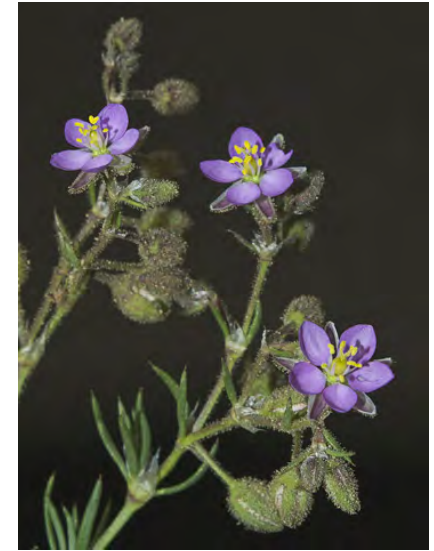
RED SAND-SPURRY ( Spergularia rubra ) Naturalized Annual-Perennial - Pink Family - (Spring-fall) - Forest, meadows, mud flats, disturbed - Plant 1.6-10". Leaf non-fleshy, whorls w/large white bracts. Petals pink. Stamens 6-10. Sepals < 0.16".