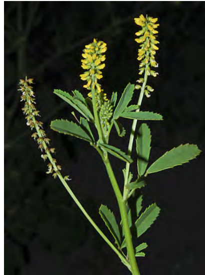
SOURCLOVER ( Melilotus indicus ) Naturalized Annual-Biennial - Pea Family - (Apr-Oct) - Open, disturbed areas - Stem 4-24" long. Leaflets 3, 0.4-1" long. Flowers yellow, ~0.1" long.