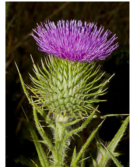
BULL THISTLE ( Cirsium vulgare ) Naturalized Biennial - Sunflower Family - (May-Oct) - Common. Disturbed areas - Plant 12-79" tall. Top of leaves bristly; leaf base forming decurrent wings on stem. Flowers purple, gen 1-2" wide. NOXIOUS weed.