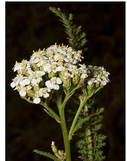
YARROW ( Achillea millefolium ) Native Perennial - Sunflower Family - (Apr–Sep) - Many habitats - Plant 4"-7" tall. Stem white-hairy. Leaves finely dissected. Flower cluster flat-topped. Flowers white to pink. Widely used in folk medicine.