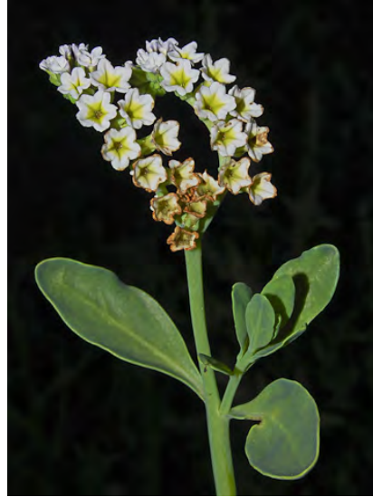
SEASIDE HELIOTROPE ( Heliotropium curassavicum var. oculatum ) Native Perennial - Borage Family - (Feb-Oct) - Moist to dry, saline to alkaline soils, gen near water - Plant fleshy. Leaf 0.4-2.4 cm long. Flowers white w/ yellow center, 0.12-0.2" long.