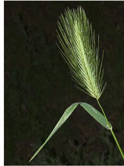
HARE BARLEY ( Hordeum murinum subsp. leporinum ) Naturalized Annual - Grass Family - (Feb-May) - Moist, gen disturbed sites. Common - Stem 12-43" tall. Central spikelet stalk ~0.06" long. Central floret << lateral florets. INVASIVE weed.