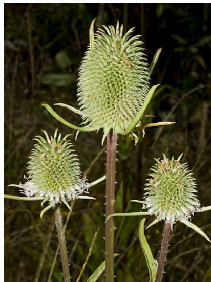
FULLER'S TEASEL ( Dipsacus sativus ) Naturalized Biennial - Teasel Family - (May-Jul) - Disturbed areas, fields, vacant lots, pastures - Plant gen < 6' tall. Leaf pairs fused around stem. Flower cluster lavender, 5-10 cm long, bracts spreading. INVASIVE weed.