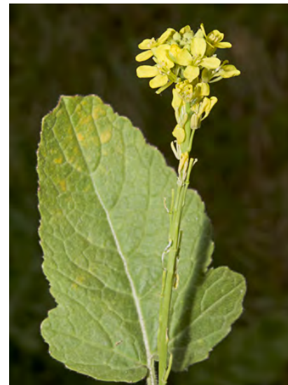
BLACK MUSTARD ( Brassica nigra ) Naturalized Annual - Mustard Family - (Apr–Sep) - Common. Disturbed areas, fields - Plant 1-6' tall. Petals bright yellow, 0.3-0.4" long. Fruit upright, pressed against stem. INVASIVE weed.