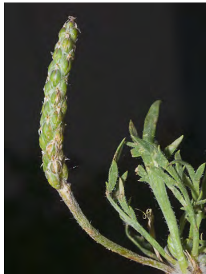
CUT-LEAF PLANTAIN ( Plantago coronopus ) Native Annual-Biennial - Plantain Family - (Apr-Jul) - Coastal bluffs, salt marshes, trampled places, chaparral, grassy flats - Leaves 1.6-10" long, tooth-like lobes. Flower: stems 1-6, 2-20" tall, cluster 0.8-8" long.