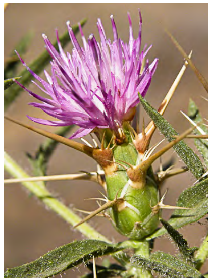
PURPLE STAR-THISTLE ( Centaurea calcitrapa ) Naturalized Annual-Biennial - Sunflower Family - (Apr-Nov) - Pastures, disturbed places - Plant 8-40"+. Basal leaves 1-2x divided into narrow lobes. Flowers purple with spiny bracts. NOXIOUS weed.