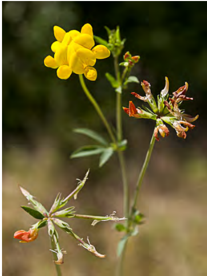
BIRD'S-FOOT TREFOIL ( Lotus corniculatus ) Naturalized Perennial - Pea Family - (Jun-Sep) - Open, disturbed areas - Leaflets 5, 0.16-0.9" long. Flower cluster 3-7 flowered on 0.6-4.7" stalk. Flowers bright yellow, 0.4-0.55" long, banner often reddish.