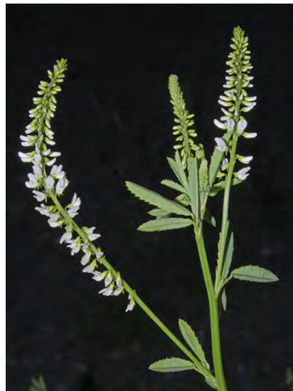
WHITE SWEETCLOVER ( Melilotus albus ) Naturalized Annual-Biennial - Pea Family - (May–Sep) - Locally abundant. Pastures, open disturbed sites - Stem 1.6-6.6' long. Leaflets 3, 0.4-1" long, toothed. Flowers white, 0.14-0.2" long.