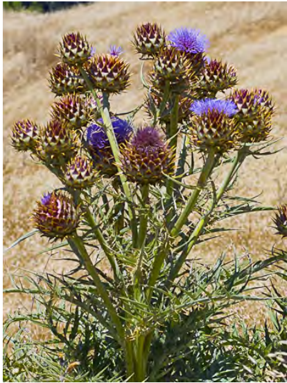
ARTICHOKE THISTLE ( Cynara cardunculus subsp. flavescens ) Naturalized Perennial - Sunflower Family - (Apr-Jul) - Disturbed places - Plant 1.6-8' tall. Artichoke head 1.6-6" diam, spine-tipped. Flowers blue or purple, 1.2-2" long. NOXIOUS weed.