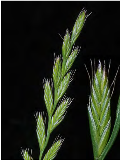
RYE GRASS ( Festuca perennis ) Naturalized Perennial - Grass Family - (May-Sep) - Dry to moist disturbed sites, abandoned fields - Stem 20-40" tall. Spikelet 0.2-0.9" long, > glume, awned or awnless. Sterile shoots at base. INVASIVE weed.