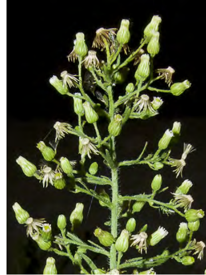
HORSEWEED ( Erigeron canadensis ) Naturalized Annual - Sunflower Family - (All year) - Disturbed places - Plant 8-79" tall. Gen 1 main stem branching above. Disk flowers yellow; rays white or pink, <= 0.04" long. Head bracts 0.12-0.16" tall, 0.08-0.12" wide.