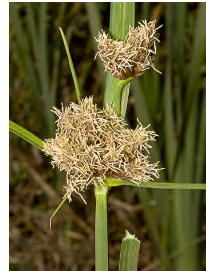
OLNEY'S THREE-SQUARE BULRUSH ( Schoenoplectus americanus ) Native Perennial - Sedge Family - (Summer) - Mineral-rich or brackish marshes, shores, fens, springs - Stem 1.2-8.2' tall, sharply 3-angled, not leafy. Flower cluster head-like.