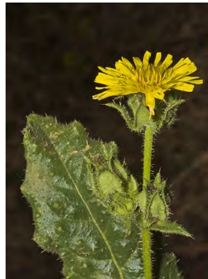
BRISTLY OX-TONGUE ( Helminthotheca echioides ) Naturalized Annual-Biennial - Sunflower Family - (All year) - Common. Disturbed areas - Stem 1-6.5' tall, bristly. Leaf 2-8" long, covered with prickly bumps. Flower heads 0.8-1.6" wide. INVASIVE weed.