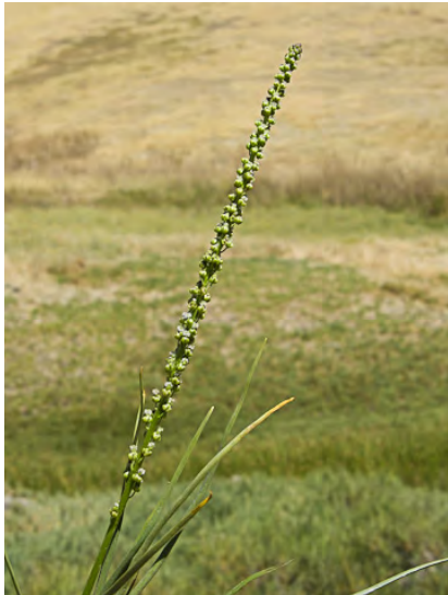
COMMON ARROW-GRASS ( Triglochin maritima ) Native Perennial - Arrow-grass Family - (Apr–Aug) - Coastal salt marshes, interior saline, brackish, alkaline marshes - Plant 16-43" tall, dense-tufted. Leaves 4-32" long, 0.08-0.2" wide. Leaf ligule tip entire to notched.