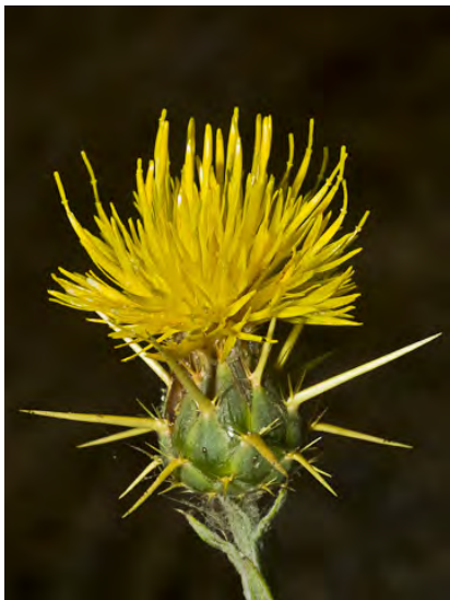
YELLOW STAR-THISTLE ( Centaurea solstitialis ) Naturalized Annual - Sunflower Family - (May-Oct) - Invasive, roadsides, disturbed grassland or woodland - Plant 4-39" tall. Leaves woolly, extend down the stem. Flower bract spines 0.4-1" long. NOXIOUS weed.