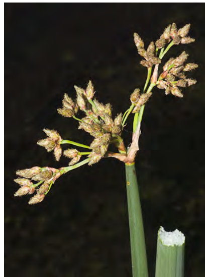
COMMON TULE ( Schoenoplectus acutus var. occidentalis ) Native Perennial - Sedge Family - (Summer) - Common. Marshes, shores, fens, shallow lakes, often emergent - Stem 3.3-13' tall, fat, round x-section, blue-green.