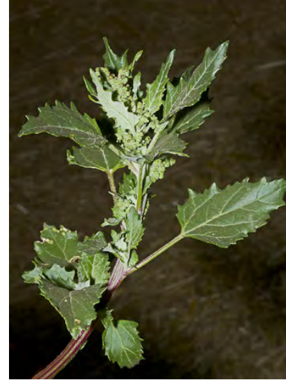
WALL GOOSEFOOT ( Chenopodium murale ) Naturalized Annual - Goosefoot Family - (All year) - Common. Disturbed areas, fields - Plant 6-24" tall. Leaves dark green, shiny, broad, toothed. Seeds horizontal, bumpy, rim angled.