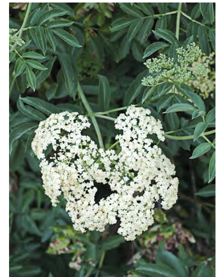
BLUE ELDERBERRY ( Sambucus nigra subsp. caerulea ) Native Perennial - Muskroot Family - (Mar–Sep) - Common. Streambanks, open places in forest - Shrub 7–26' tall. Flower cluster flat-topped, 1.6–13" diam, petals spreading. Fruits waxy blue-black.