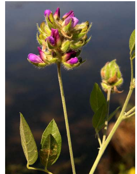
California Tea Rupertia physodes Native Perennial Pea Family