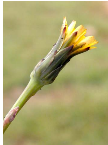
Smooth Cat's-ear Hypochaeris glabra Introduced Annual Sunflower Family