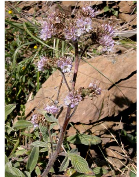
California / Rock Phacelia Phacelia californica Native Perennial Waterleaf Family