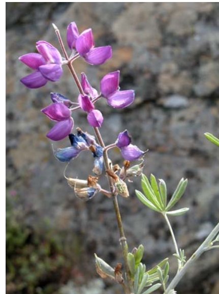
Bay Area Silver Lupine Lupinus albifrons var. collinus Native Perennial Pea Family