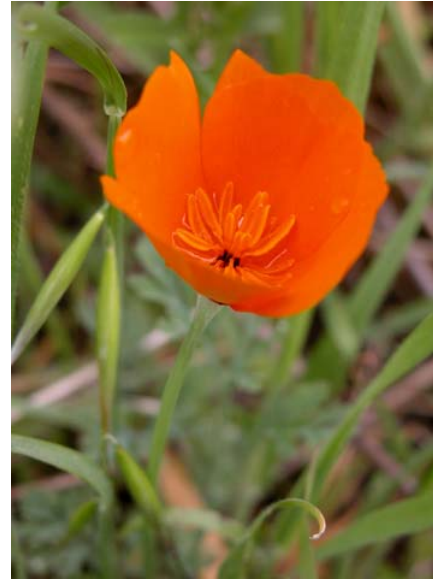
California Poppy Eschscholzia californica Native Perennial Poppy Family