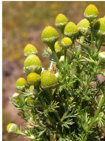
Pineapple Weed Chamomilla suaveolens Introduced Annual Sunflower Family