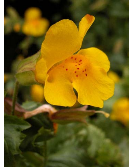
Golden Monkey Flower Mimulus guttatus Native Perennial Snapdragon Family