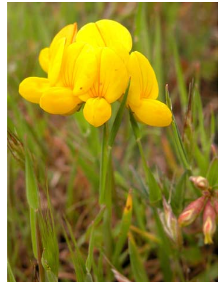
Bird's-foot Deerweed Lotus corniculatus Introduced Perennial Pea Family