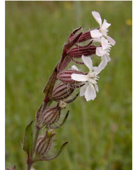
Windmill Pink Silene gallica Introduced Annual Pink Family