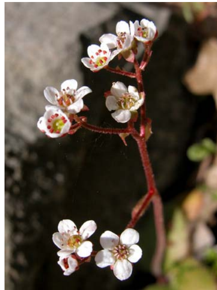
California Saxifrage Saxifraga californica Native Perennial Saxifrage Family