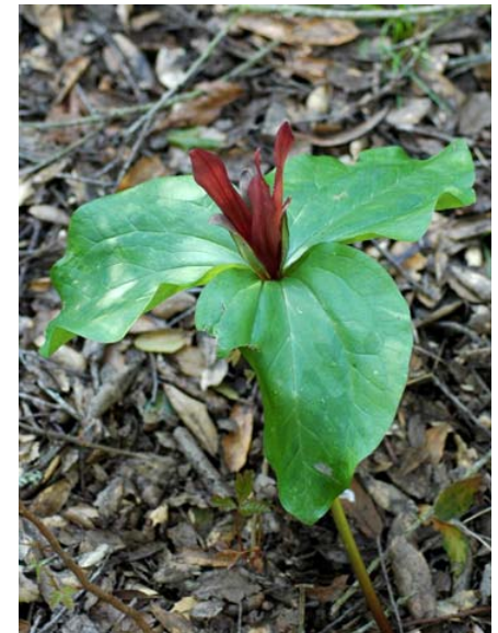
Giant Trillium Trillium chloropetalum Native Perennial Lily Family