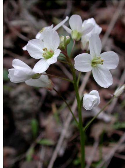
Milkmaids Cardamine californica Native Perennial Mustard Family