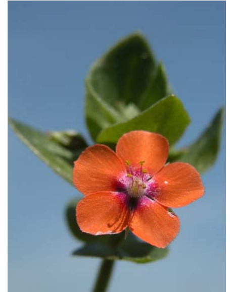
Scarlet Pimpernel Anagallis arvensis Introduced Annual Primrose Family