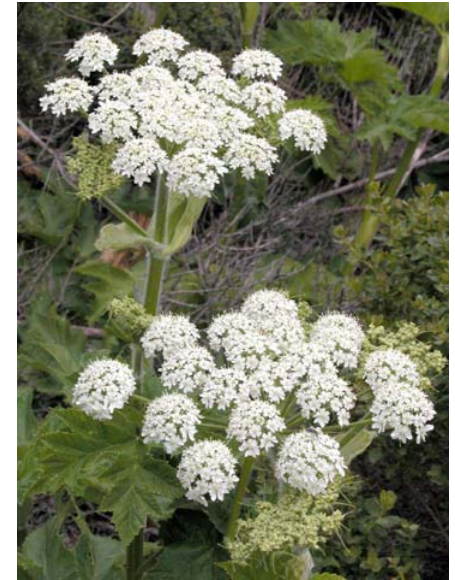
Cow Parsnip Heracleum lanatum Native Perennial Carrot Family