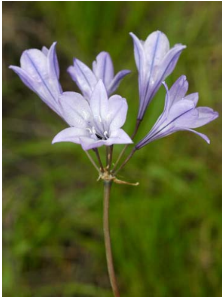
Ithuriel's Spear Triteleia laxa Native Perennial Lily Family