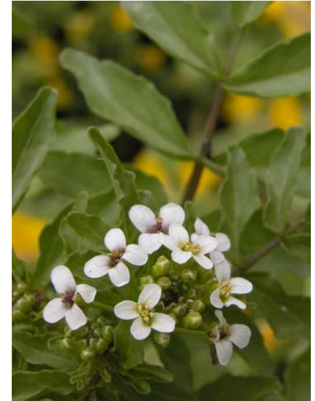
White Water Cress Rorippa nasturtium-aquaticum Native Perennial Mustard Family