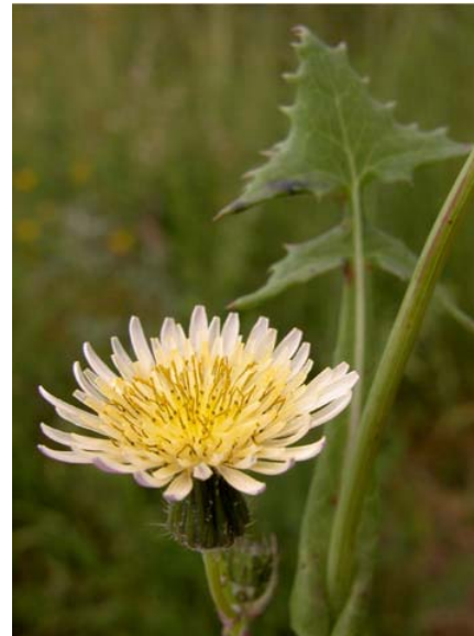
Common Sow Thistle Sonchus oleraceus Introduced Annual Sunflower Family