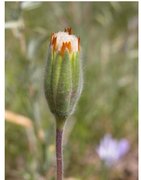
Blow Wives Achyrochaena mollis Native Annual Sunflower Family