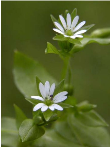
Common Chickweed Stellaria media Introduced Annual Pink Family