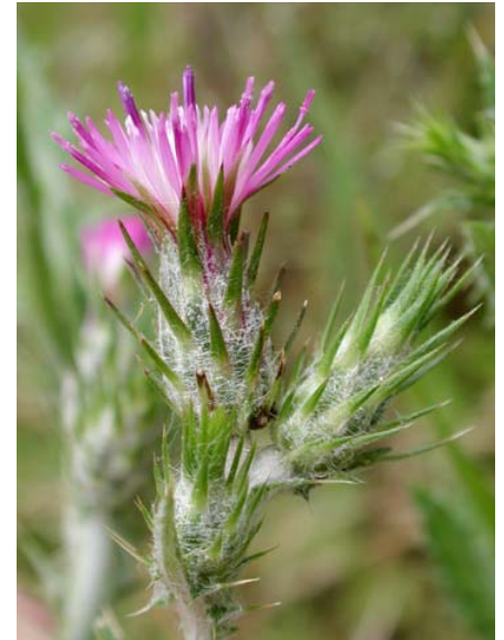
Italian Thistle Carduus pycnocephalus Introduced Annual Sunflower Family