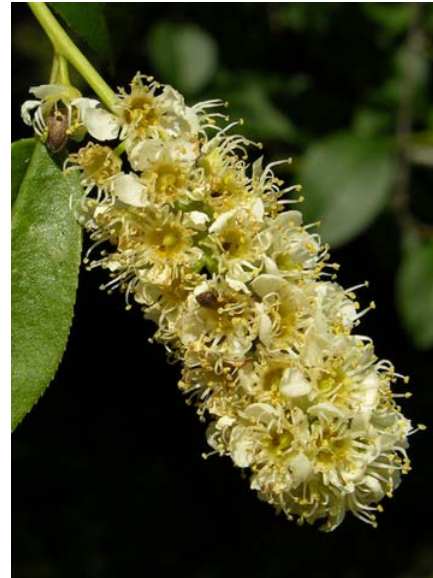
Western Chokecherry Prunus virginiana var. demissa Native Perennial Rose Family