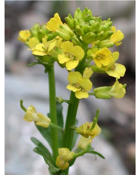
Erect-pod Winter Cress Barbarea orthoceras Native Perennial Mustard Family