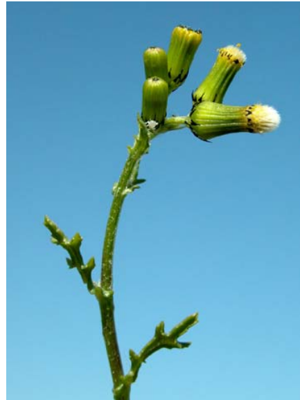
Common Groundsel Senecio vulgaris Introduced Annual Sunflower Family