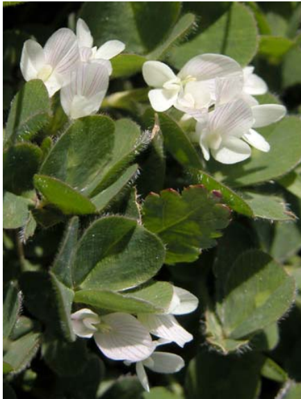
Subterranean Clover Trifolium subterraneum Introduced Annual Pea Family