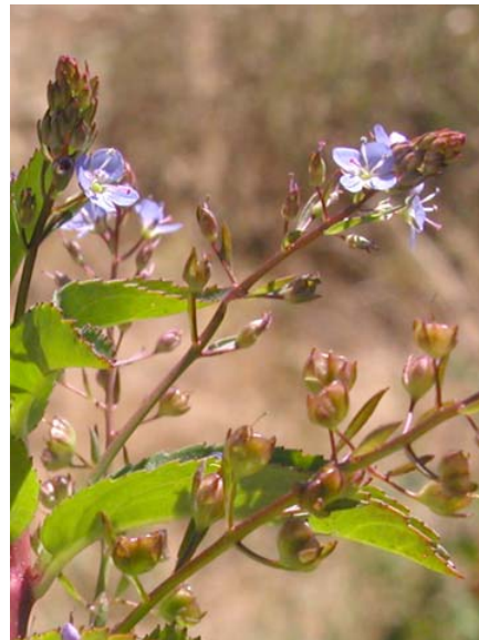
American Brooklime Speedwell Veronica americana Native Perennial Snapdragon Family