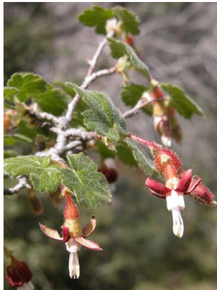
Canyon Gooseberry Ribes menziesii Native Perennial Gooseberry Family