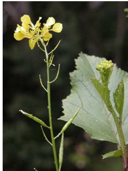
Yellow Charlock Sinapis arvensis Introduced Annual Mustard Family