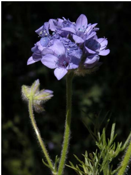
California Blue Gilia Gilia achilleifolia ssp. achilleifolia Native Annual Phlox Family