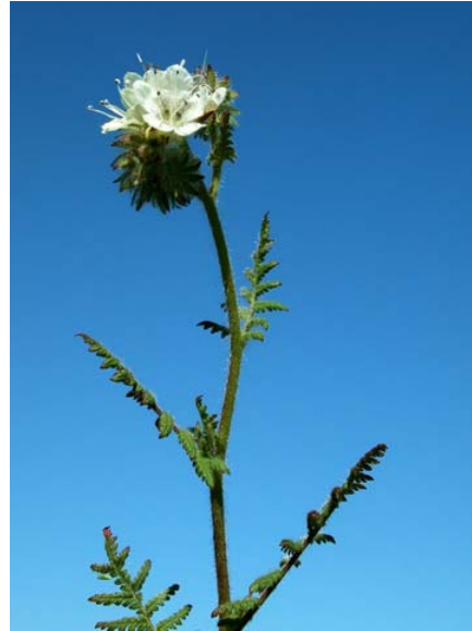
Wild Heliotrope Phacelia Phacelia distans Native Annual Waterleaf Family