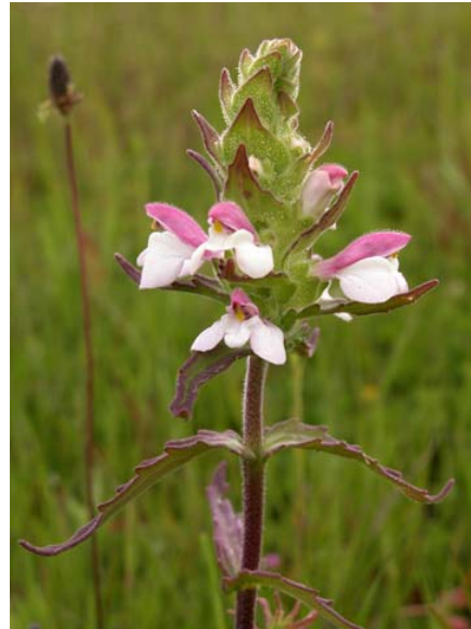
Bellardia Bellardia trixago Introduced Annual Snapdragon Family