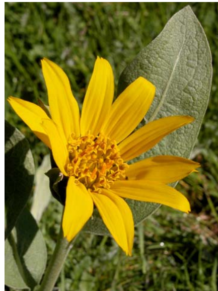
Gray Mule's Ear Wyethia helenioides Native Perennial Sunflower Family