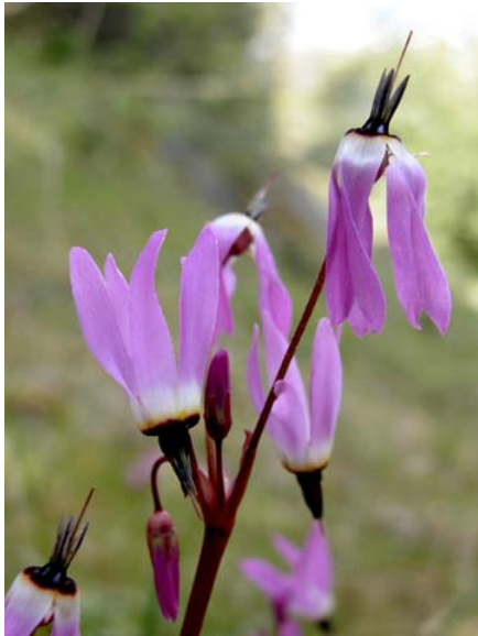
Mosquitobills Shooting Star Dodecatheon hendersonii Native Perennial Primrose Family