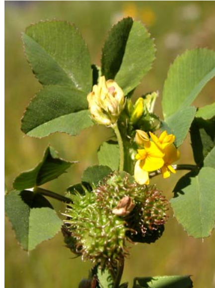
California Bur Clover Medicago polymorpha Introduced Annual Pea Family