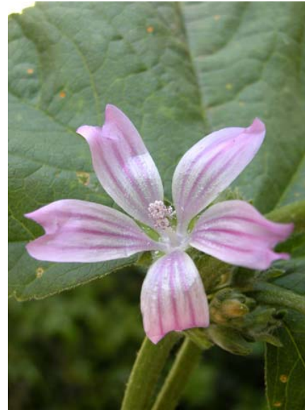
Bull Mallow Malva nicaeensis Introduced Annual Mallow Family