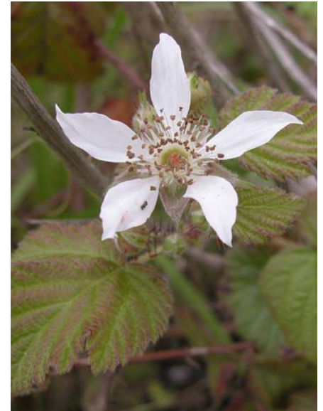
Native California Blackberry Rubus ursinus Native Perennial Rose Family