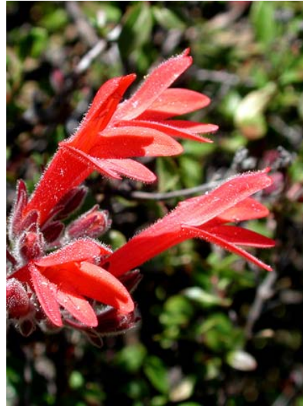
California Fuchsia Epilobium canum ssp. canum Native Perennial Evening Primrose Family