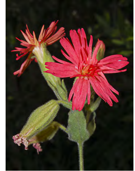
CALIFORNIA PINK ( Silene laciniata subsp. californica ) Native Perennial - Pink Family - (Spring-summer) - Chaparral, oak woodland, conifer forest, serpentine or not - Plant 8-28" tall. Petals 0.5-1" long, bright red.