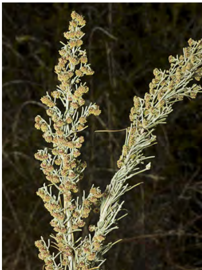
CALIFORNIA SAGEBRUSH ( Artemisia californica ) Native Perennial - Sunflower Family - (Aug-Nov) - Coastal scrub, chaparral, open woodland - Shrub 2-8.5' tall, rounded. Leaves 0.4-4", hairy, thread-like. Lt green to gray. Flower heads < 5 mm wide. Sage-scented.