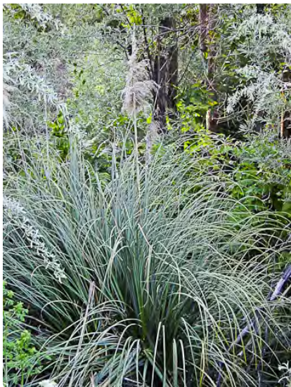
SMOOTH PAMPAS GRASS ( Cortaderia selloana ) Naturalized Perennial - Grass Family - (Sep-Mar) - Disturbed sites - Plant 6-13' tall. Leaf blades 0.1-0.5" wide, sheathes smooth. Cultivar, rarely escaped. INVASIVE weed.