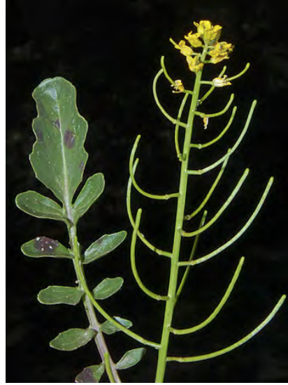
ERECT-POD WINTER CRESS ( Barbarea orthoceras ) Native Perennial - Mustard Family - (Mar–Jul) - Meadows, streambanks, moist woodland, grassland - Stem 8-24". Lower leaves w/large terminal lobe, upper clasping stem. Petals bright yellow, 0.2-0.3" long.