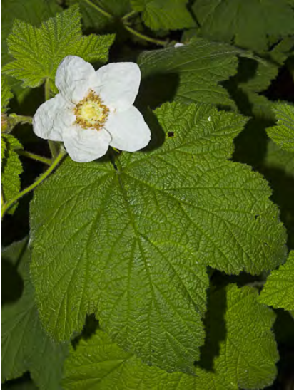
THIMBLEBERRY ( Rubus parviflorus ) Native Perennial - Rose Family - (Mar–Aug) - Common; moist semi-shaded areas, esp edges of woodland - Shrub 0.5-2 m tall, not prickly. Petals 0.5-0.9" long, white. Leaves simple, 3-5 lobed. Raspberry-type fruit.