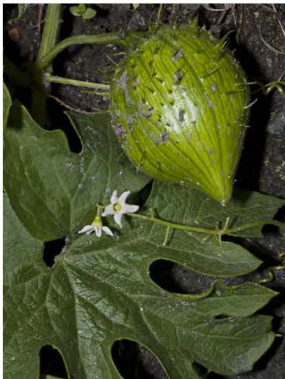
COAST MAN-ROOT ( Marah oregana ) Native Perennial - Gourd Family - (Mar-May) - Shrubby or open areas, forest edges - Vine 3-20' long. Leaves deeply lobed. Flowers white, deep cup-shaped, > 0.3" wide. Fruit smooth at end.