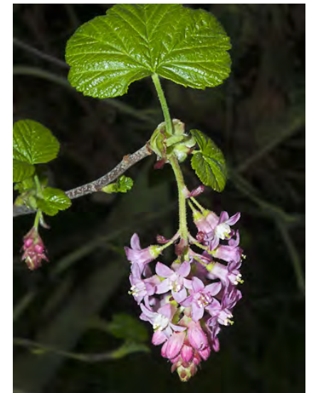
RED-FLOWERING CURRANT ( Ribes sanguineum var. glutinosum ) Native Perennial - Gooseberry Family - (Feb–Apr) - Many habitats - Shrub < 13' tall, no prickles. Sepals pink to white. Petals white to red, ~0.1" long. Styles smooth.