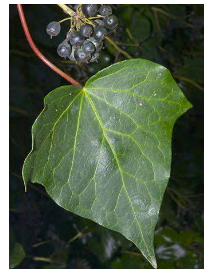
CANARY ISLANDS IVY ( Hedera canariensis ) Naturalized Perennial - Ginseng Family - (Aug-Nov) - Woodland, chaparral, disturbed areas - Woody vine. Leaves gen 3-pointed, > English Ivy. Flowers white to green. Fruit black, ~0.2" wide. INVASIVE weed.