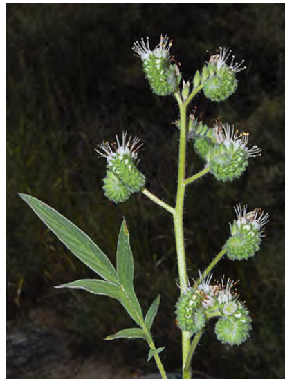
ROCK PHACELIA ( Phacelia imbricata subsp. imbricata ) Native Perennial - Borage Family - (Apr-Jul) - Slopes, roadsides, flats, canyons, chaparral, woodland - Plant 8-47", tufted. Leaf segments 7-15. Flowers 0.2-0.3", white. Flower bracts often sticky.