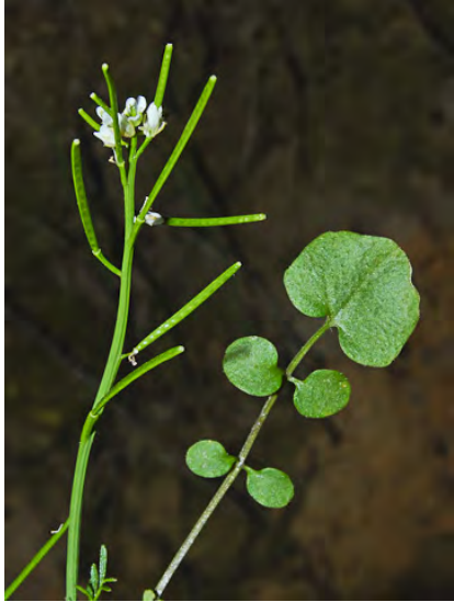
WESTERN BITTER-CRESS ( Cardamine oligosperma ) Native Annual - Mustard Family - (Mar-Jul) - Wet meadows, shady banks, damp areas - Plants < 16". Leaves divided into 5-9 leaflets. Flowers white, 0.1-0.2" long. Fruit < 0.1" wide.