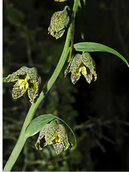
CHECKER LILY ( Fritillaria affinis ) Native Perennial - Lily Family - (Mar-Jun) - Common. Oak or pine scrub, grassland - Stem 4-47" tall. Leaves 1.6-6.3" long, whorled below. Petals mottled brown-purple and yellow-green, 0.4-1.6" long.