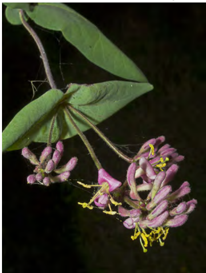
HAIRY VINE HONEYSUCKLE ( Lonicera hispidula ) Native Perennial - Honeysuckle Family - (May–Jun) - Canyons, streamsides, woodland - Shrub sprawling-climbing, 6-10' long, short-hairy. Flower cluster densely sticky. Flowers pink, 0.5-0.6" long, sticky-hairy.