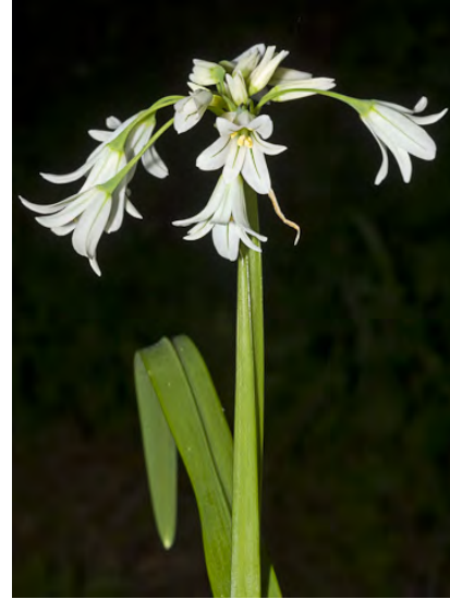
THREE CORNERED LEEK ( Allium triquetrum ) Naturalized Perennial - Onion or Garlic Family - (Mar-Apr) - Locally common. Shady ± disturbed places - Stem 4-16", sharply 3-angled. Flowers white, 3-15, 0.4-0.7" long, nodding. Escaped ornamentals.