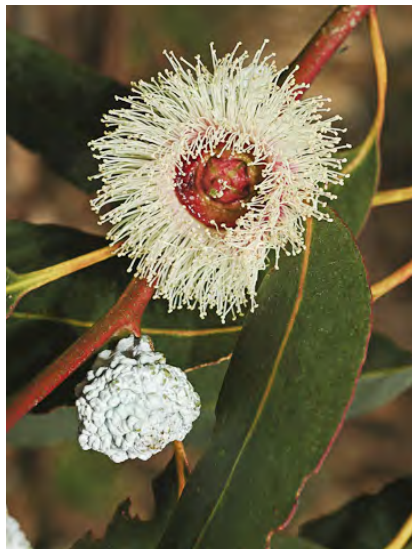
BLUE GUM ( Eucalyptus globulus ) Naturalized Perennial - Myrtle Family - (Oct-Jan) - Common. Disturbed areas - Tree < 200' tall. Flowers single, large, gen stemless. Leaves 4-12" long, 1-1.6" wide; used medicinally by Aboriginals. INVASIVE weed.