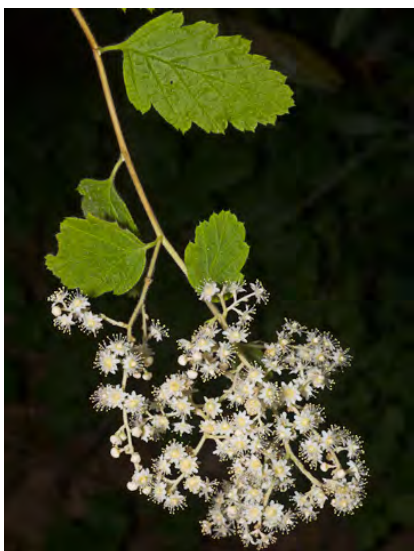
OCEANSPRAY ( Holodiscus discolor var. discolor ) Native Perennial - Rose Family - (May-Aug) - Moist woodland edges, rocky slopes - Shrub 5-20' tall. Leaf blade 0.6-3.1" long, toothed at end. Flower cluster 0.8-10" long. Petals white, ~0.07" long.