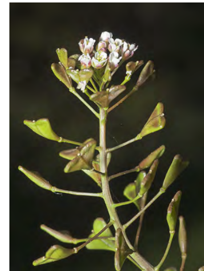
SHEPHERD'S PURSE ( Capsella bursa-pastoris ) Naturalized Annual - Mustard Family - (Jan-Oct) - Disturbed areas - Stem 4-20" long. Basal leaves 1.2-2.4" long, dandelion-like. Petals white, 0.08-0.16" long. Fruits 0.16-0.35" long, flat, heart-shaped.