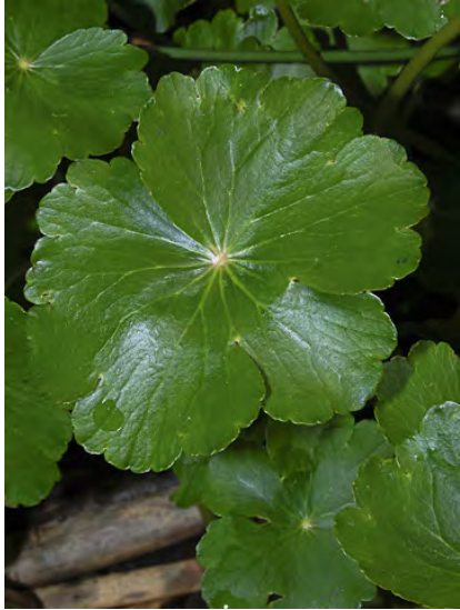
FLOATING MARSH PENNYWORT ( Hydrocotyle ranunculoides ) Native Perennial - Ginseng Family - (Mar-Aug) - Lake margins, ponds, slow-moving streams - Plant fleshy, floating-creeping. Leaf 0.8-2" wide, kidney-shaped, deep lobes, 1 reaching center.