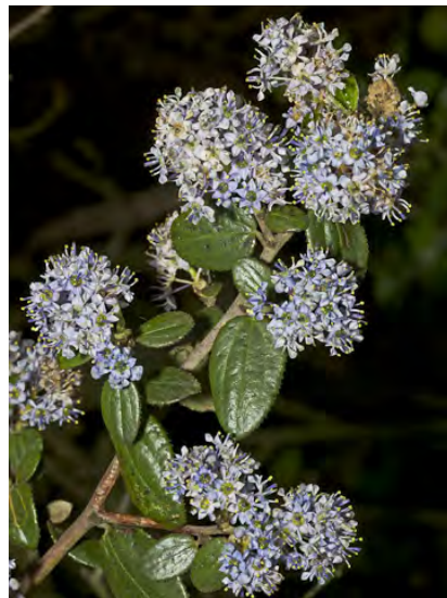
JIM BRUSH ( Ceanothus oliganthus var. soledadensis ) Native Perennial - Buckthorn Family - (Jan–May) - Slopes, ridges, chaparral, conifer forest - Shrub/tree < 11.5' tall. Twigs red-brown. Leaves alternate, 3 main veins. Flowers blue, purple-blue or whitish.