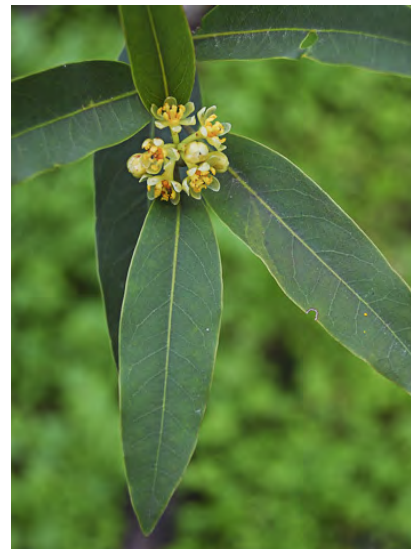
CALIFORNIA BAY ( Umbellularia californica ) Native Perennial - Laurel Family - (Nov–May) - Common. Canyons, valleys, chaparral - Tree < 150' tall. Leaf 1.2-4", 0.6-1.2" wide, aromatic. Cluster of 5-10 small, yellow or yellow-green flowers. Fruit 0.8-1" diam.