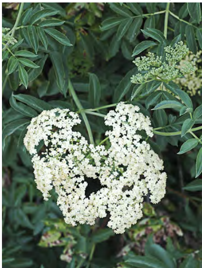
BLUE ELDERBERRY ( Sambucus nigra subsp. caerulea ) Native Perennial - Muskroot Family - (Mar-Sep) - Common. Streambanks, open places in forest - Shrub 7-26' tall. Flower cluster flat-topped, 1.6-13" diam, petals spreading. Fruits waxy blue-black.