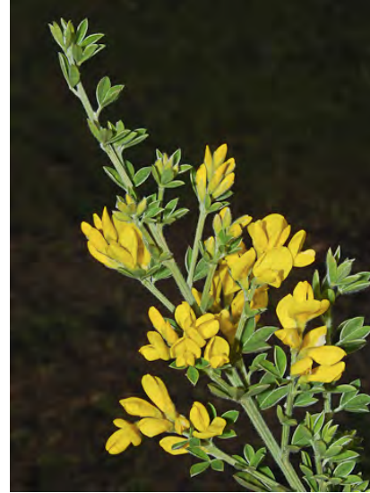
FRENCH BROOM ( Genista monspessulana ) Naturalized Perennial - Pea Family - (Mar-Jun) - Common. Disturbed places. - Shrub < 10' tall, evergreen. Stems 8-10 ridged, leafy. Flowers yellow, 4-10 at branch tips, banner 0.4-0.6" long. NOXIOUS.