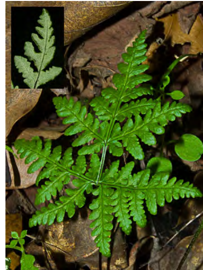
GOLDENBACK FERN ( Pentagramma triangularis subsp. triangularis ) Native Perennial - Brake Fern Family - - Gen shaded, sometimes rocky or wooded areas - Leaves triangular, 1.2-4" long, undersides either granular green or powdery gold.