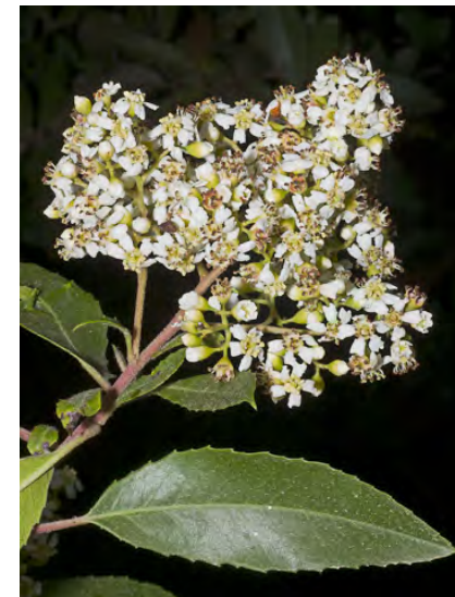
CHRISTMAS BERRY / TOYON ( Heteromeles arbutifolia ) Native Perennial - Rose Family - ((May)Jun-Aug) - Chaparral, oak woodland, mixed-evergreen forest - Shrub-tree < 33' tall, evergreen. Leaf 2-4" long. Petals white, < 0.16" long. Fruit bright red.