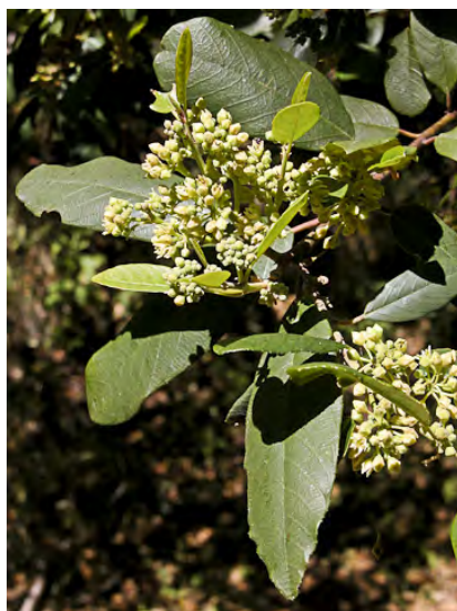
CALIFORNIA COFFEE BERRY ( Frangula californica subsp. californica ) Native Perennial - Buckthorn Family - (May–Jul) - Coastal-sage scrub, chaparral, forest, woodland - Shrub < 16' tall. Flowers greenish. Leaves smooth beneath.