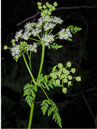
POISON HEMLOCK ( Conium maculatum ) Naturalized Biennial - Carrot Family - (Apr-Jul) - Common. Moist, esp disturbed places - Plants 2-10' tall. Stems purple-spotted. Leaves fern-like, gen 2x divided. Flowers white. TOXIC. INVASIVE weed.