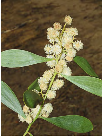
BLACKWOOD ACACIA ( Acacia melanoxylon ) Naturalized Perennial - Pea Family - (Feb-Mar) - Uncommon. Disturbed areas - Tree < 100' tall. Leaves simple, 0.2-1.2" wide, 3-5 main veins. Flowers pale yellow, 2-8 per head. INVASIVE weed.