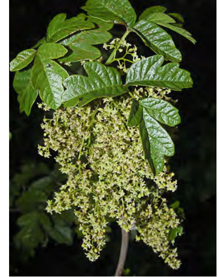
WESTERN POISON OAK ( Toxicodendron diversilobum ) Native Perennial - Sumac Family - (Apr-Jun) - Canyons, slopes, chaparral, coastal scrub, oak woodland - Shrub or vine. Leaflets 3, red in fall, mid leaflet stalked. Flowers green. Fruits white. TOXIC.