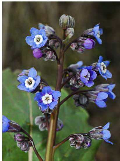
GRAND HOUND'S TONGUE ( Cynoglossum grande ) Native Perennial - Borage Family - (Feb-May) - Chaparral, woodland - Stem 1-3'. Leaf stalk 3-6". Leaf blade 3-6" cm long, broadly oval. Flowers bright blue w/inner white teeth.