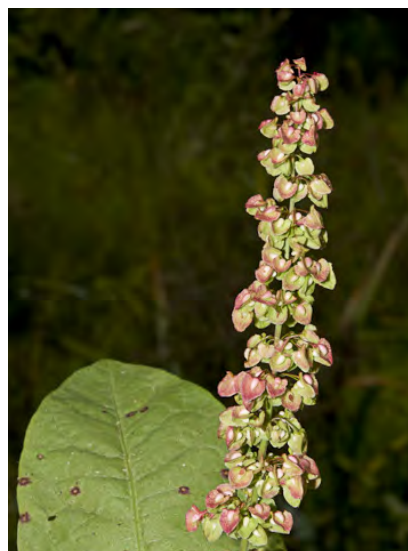
CURLY DOCK ( Rumex crispus ) Naturalized Perennial - Buckwheat Family - (All year) - Abundant. Disturbed places - Stem 16-39" tall. Flower cluster dense, valves 0.2-0.24", winged around tubercles, smooth edged. 1 tubercle enlarged. INVASIVE.