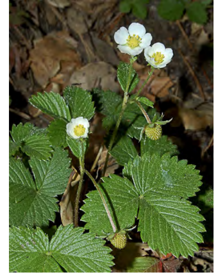
WOOD STRAWBERRY ( Fragaria vesca ) Native Perennial - Rose Family - (Jan-Jul) - Gen partial shade in forest - Stem gen 1.2-6" long. Leaflets 3, thin. Central leaflet gen w/12-21 teeth. Flower white, gen 0.6" wide, often above leaves. Fruit a strawberry.