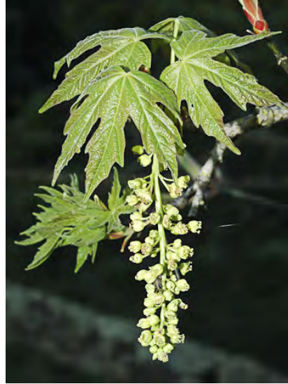
BIG-LEAF MAPLE ( Acer macrophyllum ) Native Perennial - Soapberry Family - (Mar-Jun) - Common. Streambanks, canyons - Tree < 100'. Leaves 5-lobed, 3-6" long, 4-10" wide. Group of 20-90 hanging flowers appear after leaves. Winged seeds.