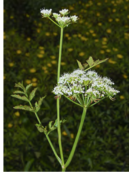
WATER PARSLEY ( Oenanthe sarmentosa ) Native Perennial - Carrot Family - (Jun-Oct) - Streams, marshes, ponds, gen aquatic - Plant 20-60" tall. Young shoots curled, tendril-like. Leaves twice-pinnate, leaflets alike, broad, serrate to lobed. Flowers white.