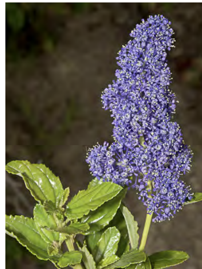
BLUE BLOSSOM ( Ceanothus thyrsiflorus var. thyrsiflorus ) Native Perennial - Buckthorn Family - (Mar–Jun) - Bluffs, slopes, canyons, chaparral, coastal scrub, closed-cone-pine forest - Leaves alternate, 3 main veins. Twigs angled, ridged lengthwise.