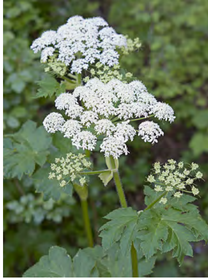
COW PARSNIP ( Heracleum maximum ) Native Perennial - Carrot Family - (Apr-Jul) - Moist places, wooded or open - Plants 1-3 m tall, woolly-hairy. Leaflets 3, maple-lobed, 4-16" wide. Petals white, outermost longest. Juice causes dermatitis.