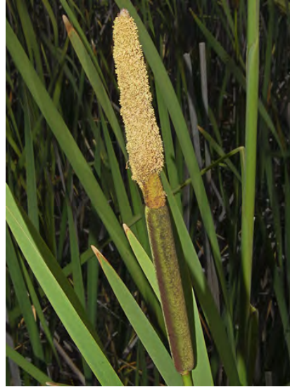
BROAD-LEAVED CATTAIL ( Typha latifolia ) Native Perennial - Cattail Family - (Jun-Jul) - Unpolluted to nutrient-rich freshwater (brackish) marshes - Plant 4.9-9.8' tall. Widest leaves 0.4-1.1" wide. Flower cluster with no gap between flower types.