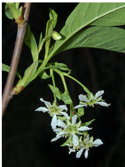
OSO BERRY ( Oemleria cerasiformis ) Native Perennial - Rose Family - (Feb-Apr) - Chaparral, canyons, streambanks, lowland wet to dry open woodland, coast to shaded conifer forest - Shrub 3-20'. Leaf 2-5" long. Flower cluster 1.2-4". Petals white, 0.12-0.24".