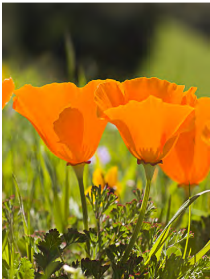
CALIFORNIA POPPY ( Eschscholzia californica ) Native Perennial - Poppy Family - (Feb-Sep) - Grassy, open areas - Plant 2-24" tall. Flower w/spreading rim \leq 0.2 ". Petals 0.8-2.4" long, early spring = large and orange, fall = smaller and yellow.