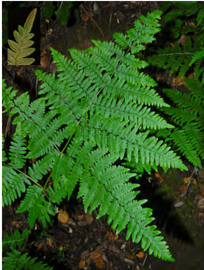
BRACKEN FERN ( Pteridium aquilinum var. pubescens ) Native Perennial - Bracken Family - - Pastures, woodland, meadows, hillsides, partial to full sun - Leaf blades widely-triangular, gen 0.5-5' long, gen 3x divided, hairy underneath.