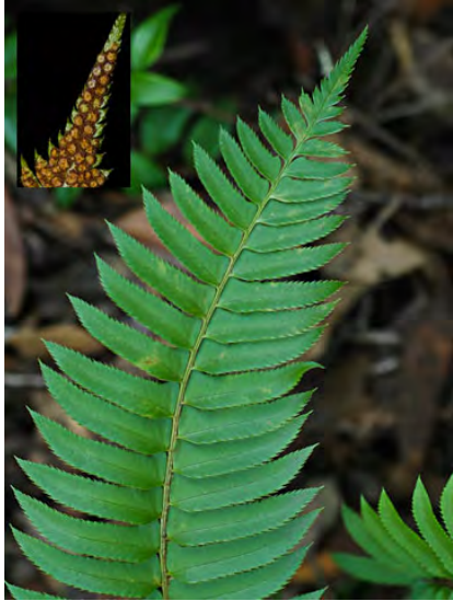
WESTERN SWORD FERN ( Polystichum munitum ) Native Perennial - Wood Fern Family - - - Common. Wooded hillsides, shaded slopes, rarely cliffs, outcrops - Fronds gen 20-48" long, divided once. Segments usually separate, teeth point to tips, scaly rachis.