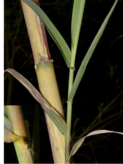
GIANT REED ( Arundo donax ) Naturalized Perennial - Grass Family - (Mar-Sep) - Moist places, seeps, ditchbanks - Stem 6-33' tall, matures woody. Leaves evenly spaced on stem. Flower cluster 8-28" tall, up to 5" wide. Spikelet ~0.5" long. NOXIOUS weed.