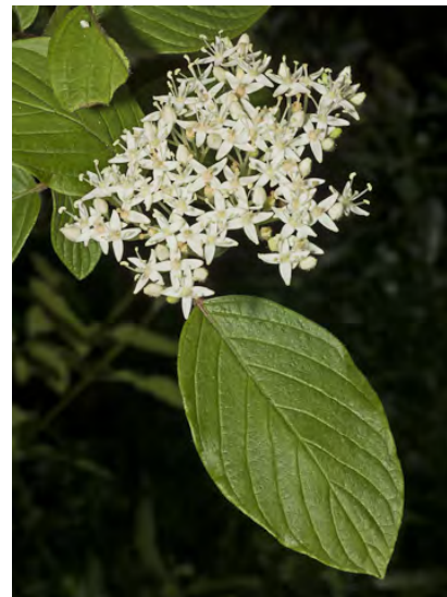
WESTERN AMERICAN DOGWOOD ( Cornus sericea subsp. occidentalis ) Native Perennial - Dogwood Family - (May-Jul) - Generally moist places - Shrub 5-13' tall. Leaf blades gen 2-4" long, rough-hairy below, veins in 4-7 pairs. Petals white, 0.1-0.2" long.