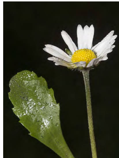
ENGLISH DAISY ( Bellis perennis ) Naturalized Perennial - Sunflower Family - (Dec-Sep) - Damp, grassy areas - Herbaceous lawn weed. Leaves 0.8-4" long, spoon-shaped. Ray flowers white, 0.3-0.4" long, narrow. Disk flowers yellow, ~ 0.1" long.