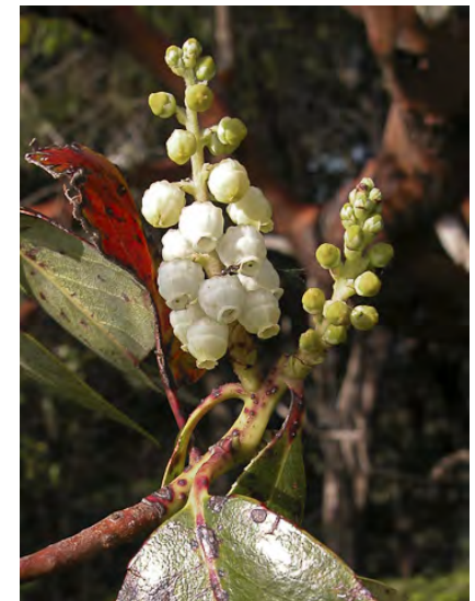
PACIFIC MADRONE ( Arbutus menziesii ) Native Perennial - Heath Family - (Mar-May) - Conifer, oak forests - Tree < 130' tall, evergreen, peeling red bark. Leaf blades < 5" long. Flowers yellow-white or pink, < 3.1" long. Berries red, < 0.5" diam, round.