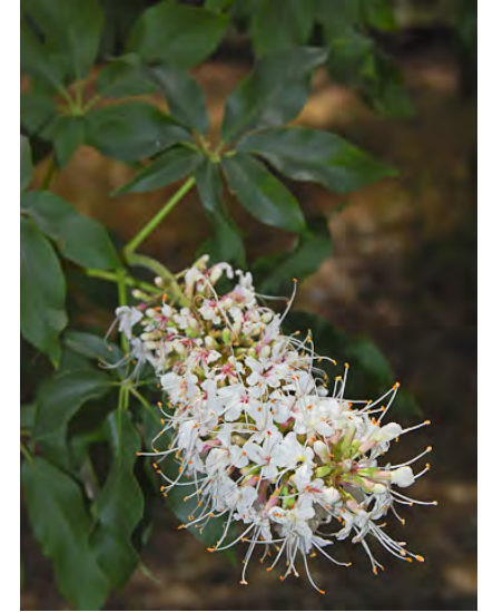
CALIFORNIA BUCKEYE ( Aesculus californica ) Native Perennial - Soapberry Family - (May–Jun) - Dry slopes, canyons, borders of streams - Large shrub or tree 13-39' tall. 5-7 leaflets. Flowers white to pale rose. Large seeds toxic but edible after leaching out saponins.