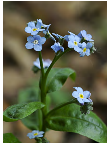
BROADLEAVED FORGET-ME-NOT ( Myosotis latifolia ) Naturalized Perennial - Borage Family - (Feb-Jul) - Moist, disturbed, shady places - Stem < 28" long, base woody. Leaves to 0.8" wide. Flowers light blue, 0.2-0.4" wide. INVASIVE weed.