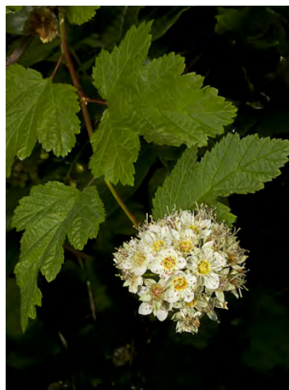
PACIFIC NINEBARK ( Physocarpus capitatus ) Native Perennial - Rose Family - (May-Jul) - Moist banks, n-facing slopes, mixed-conifer forest - Shrub 3.3-8'. Leaf blades gen < 4" wide, 3-5 lobed. Petals white, ~0.1" long. Fruits reddish, 0.3-0.4" long.