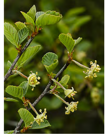
BIRCH-LEAF MOUNTAIN-MAHOGANY ( Cercocarpus betuloides var. betuloides ) Native Perennial - Rose Family - (Mar-May) - Dry, rocky slopes, chaparral - Shrub 3-10'. Leaf 0.4-1" long, end toothed. Flower 0.16-0.3" wide. Hairy fruit styles 2-3.5" long.