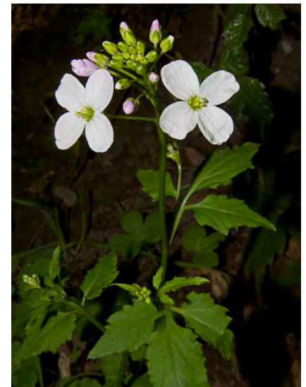
MILK MAIDS ( Cardamine californica ) Native Perennial - Mustard Family - (Jan-May) - Gen shaded sites, canyons, woodland. One of first spring flowers - Stem 10-24" long. Leaves lobed to compound w/sharp teeth. Petals white or pale rose, 0.3-0.5" long.