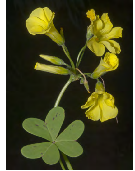
BERMUDA BUTTERCUP ( Oxalis pes-caprae ) Naturalized Perennial - Oxalis Family - (Jan–May) - Disturbed areas, roadsides, grassland, dunes - Flowering stem < 12" tall. Leaflets in 3s, < 1.4" long. Petals yellow, < 1" long. Ornamental. INVASIVE weed.