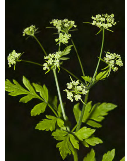
TALL SOCK-DESTROYER ( Torilis arvensis ) Naturalized Annual - Carrot Family - (Apr-Jul) - Disturbed places - Plant erect, 12-40" - Flower clusters open, > leaf. Fruits 0.1-0.2" long, covered with uncurved bristles. Flowers white or pinkish. INVASIVE weed.