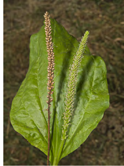
COMMON PLANTAIN ( Plantago major ) Naturalized Annual-Perennial - Plantain Family - (Apr-Sep) - Disturbed areas - Leaves basal, blades 5-18 cm long, broadly oval, not hairy. Flowers + stem 2-24" tall, flower cluster gen 1.2-8" long.