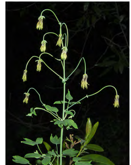
FOOTHILL MEADOW-RUE ( Thalictrum fendleri var. polycarpum ) Native Perennial - Buttercup Family - (Mar-Jun) - Moist, open to shaded places, woodland, forest - Plant 2-6'+ tall, male or female. Leaf 1-4x divided, 3-18" long, segments 0.3-0.8" long. No petals.