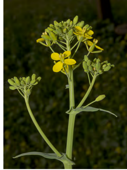
TURNIP ( Brassica rapa ) Naturalized Annual - Mustard Family - (Jan–May) - Disturbed areas - Stem 8-40" tall. Leaves clasping, upper smooth-edged & waxy. Petals yellow, 0.2-0.4" long, stalk 0.3-1"; fruit beak > 0.4". INVASIVE weed.