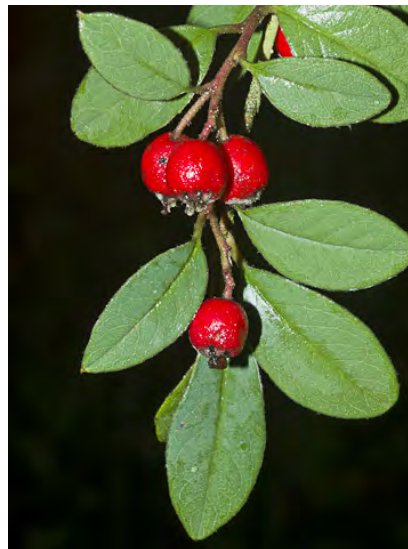
SILVERLEAF COTONEASTER ( Cotoneaster pannosus ) Naturalized Perennial - Rose Family - (May-Jul) - Disturbed places, mixed-evergreen forest - Leaves 0.8-1.4" long, pointed tip, smooth above. Petals white, spreading. Fruit red. INVASIVE weed.