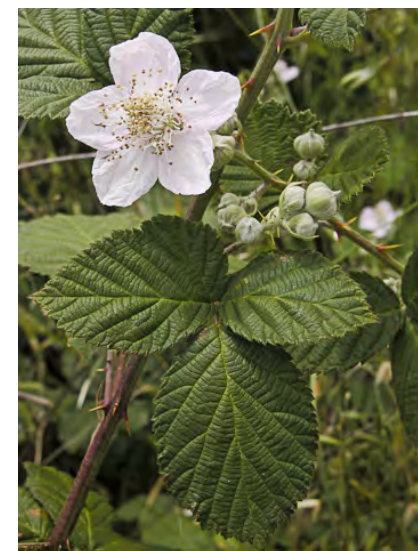
HIMALAYAN BLACKBERRY ( Rubus armeniacus ) Naturalized Perennial - Rose Family - (Mar-Jun) - Common. Disturbed areas, roadsides - Shrub w/thorny 5-angled stem. Leaflets 3-5, white-hairy beneath. Blackberry-type fruit. INVASIVE.