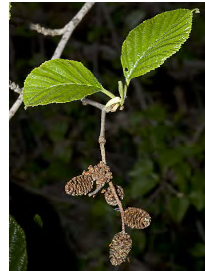
WHITE ALDER ( Alnus rhombifolia ) Native Perennial - Birch Family - (Apr–Jun) - Along permanent streams - Tree. Leaves flat, not rusty underneath, margins serrate, not rolled under. Female flowers cone-like. Wood used for furniture and for smoking meats.