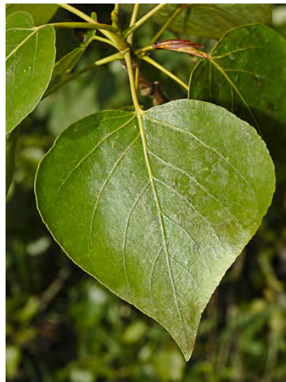
BLACK COTTONWOOD ( Populus trichocarpa ) Native Perennial - Willow Family - (Feb-Apr) - Alluvial bottomland, streamsides - Tree < 100' tall. Leaves egg-shaped, finely-scalloped edge, blade 1.2-2.8" long.