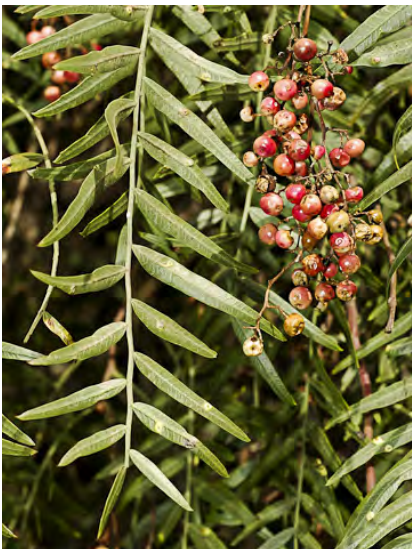
PEPPER TREE ( Schinus molle ) Naturalized Perennial - Sumac Family - (Jun–Aug) - Washes, slopes, abandoned fields - Tree 16-60' tall. Flowers white to yellow. Leaves compound, leaflets stemless. Fruits pink to red, 0.2-0.3" diam.