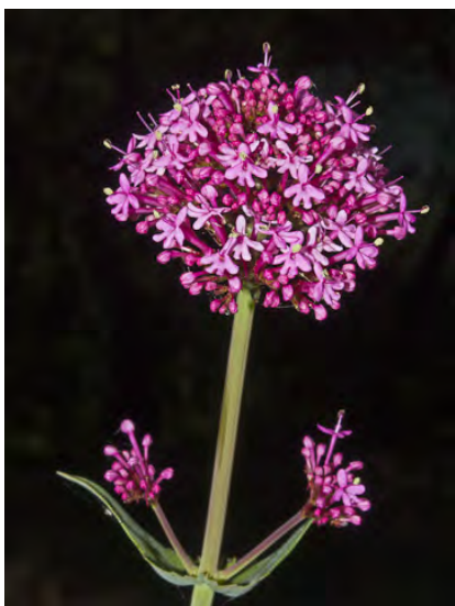
RED VALERIAN ( Centranthus ruber ) Naturalized Perennial - Valerian Family - (Apr-Jul) - Disturbed places, rock or wall crevices, roadsides - Stem 1-3' long, hollow, gen woody base. Leaves 2-3" long. Flowers purple-red or white, 0.5-0.7" long. Cultivar.