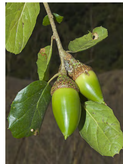
COAST LIVE OAK ( Quercus agrifolia var. agrifolia ) Native Perennial - Oak Family - (Mar–Apr) - Valleys, slopes, mixed-evergreen forest, woodland - Tree 30-80'. Leaves convex, hair-tuft below in vein axils. Acorns on 1st year twigs, shell glabrous inside.