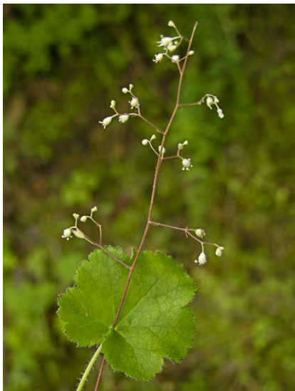
SMALL-FLOWER ALUMROOT ( Heuchera micrantha ) Native Perennial - Saxifrage Family - (Apr-Jul) - Moist, rocky banks and cliffs - Plant 4-40" tall. Leaf blade 0.8-4.7" long, 5-7 lobed, generally hairy. Petals white, ~ 0.1" long.