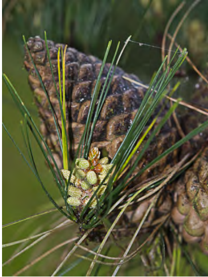
MONTEREY PINE ( Pinus radiata ) Native Perennial - Pine Family - - - Closed-cone-pine forest, oak woodland - Tree < 125' tall. Mature bark black, deep-grooved. Needles 3 per bundle, 2.4-5.9" long. Seed cone 2.4-6" long, asymmetric, opening 2nd year.