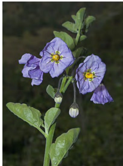
BLUE WITCH ( Solanum umbelliferum ) Native Perennial - Nightshade Family - (All year) - Shrubland, mixed-evergreen forest, woodland - Plant gen < 39", upper stem hairs branched, dense. Flowers 0.6-1" wide, purple, with green spots at the base.