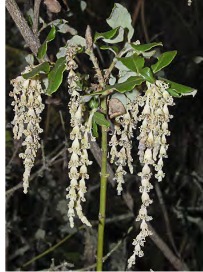
COAST SILK TASSEL ( Garrya elliptica ) Native Perennial - Silk Tassel Family - (Jan–Mar) - Seacliffs, sand dunes, chaparral, foothill-pine woodland - Shrub or small tree, < 26' tall. Leaves wavy-margined, underside hairs felt-like, interwoven. Fruit hairy.