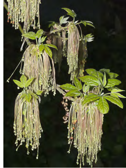
BOX ELDER ( Acer negundo ) Native Perennial - Soapberry Family - (Mar-Apr) - Streamsides, bottomland. - Tree < 66' tall. Leaflets in 3s. Group of 10-250 hanging flowers appear with leaves. Winged fruits. Widely planted ornamental.