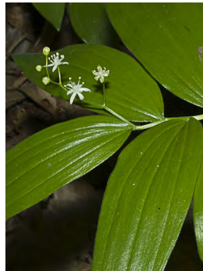
STARRY FALSE SOLOMON'S SEAL ( Maianthemum stellatum ) Native Perennial - Butcher's Broom Family - (Apr-Jun) - Moist woodland, streambanks, open slopes - Stem 12-28" long. Leaf 2-7" long. Flowers 5-15/cluster. Petals white, 0.16-0.28" long.