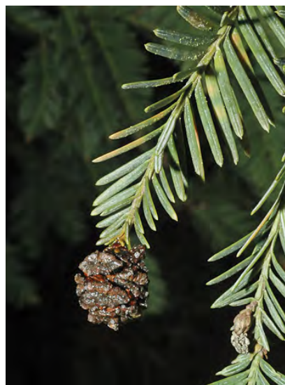
REDWOOD ( Sequoia sempervirens ) Native Perennial - Cypress Family - - - Redwood forest - Tree to 380' tall, evergreen. Leaves alternate: on rapidly growing stems awl-like, < 0.3" long; others flat, 0.2-1" long. Seed cone 0.5-1.4" diam, woody.