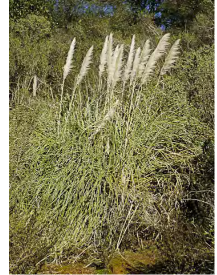
HAIRY PAMPAS GRASS ( Cortaderia jubata ) Naturalized Perennial - Grass Family - (Sep-Feb) - Disturbed sites, many habitats, esp coastal - Plant 6-23' tall. Leaf blades 0.1-0.5" wide, sheathes hairy. NOXIOUS weed.