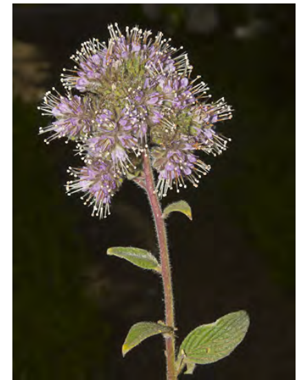
CALIFORNIA PHACELIA ( Phacelia californica ) Native Perennial - Borage Family - (Mar-Sep) - Bluffs, open slopes, road cuts, chaparral, woodland - Plant tufted, stiff-hairy. Leaves gen pinnate w/big terminal leaflet. Flowers 0.16-0.28" long, lavender.