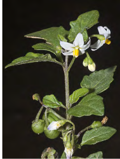
BLACK NIGHTSHADE ( Solanum nigrum ) Naturalized Annual - Nightshade Family - (Mar-Oct) - Disturbed places - Flower 0.4" wide w/deep lobes, white. Anthers 0.08" long. Seeds 0.08". Bracts 0.08-0.12" long, not curled back in fruit.