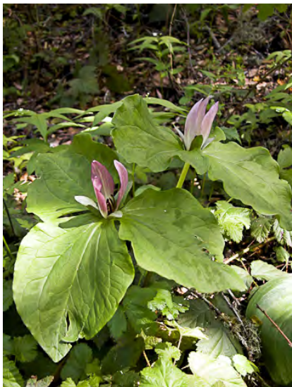
GIANT TRILLIUM ( Trillium chloropetalum ) Native Perennial - Bunchflower Family - (Apr-May) - Edges of redwood forest, chaparral, gen moist slopes, canyon banks in alluvial soils - Flowers dark purple to white, sessile. Petals 2.6-4" long, odor rose-like or spicy.