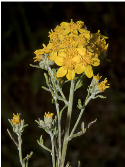
GOLDEN-YARROW ( Eriophyllum confertiflorum var. confertiflorum ) Native Perennial - Sunflower Family - (Apr-Aug) - Many dry habitats - Shrubby, 8-28" tall. Leaves 0.4-2" long, deeply 3-5 lobed. Flowers yellow; rays 4-6, 0.08-0.2" long; head bracts 4-7.