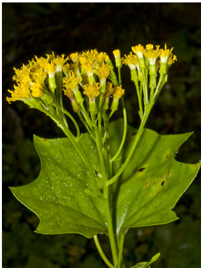
GERMAN IVY ( Delairea odorata ) Naturalized Perennial - Sunflower Family - (Nov–Mar) - Shady, ± disturbed places, riparian woodland, coastal scrub - Vine stem 3-20' long. Heads ~ 20 per cluster. Disk flowers bright yellow. NOXIOUS weed.