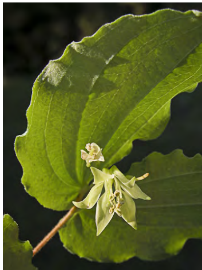
HOOKER FAIRY BELLS ( Prosartes hookeri ) Native Perennial - Lily Family - (Mar-Jun) - Montane conifer, mixed-evergreen forest, exposed roadside - Stem 12-32" tall. Leaf 1.2-6" long. Flower 0.3-0.6" long, white, hanging below the leaves, stamens > petals.