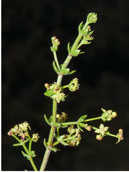
CLIMBING BEDSTRAW ( Galium porrigens var. porrigens ) Native Perennial - Madder Family - (May–Aug) - Among shrubs in chaparral, forest - Stem 4-59" long. Leaves 0.1-0.7" long, oval to egg-shaped, in whorls of 4. Flowers yellow to red, 4-lobed.