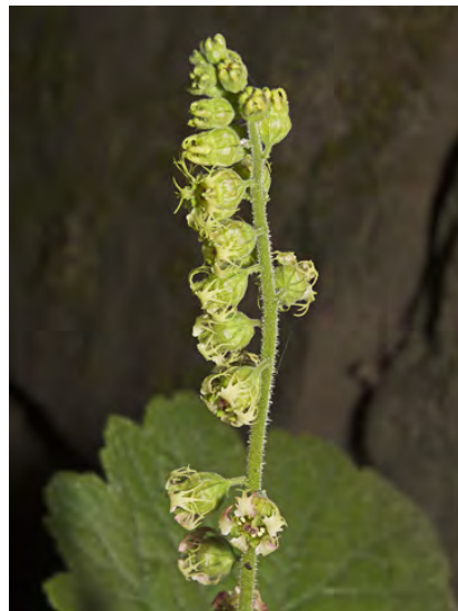
FRINGE CUPS ( Tellima grandiflora ) Native Perennial - Saxifrage Family - (Apr-Jul) - Moist slopes - Plant 16-39" tall, hairy. Flower cluster unbranched. Petals green-white to rose or red, 0.12-0.28" long, falling early. Stamens 10. Hypanthium bell-shaped.