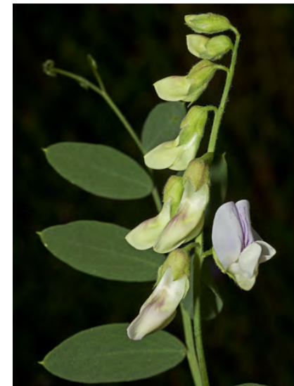
PACIFIC PEA ( Lathyrus vestitus var. vestitus ) Native Perennial - Pea Family - (Feb-Jul) - North: Conifer forest. South: chaparral & oak woodland - Stem wings to 0.02" wide. Leaves gen elliptic. Flowers 0.5-0.7" long, pale lavender to purple.