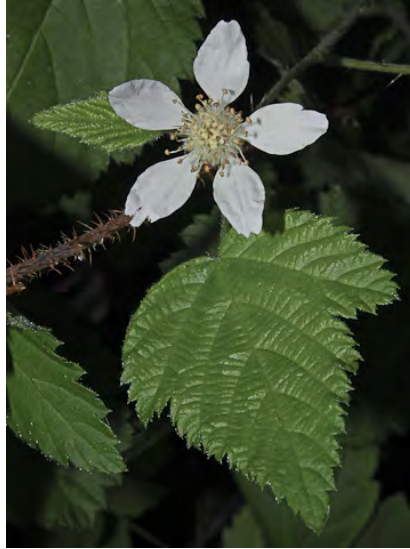
CALIFORNIA BLACKBERRY ( Rubus ursinus ) Native Perennial - Rose Family - (Mar–Jul) - Open, disturbed areas - Stem round, bristly/prickly. Leaves simple to 3 leaflets, underside green. Plants unisexual. Petals 0.24-0.6" long, white. Blackberry-type fruit.