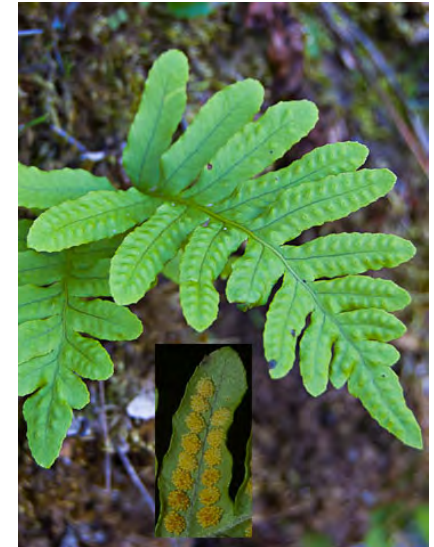
POLYPODY FERN ( Polypodium calirhiza ) Native Perennial - Polypody Family - - On plants, rocky cliffs or outcrops, roadcuts, often granitic or volcanic, rarely dunes - Leaf blades 4-8" long, often widest above base, deeply lobed.