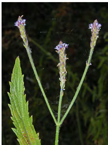
TALL VERVAIN ( Verbena bonariensis ) Naturalized Annual-Biennial - Vervain Family - (Jun-Oct) - Disturbed, often wet places, fields - Plant 20-60". Leaf 3-6" long, gen clasping stem. Flowers white or purple, 0.2-0.24" long; 8-17/cluster.