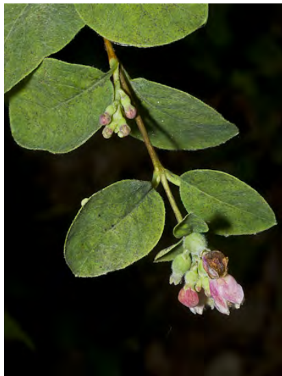
SNOWBERRY ( Symphoricarpos albus var. laevigatus ) Native Perennial - Honeysuckle Family - (May–Jul) - Shady woodland, streambanks, N. slopes - Shrub 20-71" tall. Flowers > 8/cluster, pink, 0.16-0.24" long, bell-shaped, swollen on 1 side.