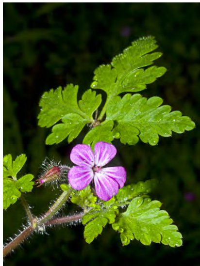
HERB ROBERT ( Geranium robertianum ) Naturalized Annual-Biennial - Geranium Family - (Apr-Sep) - Open to shaded sites - Stem 4-20" long. Leaflets in 3s, deeply lobed. Petals pink to red-purple, 0.4-0.55" long.