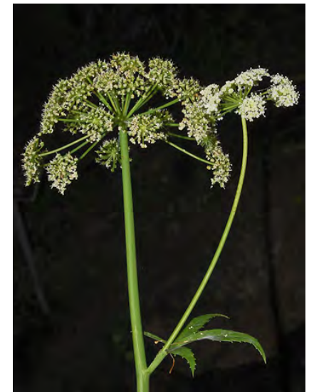
WESTERN WATER-HEMLOCK ( Cicuta douglasii ) Native Perennial - Carrot Family - (Jun-Sep) - Wet places, gen aquatic - Plants 5-10' tall. Leaves 1-3x divided, leaflets 1-10, serrate edges. Flowers white. Fruits round. The most lethally TOXIC native plant.