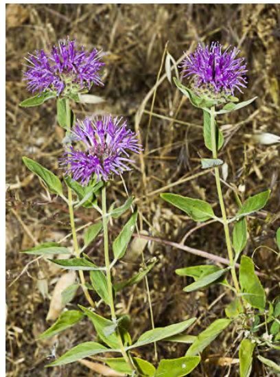
COYOTE-MINT ( Monardella villosa subsp. villosa ) Native Perennial - Mint Family - (May-Aug) - Dry rocky slopes, oak woods, chaparral - Plant < 20" tall. Leaves ovate, 0.4-0.9" mm long. Flower head 0.4-1.2" wide. Flowers pink to purple.