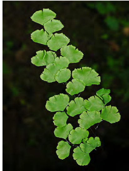
CALIFORNIA MAIDENHAIR ( Adiantum jordanii ) Native Perennial - Brake Fern Family - - Shaded hillsides, moist woodland - Leaves 8-28" long with many rounded symmetrical segments, each with < 4 irregular lobes. Cultivated. Sudden Oak Death carrier.