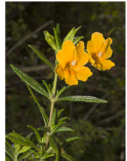
BUSH MONKEYFLOWER ( Mimulus aurantiacus var. aurantiacus ) Native Perennial - Lopseed Family - (Mar–Jun) - Disturbed areas, coastal cliffs, canyon sides - Shrub 4-60". Flowers yellow, orange or red; 1-2.3" long; bract tube glabrous.