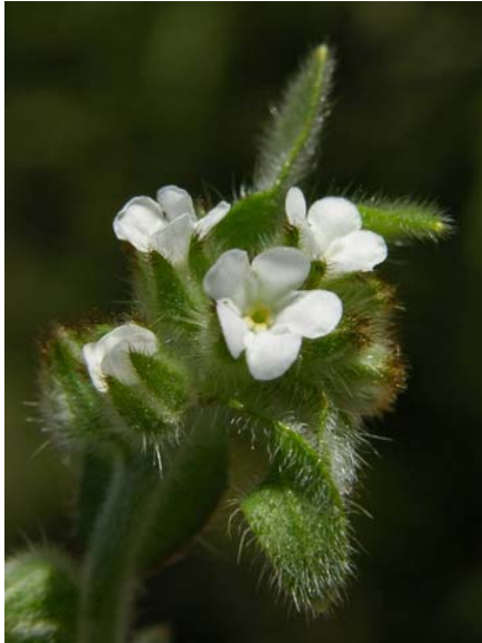
Valley Popcorn Flower Plagiobothrys canescens Native Annual Borage Family