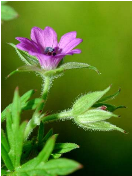
Purpletip Cut-leaf Geranium Geranium dissectum Introduced Annual Geranium Family