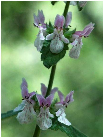
Common Rigid Hedge Nettle Stachys ajugoides var. rigida Native Perennial Mint Family