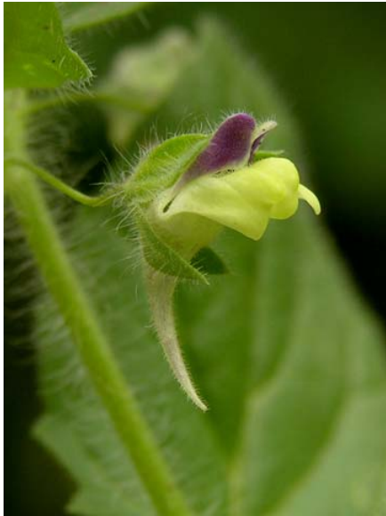
Sharp Point Fluvellin Kickxia elatine Introduced Annual Snapdragon Family