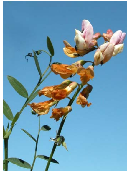
Pale Purple Pacific Pea Lathyrus vestitus var. vestitus Native Perennial Pea Family