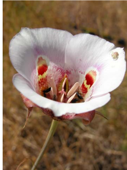
White Butterfly Mariposa Lily Calochortus venustus Native Perennial Lily Family