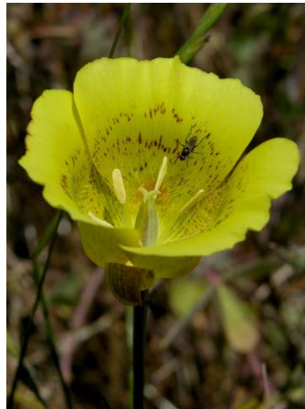
Yellow Mariposa Lily Calochortus luteus Native Perennial Lily Family