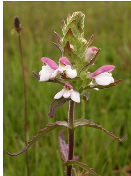
Bellardia Bellardia trixago Introduced Annual Snapdragon Family