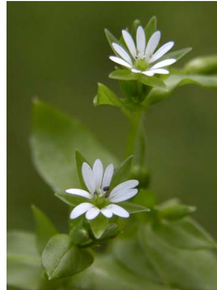
Common Chickweed Stellaria media Introduced Annual Pink Family