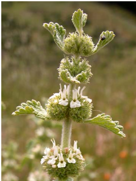
Common Horehound Marrubium vulgare Introduced Perennial Mint Family