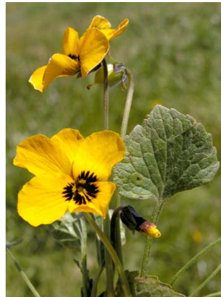
Johnny-Jump-Up / Wild Pansy Viola pedunculata Native Perennial Violet Family