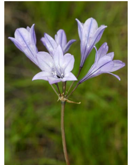
Ithuriel's Spear Triteleia laxa Native Perennial Lily Family