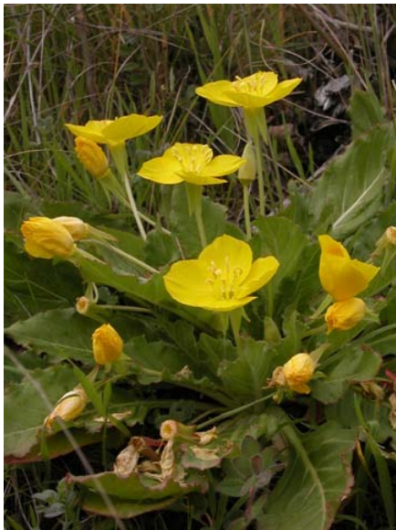
Golden Eggs Suncup Camissonia ovata Native Perennial Evening Primrose Family