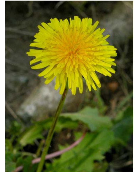
Common Dandelion Taraxacum officinale Introduced Biennial-Perennial Sunflower Family