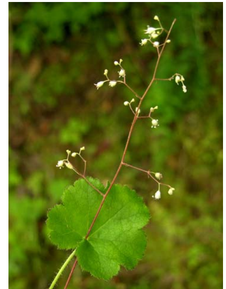
Small-flower Alumroot Heuchera micrantha Native Perennial Saxifrage Family