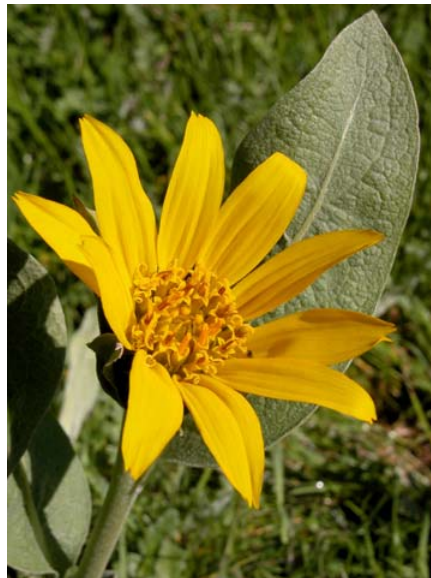
Gray Mule's Ear Wyethia helenioides Native Perennial Sunflower Family