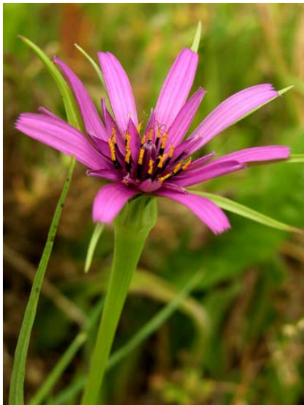
Purple Salsify Tragopogon porrifolius Introduced Biennial-Perennial Sunflower Family