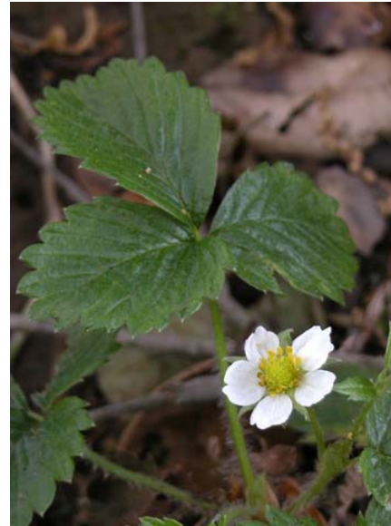
Woodland Strawberry Fragaria vesca Native Perennial Rose Family