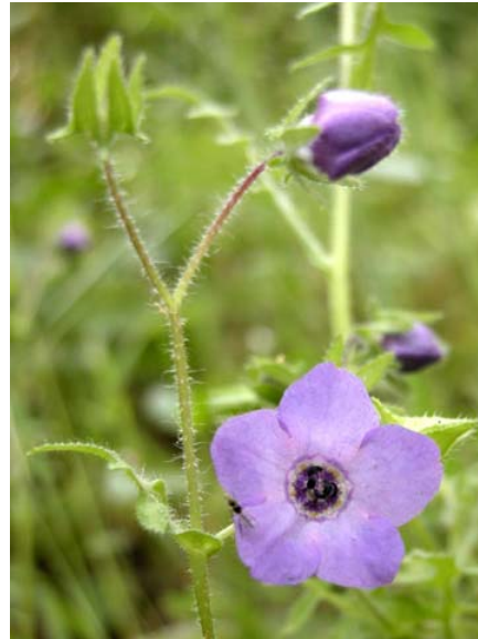
Blue Fiesta Flower Pholistoma auritum var. auritum Native Annual Waterleaf Family