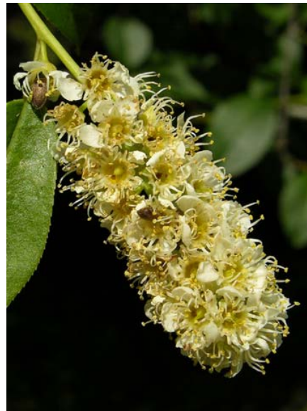
Western Chokecherry Prunus virginiana var. demissa Native Perennial Rose Family