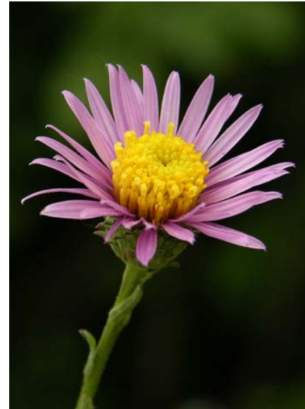
Common Lessingia Lessingia filaginifolia var. filaginifolia Native Perennial Sunflower Family