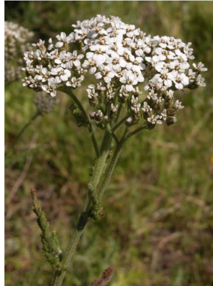
Yarrow Achillea millefolium Native Perennial Sunflower Family