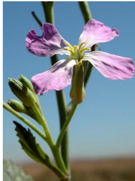
Wild Radish Raphanus sativus Introduced Annual Mustard Family