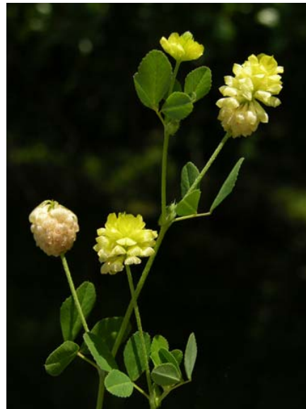
Hop Clover Trifolium campestre Introduced Annual Pea Family