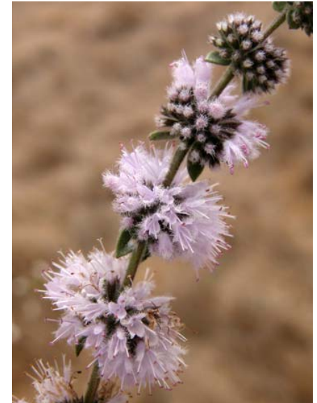
Pennyroyal Mentha pulegium Introduced Perennial Mint Family