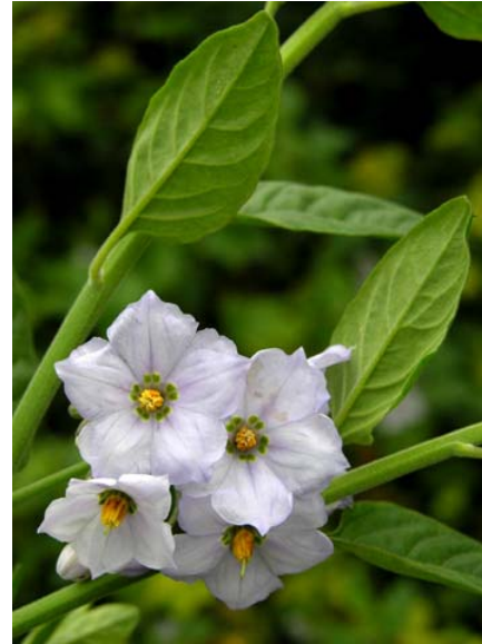
Blue Witch Solanum umbelliferum Native Perennial Nightshade Family