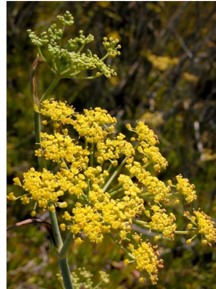
Sweet Fennel Foeniculum vulgare Introduced Perennial Carrot Family