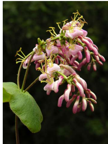
Hairy Vine Honeysuckle Lonicera hispidula var. vacillans Native Perennial Honeysuckle Family