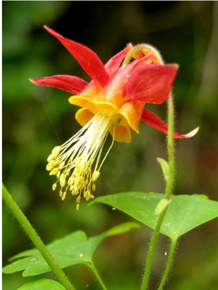
Red / Crimson Columbine Aquilegia formosa Native Perennial Buttercup Family