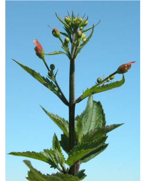
California Figwort Scrophularia californica ssp. californica Native Perennial Snapdragon Family