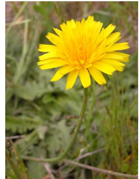
Rough Cat's-ear Hypochaeris radicata Introduced Perennial Sunflower Family