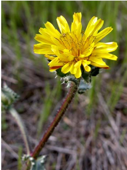
Bristly Ox-tongue Picris echioides Introduced Annual-Biennial Sunflower Family