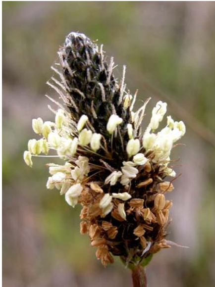
English Plantain Plantago lanceolata Introduced Annual Plantain Family