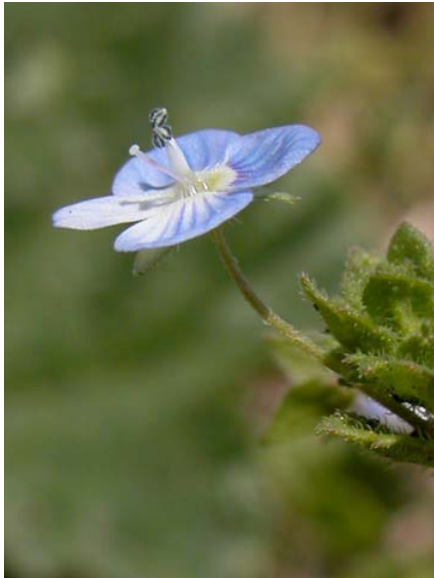
Persian Speedwell Veronica persica Introduced Annual Snapdragon Family