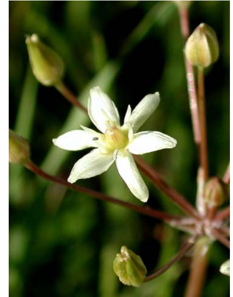
Common Muilla Muilla maritima Native Perennial Lily Family