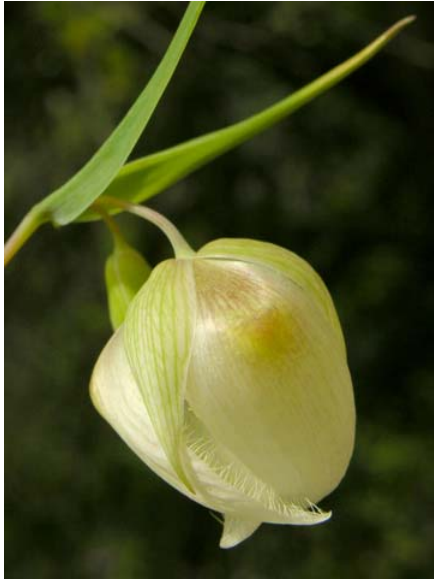
White Fairy Lantern Calochortus albus Native Perennial Lily Family