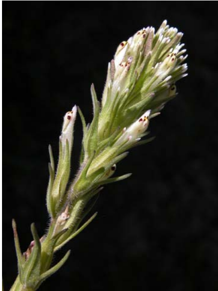
Valley Tassels Castilleja attenuata Native Annual Snapdragon Family