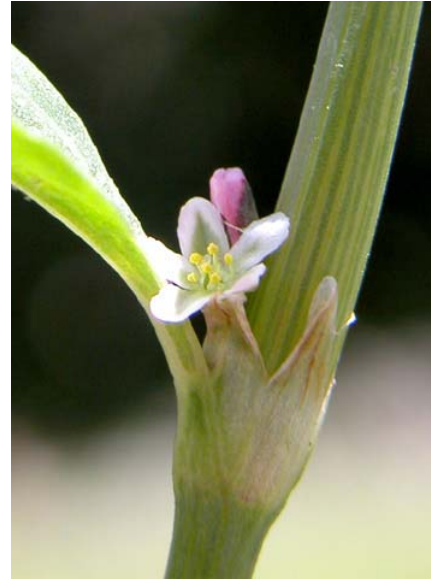
Common Yard Knotweed Polygonum arenastrum Introduced Annual Buckwheat Family