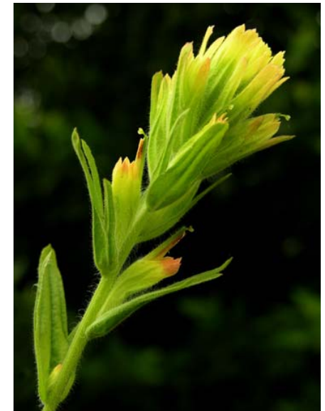
Seaside / Coastal Paintbrush Castilleja wightii Native Perennial Snapdragon Family