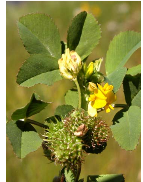
California Bur Clover Medicago polymorpha Introduced Annual Pea Family