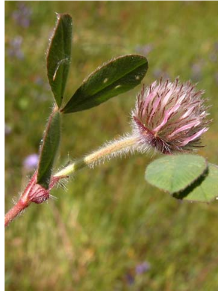
Rose Clover Trifolium hirtum Introduced Annual Pea Family