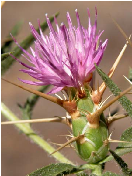
Purple Star Thistle Centaurea calcitrapa Introduced Annual-Biennial Sunflower Family