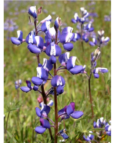
Miniature Dove Lupine Lupinus bicolor Native Annual Pea Family