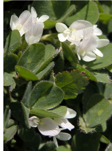
Subterranean Clover Trifolium subterraneum Introduced Annual Pea Family