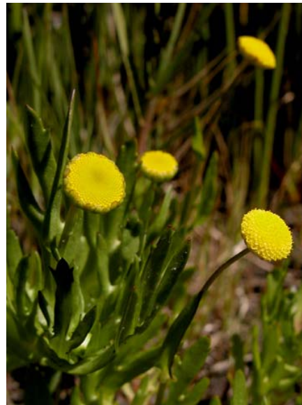
Brass Buttons Cotula coronopifolia Introduced Perennial Sunflower Family