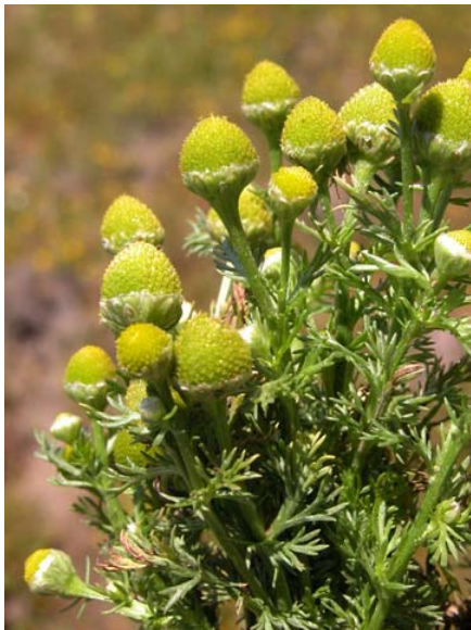
Pineapple Weed Chamomilla suaveolens Introduced Annual Sunflower Family