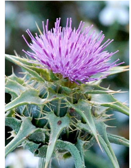
Milk Thistle Silybum marianum Introduced Annual-Biennial Sunflower Family