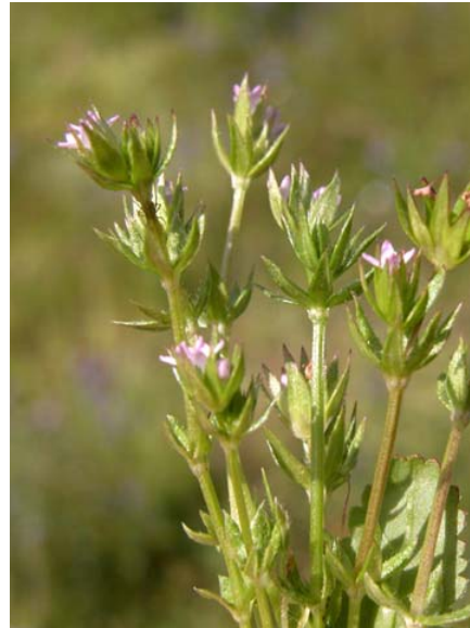
Blue Field Madder Sherardia arvensis Introduced Annual Madder Family