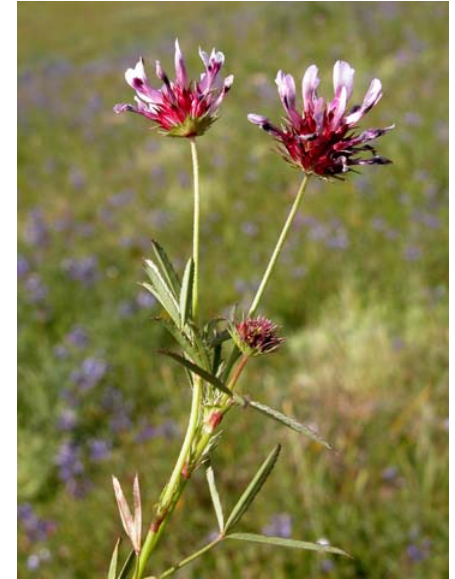
Tomcat Clover Trifolium willdenovii Native Annual Pea Family