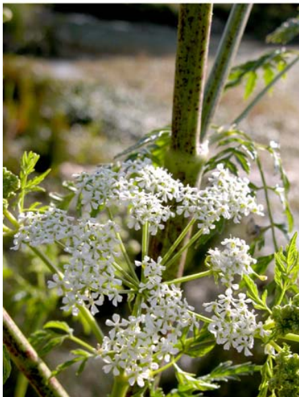
Poison Hemlock Conium maculatum Introduced Biennial Carrot Family