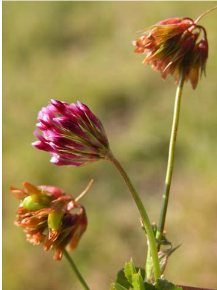
Pinpoint Clover Trifolium gracilentum var. gracilentum Native Annual Pea Family