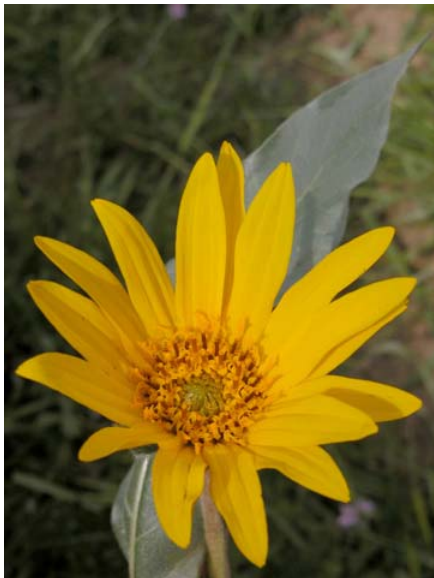
Narrow-leaf Mule's Ear Wyethia angustifolia Native Perennial Sunflower Family