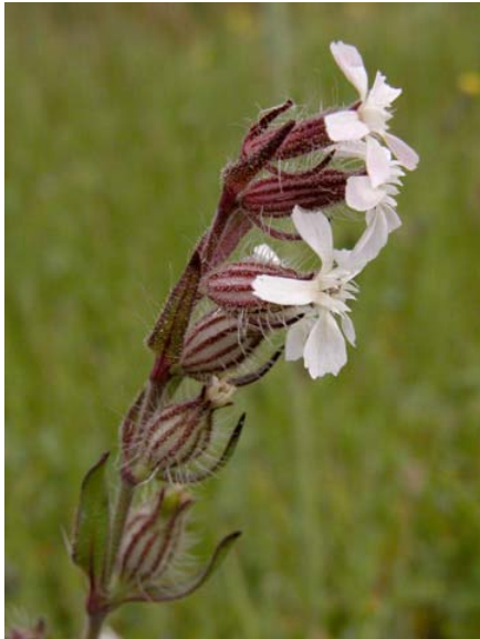
Windmill Pink Silene gallica Introduced Annual Pink Family