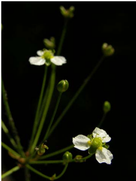
Common Water Plantain Alisma plantago-aquatica Native Perennial Water-Plantain Family