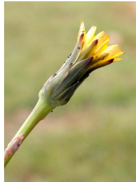
Smooth Cat's-ear Hypochaeris glabra Introduced Annual Sunflower Family