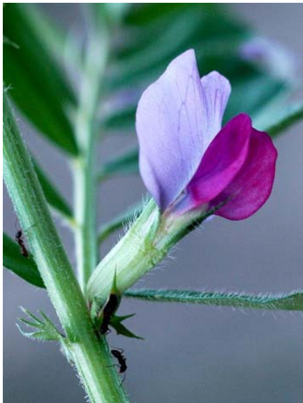
Spring Vetch Vicia sativa ssp. sativa Introduced Annual Pea Family