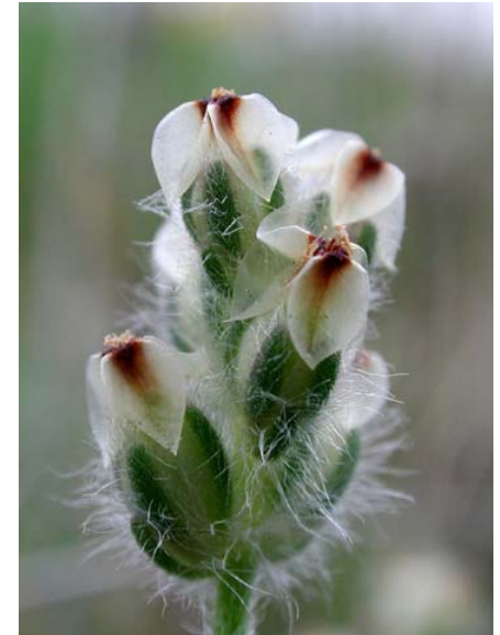
California Dwarf Plantain Plantago erecta Native Annual Plantain Family