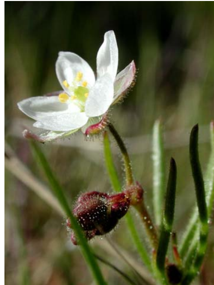
Stickwort Spargula arvensis ssp. arvensis Introduced Annual Pink Family