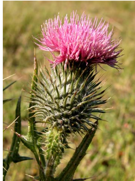
Bull Thistle Cirsium vulgare Introduced Biennial Sunflower Family