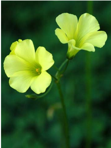
Bermuda Buttercup Oxalis pes-caprae Introduced Perennial Oxalis Family