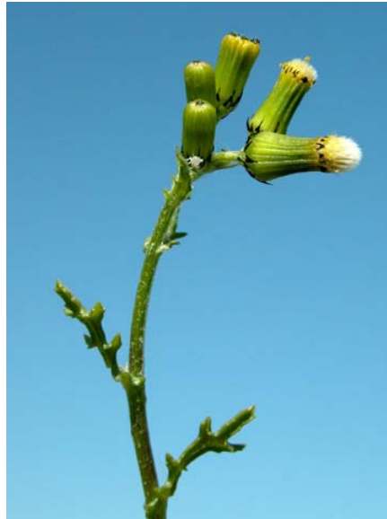
Common Groundsel Senecio vulgaris Introduced Annual Sunflower Family