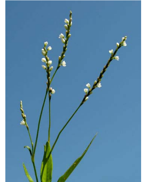
Mild Water Pepper Polygonum hydropiperoides Native Perennial Buckwheat Family