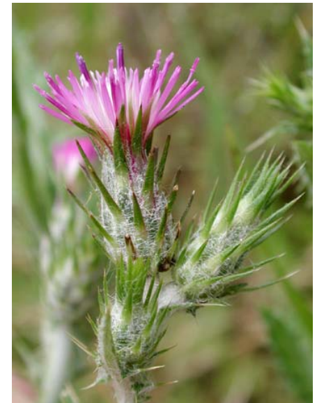
Italian Thistle Carduus pycnocephalus Introduced Annual Sunflower Family