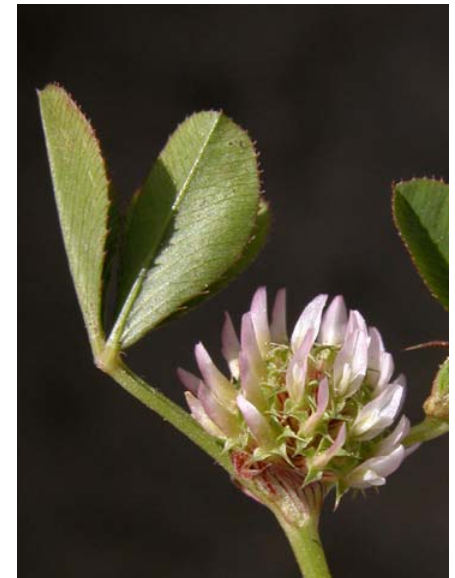
Clustered Clover Trifolium glomeratum Introduced Annual Pea Family