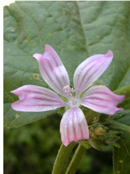
Bull Mallow Malva nicaeensis Introduced Annual Mallow Family