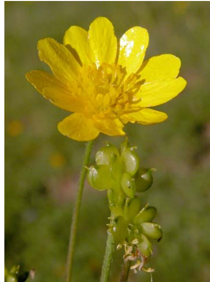
California Buttercup Ranunculus californicus Native Perennial Buttercup Family