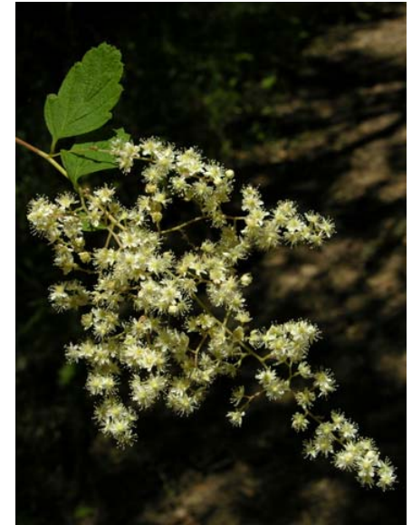
Creambush / Ocean Spray Holodiscus discolor Native Perennial Rose Family