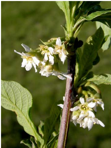
Oso Berry Oemleria cerasiformis Native Perennial Rose Family