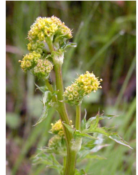
Pacific Woodland Sanicle Sanicula crassicaulis Native Perennial Carrot Family