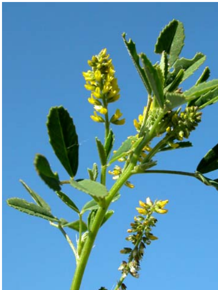
Sour Clover Melilotus indica Introduced Annual-Biennial Pea Family