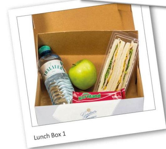
Lunch Box 1