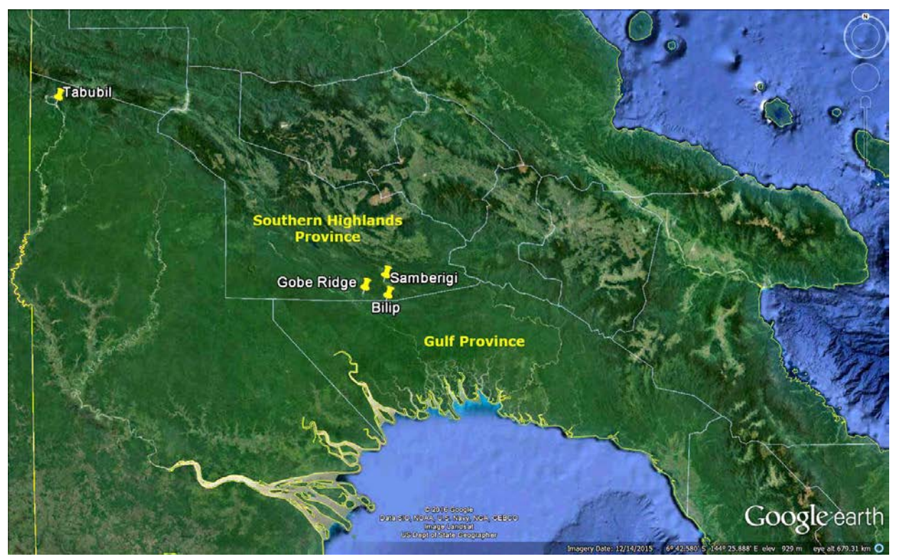
Fig. 3: Map showing location of Bilip, Gulf Province, Papua New Guinea.

Remarks: The shape of the head and body, slender digits and large eyes identify this gecko as Cyrtodactylus sp. The colours and markings on the head, nape, body and tail are similar to Cyrtodactylus serratus Kraus, in particular the dark chevron on the nape and paired dark blotches either side of the vertebral line which morph into dark bands on the tail. Cyrtodactylus serratus is diagnosed by having "highly raised, dentate tubercles arrayed along the length of each skin fold" (Kraus, 2007). Fig. 1 (inset) is a close-up of the lateral skin fold near the right hindlimb: this grainy image hints at the possible presence of dentate tubercles, although the arrangement of tubercles appears more sparse than might be expected for Cyrtodactylus serratus .