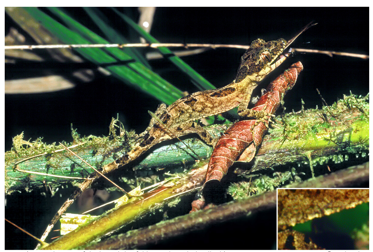
Fig. 1. (Inset: close-up of the lateral skin fold near the right hindlimb).

Description of record : The subject was found consuming a winged insect on a mound of vegetation at the edge of an unsealed road through primary forest (Figs. 1 and 2.): the vegetation comprised felled tree trunks, bulldozed saplings, canopy vegetation and forest floor vegetation pushed to the side of the road during recent road construction. Its snout-vent length was unrecorded, however it was relatively small in size (possibly a juvenile) and, based on the size of the insect being consumed, had a minimum estimated snout-vent length of 4 cm.