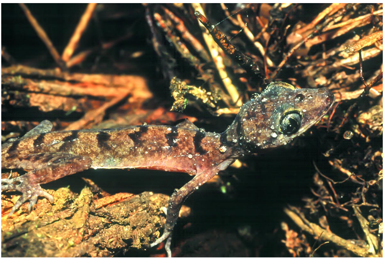
Fig. 4.

Description of record : A gecko of estimated snout-vent length of 4.5 cm was found exploring an area of fallen vegetation, next to an unsealed road through primary forest (Fig 3.).