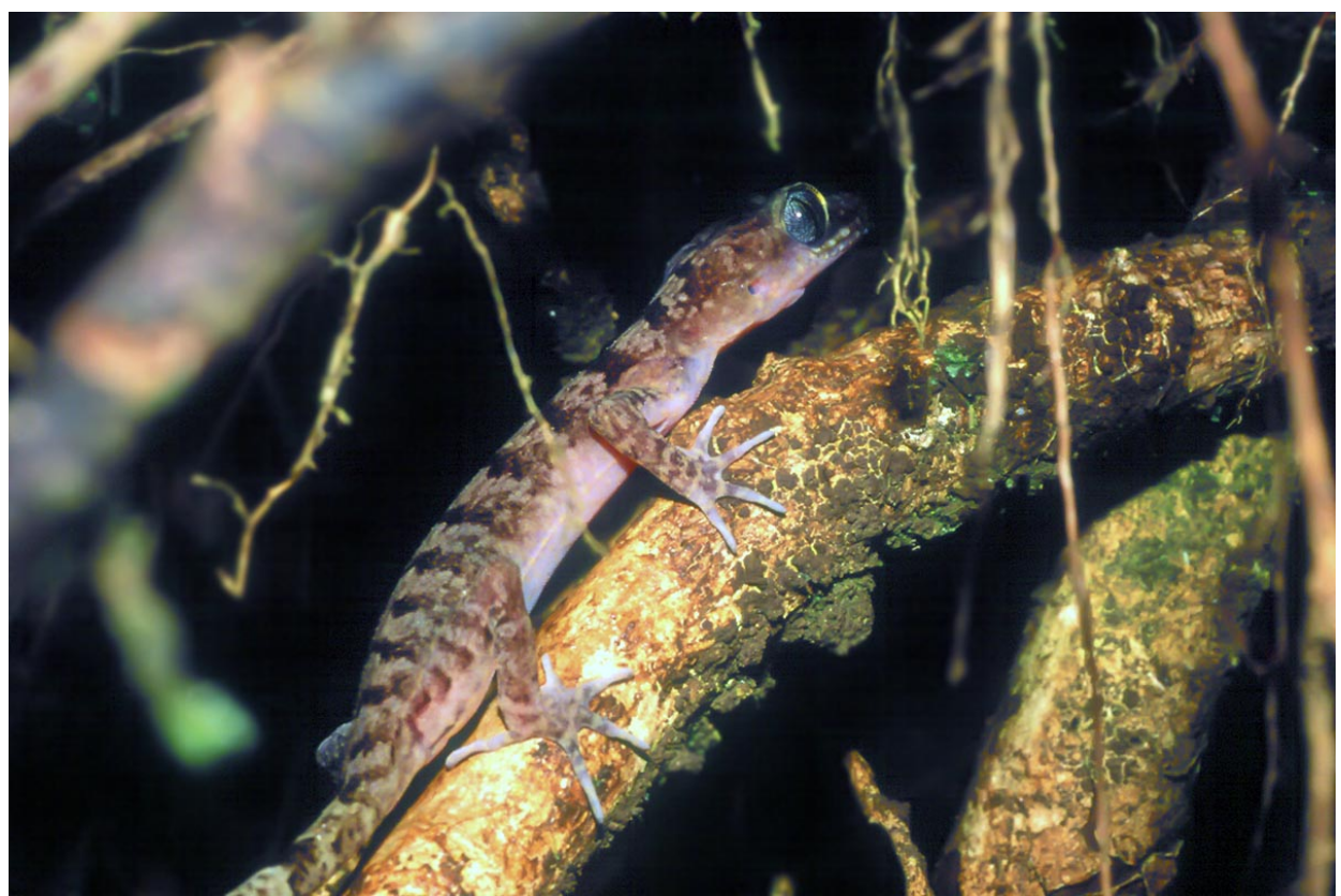
Fig. 5.

Description of record : A gecko of estimated snout-vent length of at least 8 cm was found partly concealed beneath fallen vegetation, next to an unsealed road through primary forest (Fig 4.).