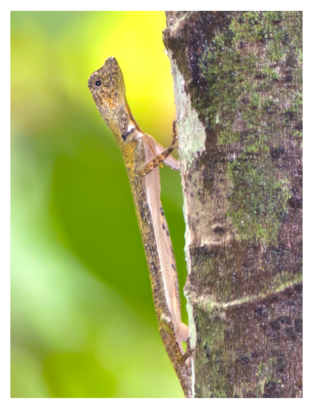
Fig. 5: Draco quinquefasciatus (male), 31 May 2011.