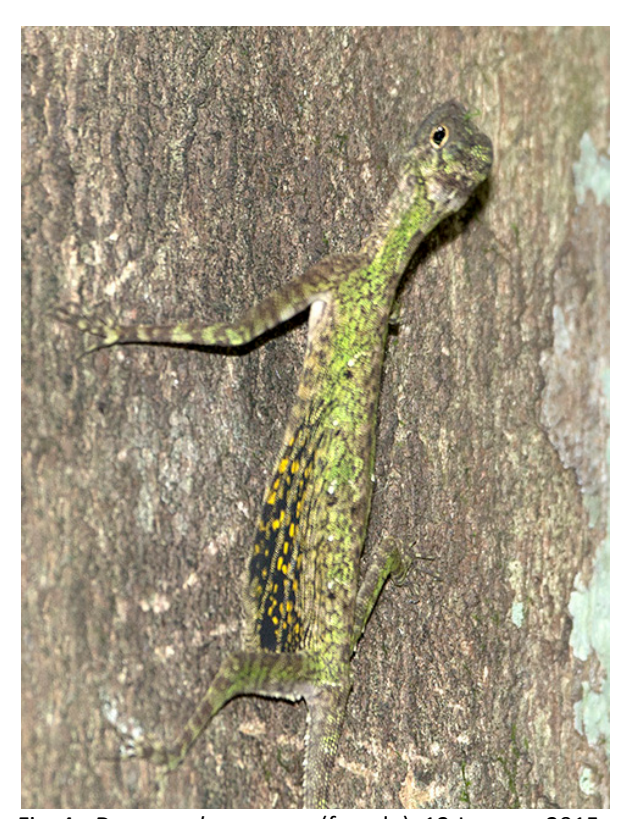
Fig. 4: Draco melanopogon (female), 12 January 2015.