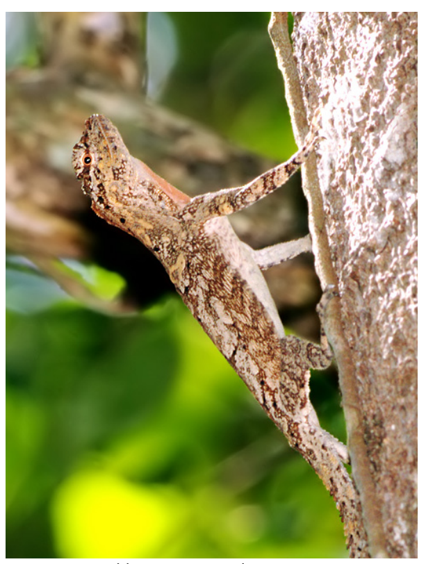
Fig. 2 : Draco abbreviatus, 20 July 2011.