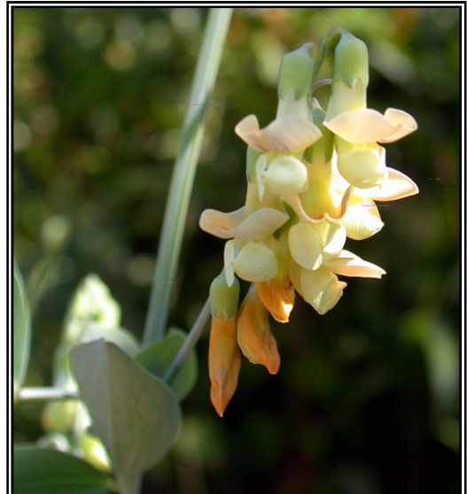
Figure 6. Spot the difference The inflorescences of L. hasslerianus (left), L. davidii (below, left) and Vicia pisiformis (below) are strikingly similar.

the yellow, waxy flowers are merely a different means to attract the same pollinator, or perhaps they exploit other pollinators that have not been observed yet on the flowers.