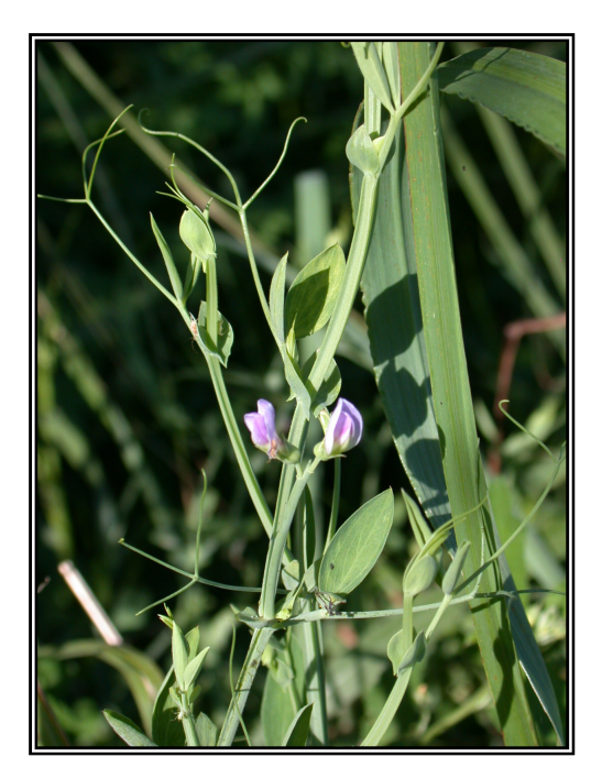
Figure 4 (above). Lathyrus nigrivalvis This species has a relatively small stature and only 2 flowers per inflorescence, allowing it to be readily distinguished from other species in the genus.

This habitat surrounds the Paraguay and Parana Rivers (in Corrientes, Chaco and Formosa provinces), where we collected L. macrostachys (Fig. 3) and L. nigrivalvis (Fig. 4). Neither of these species is present in any of the major UK collections. Both blacken on drying and are evidently close to the traditional view of Lathyrus magellanicus . These collections were therefore particularly important for understanding the interrelationships and species delimitation amongst black-drying South American Lathyrus . Our collections of L. nigrivalvis had robust rootstocks, suggesting that they are perennial plants. This species has previously only been recorded as an annual.