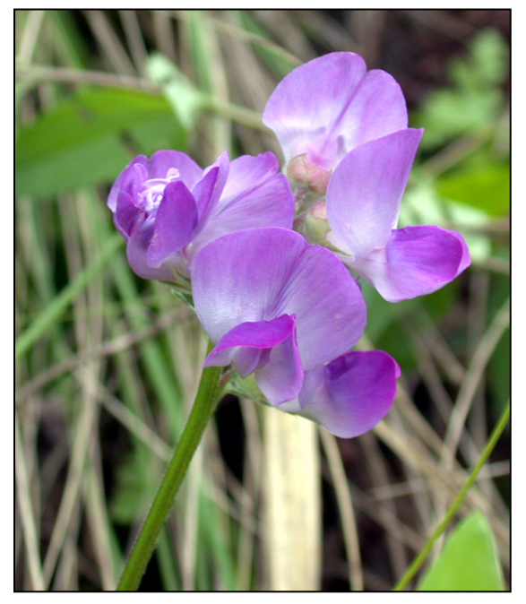
Figure 7 a) The dense raceme of L. pubescens (above) has relatively pale purple-blue flowers.

The L. pubescens at this altitude (circa 1500m) was typically more pubescent than that of the collection made at lower altitude in Corrientes province (circa 40m).