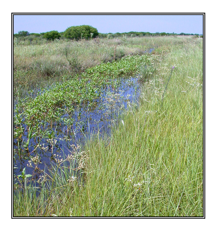
Figure 5. Wet chaco swamp Typical wet chaco swamp in eastern Chaco province. Such areas are permanently waterlogged and highly biodiverse.

The wet chaco habitat (Fig. 5) represents a uniquely South American ecosystem, Lathyrus palustris is the sole true wetland species in the northern hemisphere. This is one of the habitats that we visited in which human influence is relatively limited. This is mainly due to its relative isolation from large centres of population and because the land is unsuited to grazing. Consequently species diversity is particularly high here.