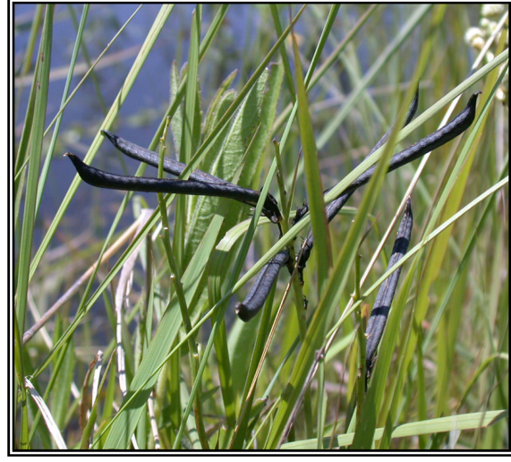
Figure 3 (above). Lathyrus macrostachys The black, linear pods shown here are typical of the black-drying L. magellanicus group. This is from a large patch of the species found growing on the borders of Chaco and Formosa provinces.