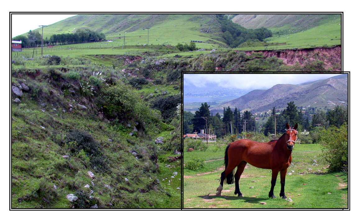
Figure 8. Lathyrus macropus habitat. In the Andean foothills of Tafi del Valee. (Inset) one of the many horses that graze the area.

Our finds of this species highlighted the influence of grazing on the distribution of Lathyrus as it only grew on rock faces inaccessible to cattle and horses. The surrounding vegetation was exclusively close-cropped grassland, with scant Alnus forest in gulleys (Fig. 8). Further south in Mendoza province, L. macropus is said to be particularly abundant and forms extensive swathes of purple flowers.