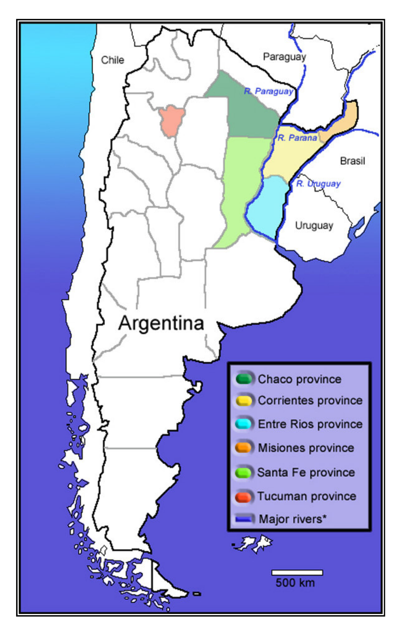
Figure 2. Areas visited The coloured regions highlight the Argentine provinces in which we collected.

Figure 2 summarizes the coverage of the field expedition.