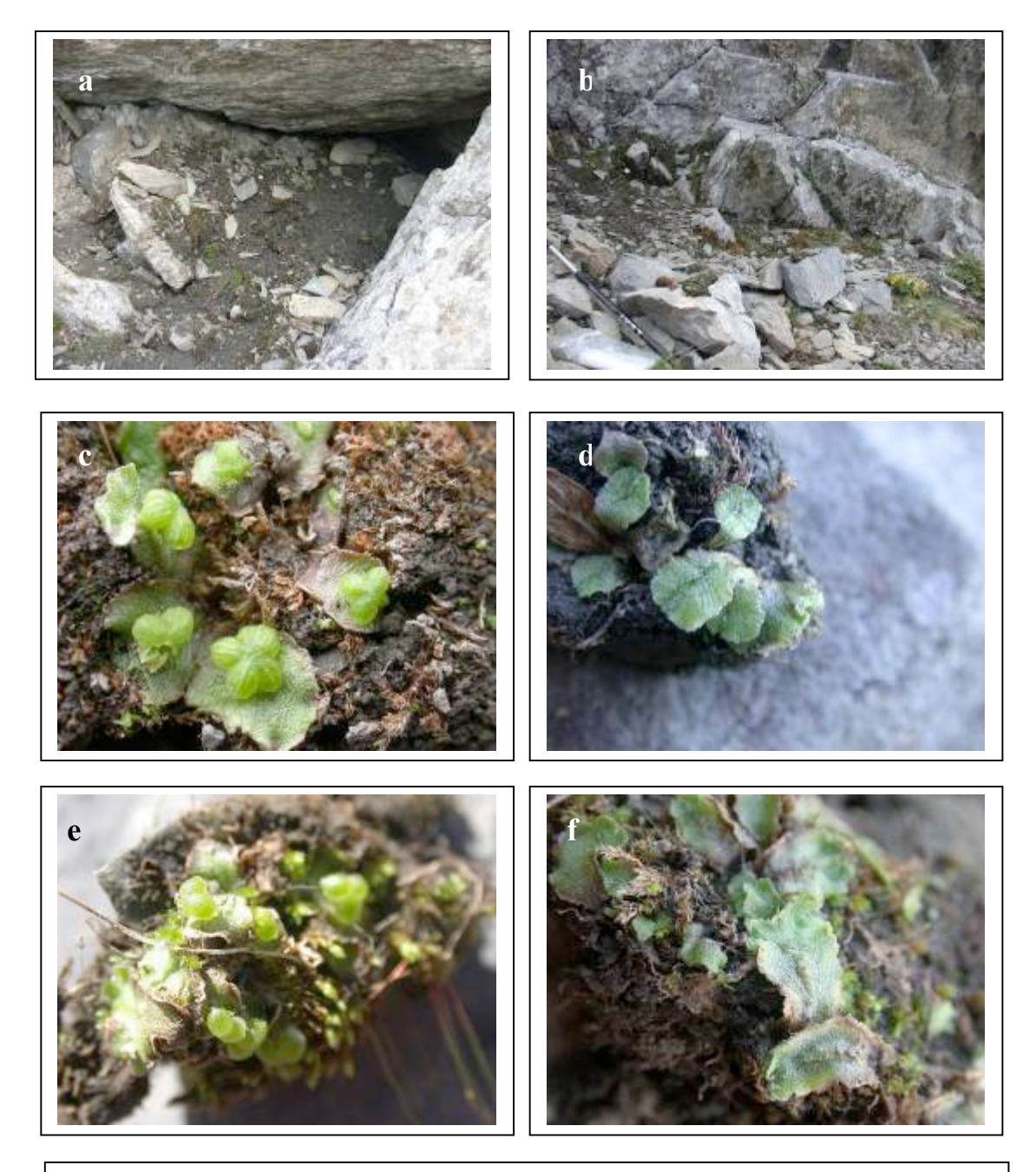
Figure 2. A. hyalina (SR – 03): a and b) a photographs of North facing limestone valley in Canton Vaud below La Tourche above Morcles; c and e) Female plants with young carpocephala d and f) Male plants with antheridia