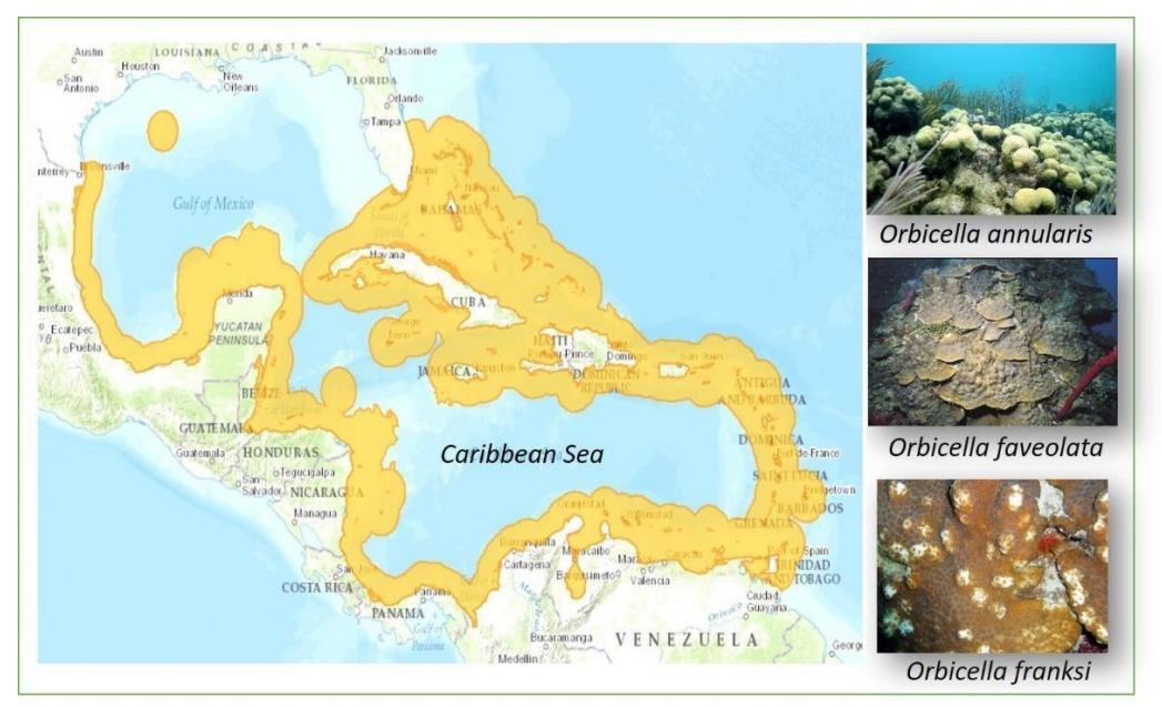
Figure 1. Global distribution of Orbicella coral species. Modified image from Aronson et al. (2008).