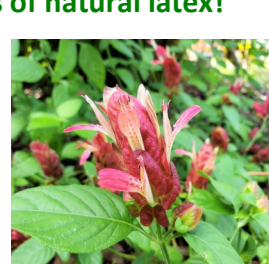
Red Shrimp Plant Justicia brandegeana