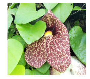
Dutchman's Pipe Aristolochia macrophylla