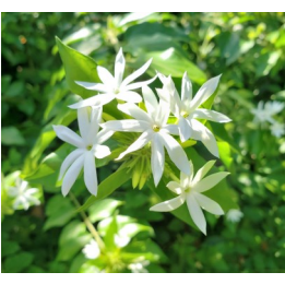
Downy Jasmine Jasminum multiflorum

Keep an eye on the agave flowering at the south end of Orchid Lane. It only flowers once in its life, but when it does it sends a flower spike soaring to heights of up to 20' feet tall!