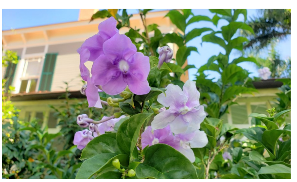
The Yesterday, Today, and Tomorrow plant (Brunfelsia grandiflora) is a November highlight next to the pergola that separates the Main House and Guest House.