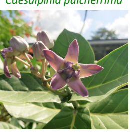
Giant Milkweed Calotropis gigantea

Florida since they still have plenty of food!