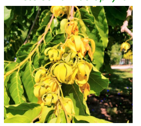
Ylang Ylang Tree Cananga odorata