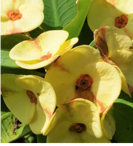
Crown of thorns (Euphorbia milii) blooms best as the colder weather sets in. This Madagascar native drew the attention of Thomas Edison thanks to its milky sap that contains lots of natural latex!