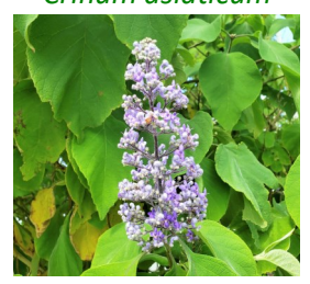
Tropical Lilac Cornutia grandifolia