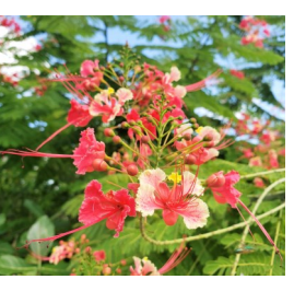
Dwarf Poinciana Caesalpinia pulcherrima