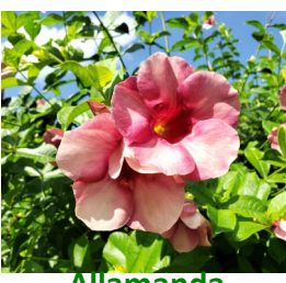
Allamanda 'Cherries Jubilee' Allamanda cathartica