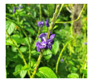
Blue Porterweed Stachytarpheta jamaicensis