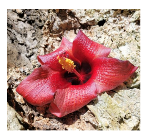
Blue Mahoe Tree Hibiscus elatus