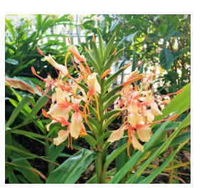
Kahili Ginger Hedychium gardnerianum