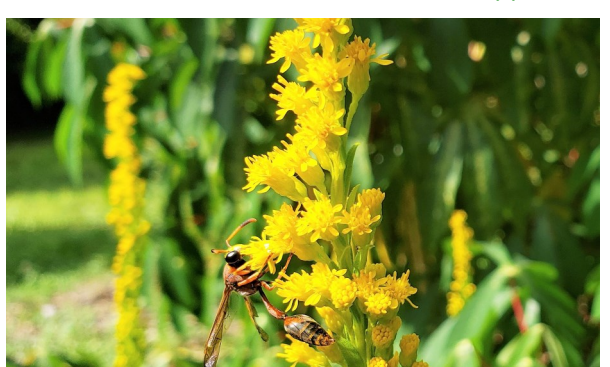
Bees aren't the only pollinator insects. Goldenrod (Solidago spp.) is blooming in the rubber research beds. Find it and the plants above outside of Edison's Lab.