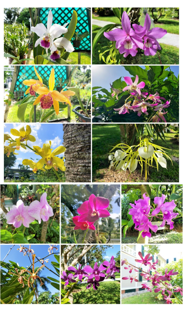
Here's a selection of the orchids that are blooming around the estates this month. Most are attached directly to tree trunks especially along Orchid Lane—but be sure to check out the orchid misting station near security to find some rather unusual varieties of Mina Edison's favorite flower!