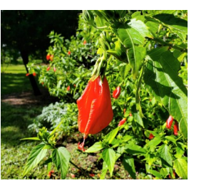
Sleepy Hibiscus Malvaviscus arboreus