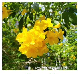
Yellow Elder Tecoma stans