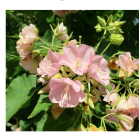
Pink Wild Pear Dombeya burgessiae