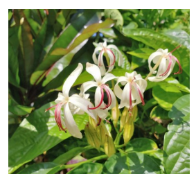
Fountain Clerodendrum Clerodendrum minahassae