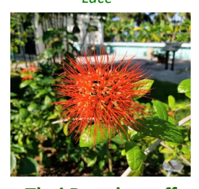
Thai Powderpuff Combretum constrictum