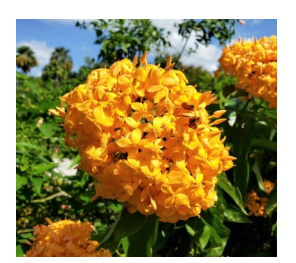
Yellow Ixora Ixora coccinea