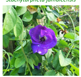
Blue Pea Vine