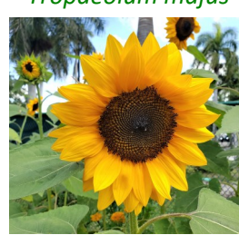
Sunflower Helianthus sp.