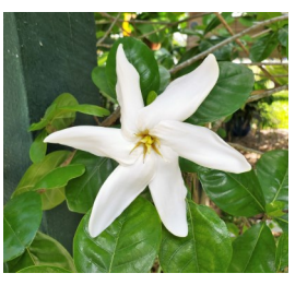
Tahitian Gardenia Gardenia taitensis