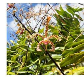
Spider Orchid Orchid flos-aeris