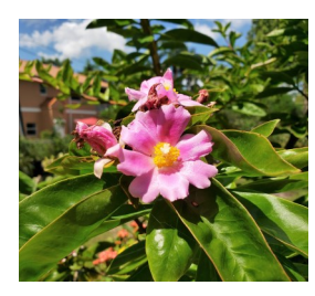
Pereskia Pereskia grandiflora