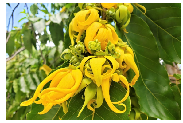
The amazing ylang ylang tree (Cananga odorata) is firing up south of Edison's Study.