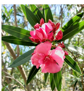
ancient Greece. There are some mature specimens blooming on the Ford Estate.