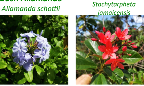
Blue Plumbago Plumbago auriculata