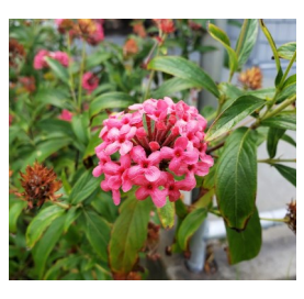
Panama Rose Rondeletia stigosa