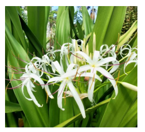
Crinum Lily Crinum asiaticum