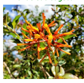
Firebush Hamelia patens