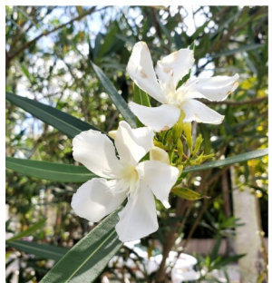
Oleander (Nerium oleander) has been cultivated around the Mediterranean since