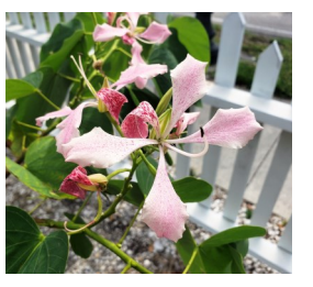
Pink Orchid Tree Bauhinia monandra