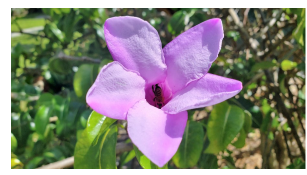
Madagascar Rubber Vine (Cryptostegia madagascariensis) is blooming in the research beds south of the Banyan Tree. Uncarina and Pereskia are in the nearby succulent garden.