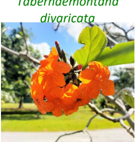
Geiger Tree Cordia sebestena