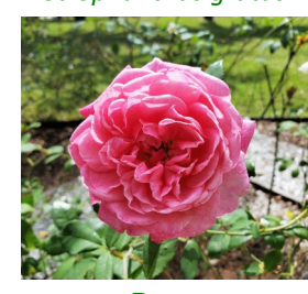
Rose Rosa spp.