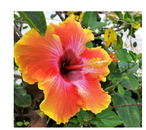
Hibiscus Hibiscus spp.