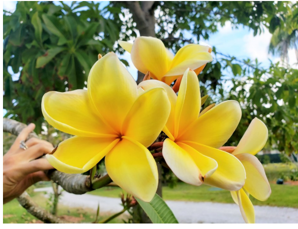
Frangipani (Plumeria spp.) are flowering for the first time since their winter dormancy. Typically, the yellow varieties bloom first, followed by the pink, and the red. These beautiful flowers hold significance for cultures all over the world, from ancient Mesoamerica, to Polynesia, India, and even Africa. Look for this specimen near the Security Station.