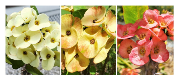
Crown of thorns (Euphorbia milii) was considered by Thomas Edison a promising potential source of domestic natural rubber.