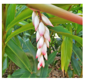
Shell Ginger Alpinia zerumbet