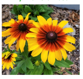
Rudbeckia hybrid Rudbeckia sp.