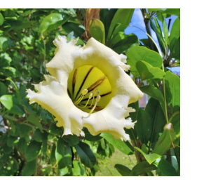
Chalice Vine Solandra maxima