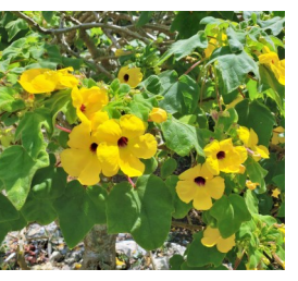
Uncarina Uncarina grandidieri