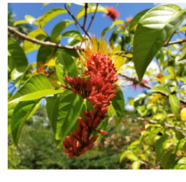
Monkey Brush Combretum rotundifolium