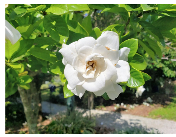
It's that time of year! Sweet-smelling gardenia (Gardenia jasminoides) is starting to bloom in Southwest Florida. You'll find several gardenia plants near the entrance to the Moonlight Garden.