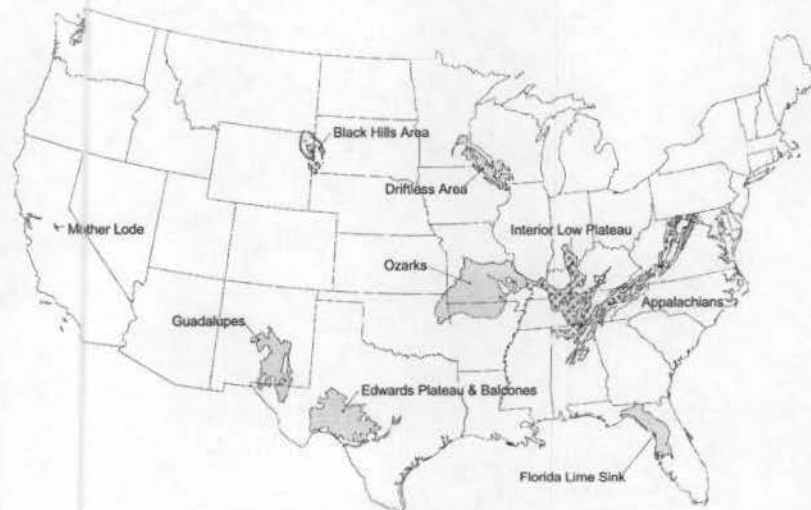
Figure 1. Map of the karst regions considered in this paper. The Interior Low Plateau is shown in stippling to differentiate it from the Appalachians and the Ozarks.

All of the previous studies of regional differences have been piecemeal and for good reason. Until very recently there has been no comprehensive list of stygobites and troglobites for any area in sufficient detail for such an analysis. In this contribution, we take advantage of the list of stygobites and troglobites for each county in the US that is now available on the world-wide web at www.karstwaters.org/troglist (Culver et al. 2000). Our focus here is on the regional differences in the cave faunas in the coterminous states of the USA. Our previous work has looked at a much smaller scale, that of the county. But patterns at one scale are not necessarily preserved at other, larger or smaller scales. The analysis of cave regions is important because each region, such as the Florida Lime Sinks, has a unique geology, a unique history, and a distinct climate. These kinds of regional scale differences may in turn explain differences in stygobitic and troglobitic richness among the regions.