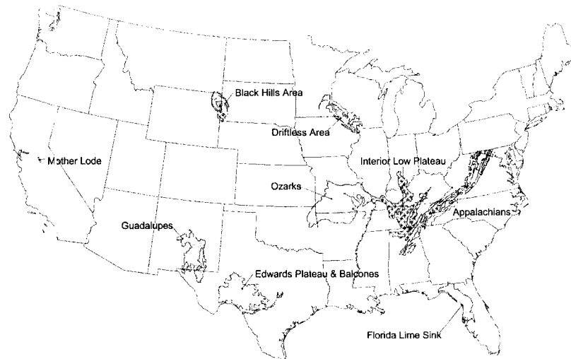
Figure 1. Map of the karst regions considered in this paper. The Interior Low Plateau is shown in stippling to differentiate it from the Appalachians and the Ozarks.

All of the previous studies of regional differences have been piecemeal and for good reason. Until very recently there has been no comprehensive list of stygobites and troglobites for any area in sufficient detail for such an analysis. In this contribution, we take advantage of the list of stygobites and troglobites for each county in the US that is now available on the world-wide web at www.karstwaters.org/troglist (Culver et al. 2000). Our focus here is on the regional differences in the cave faunas in the coterminous states of the USA. Our previous work has looked at a much smaller scale, that of the county. But patterns at one scale are not necessarily preserved at other, larger or smaller scales. The analysis of cave regions is important because each region, such as the Florida Lime Sinks, has a unique geology, a unique history, and a distinct climate. These kinds of regional scale differences may in turn explain differences in stygobitic and troglobitic richness among the regions.