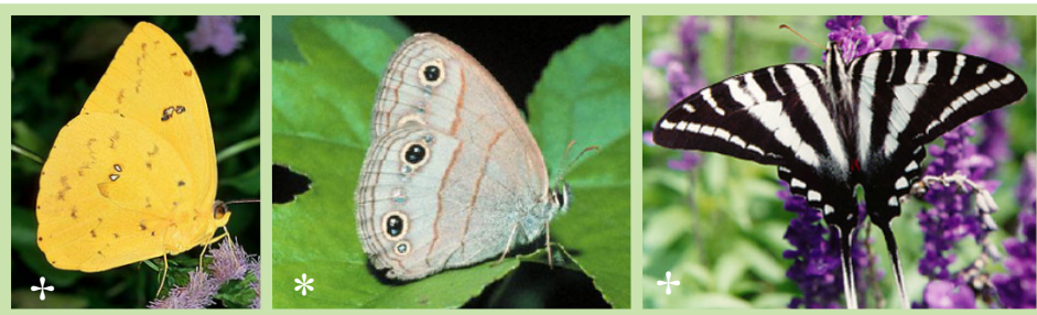
Clouded Sulphur Little Wood-satyr Zebra Swallowtail