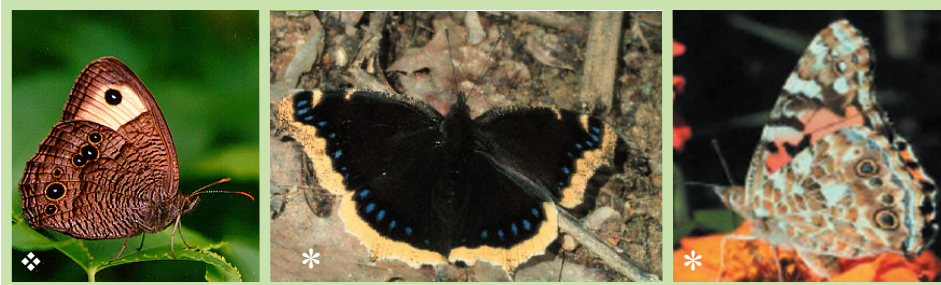
Common Wood Nymph Mourning Cloak Painted Lady