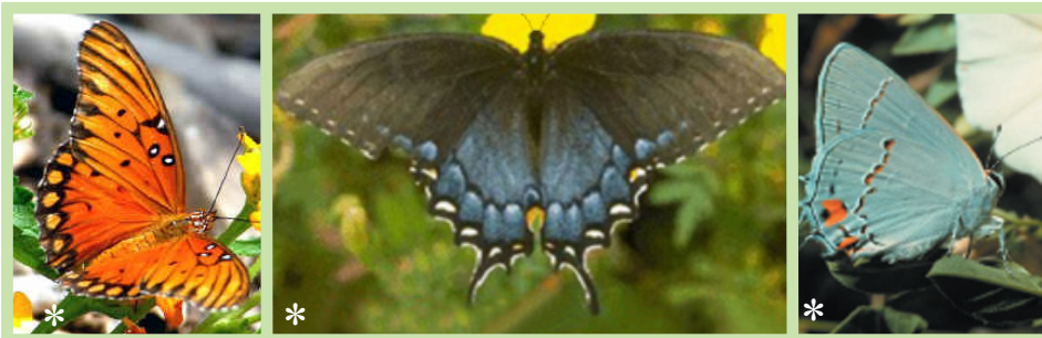
Gulf Fritillary Eastern Tiger Swallowtail (female, black form) Gray Hairstreak