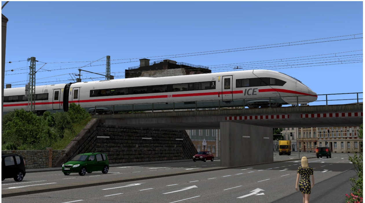
ICE 4 – Series 412, Tz 9005 – 13-part