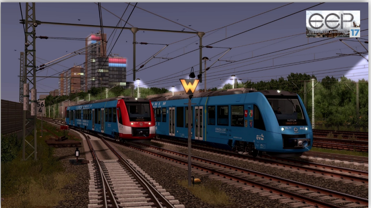
“Hydrogen fuel cells” trains, Alstom Coradia iLint (ÖBB variant for pre-orderers)