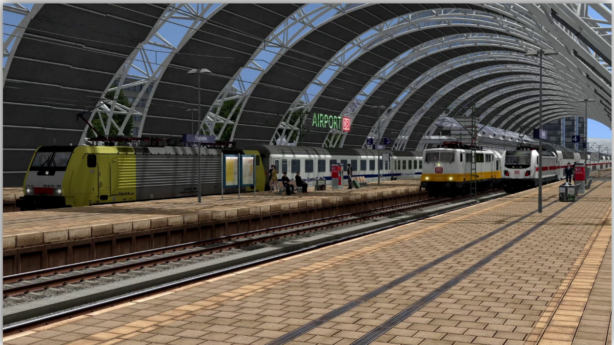
Airport Railway station – Trailer