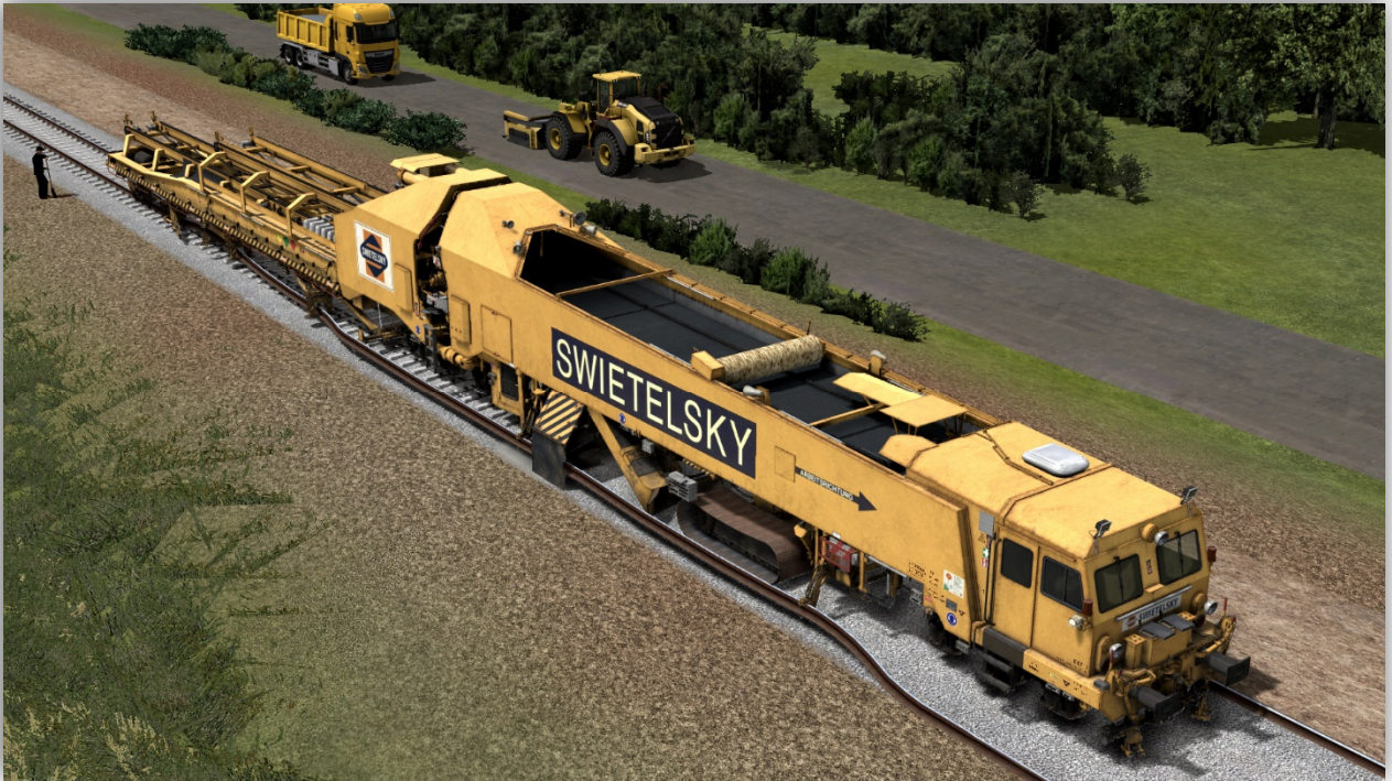
Track construction and track maintenance machines SUZ 500