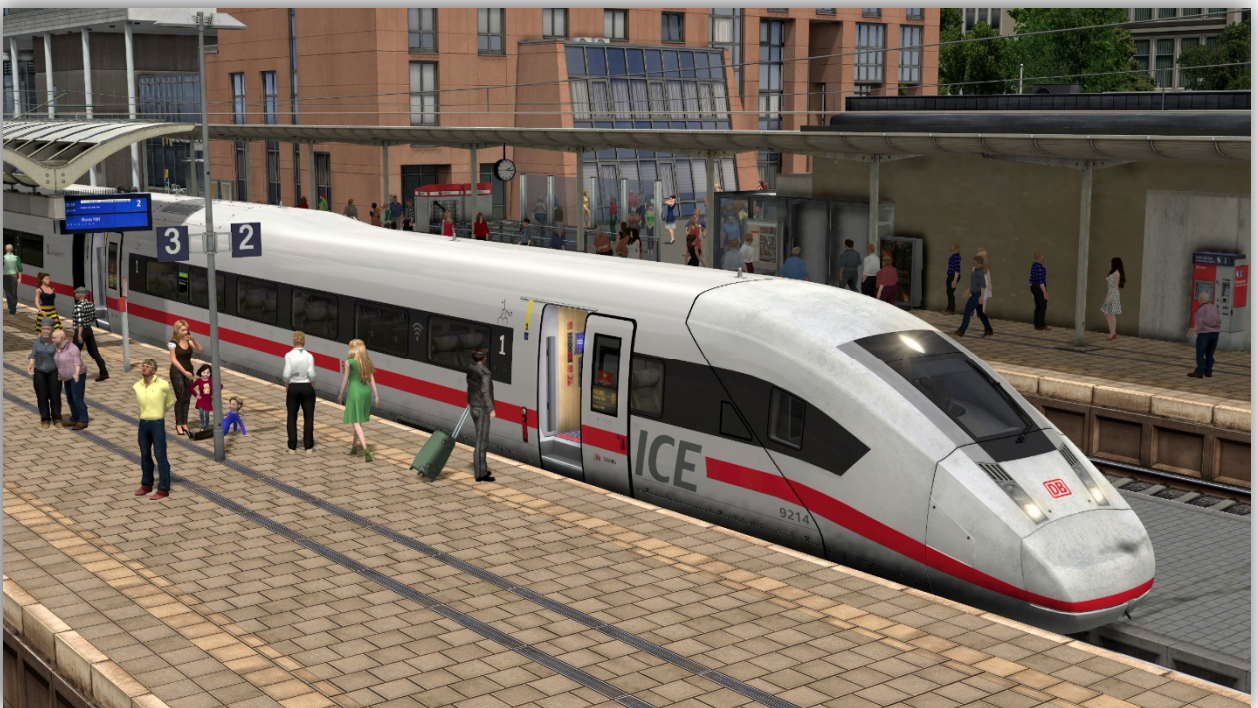
ICE 4 – Series 412, Tz 9214 – 7-part, for pre-orderers