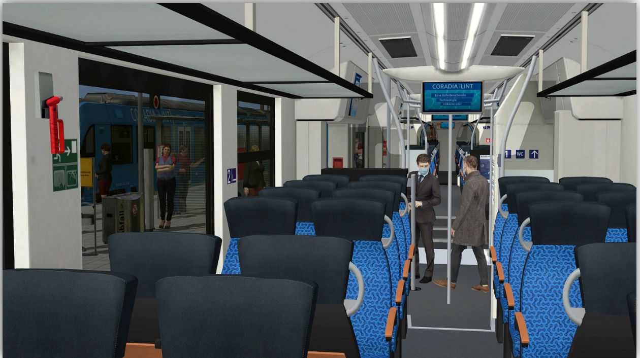
Alstom Coradia iLint - Interior