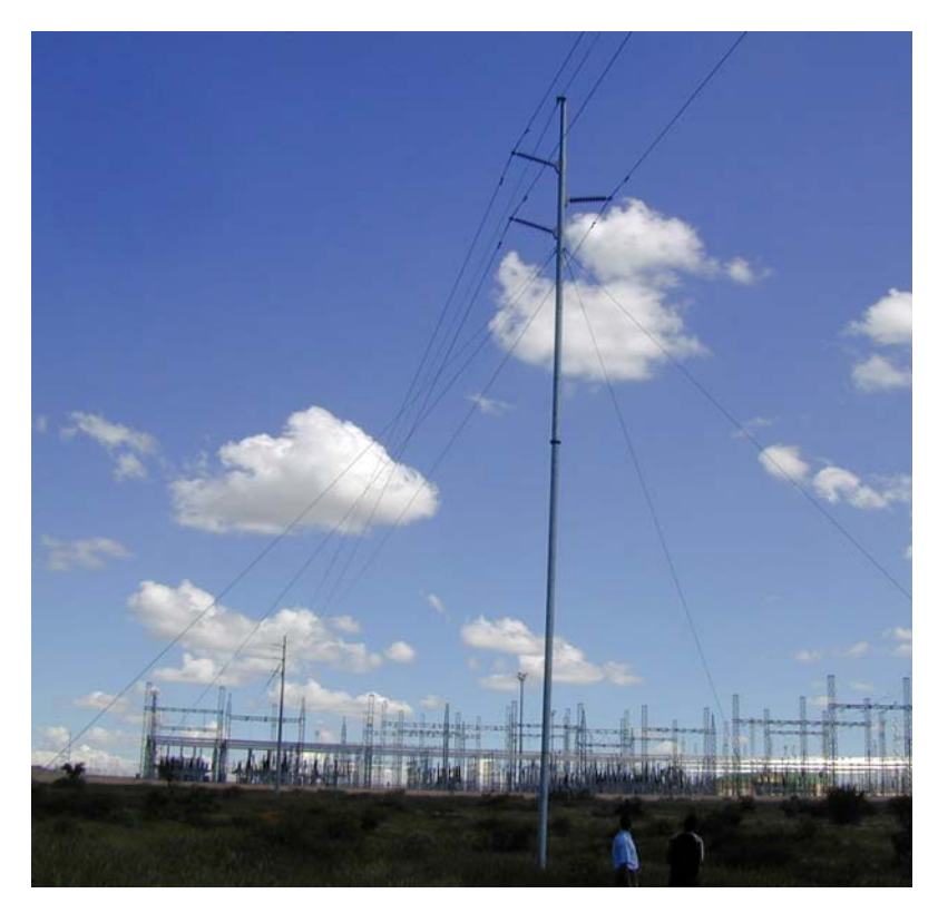
Photo 7 : A typical steel tower used for a 132kV power line. These structures are not visually very intrusive, and there will be no substation such as that shown in the background to this photo.