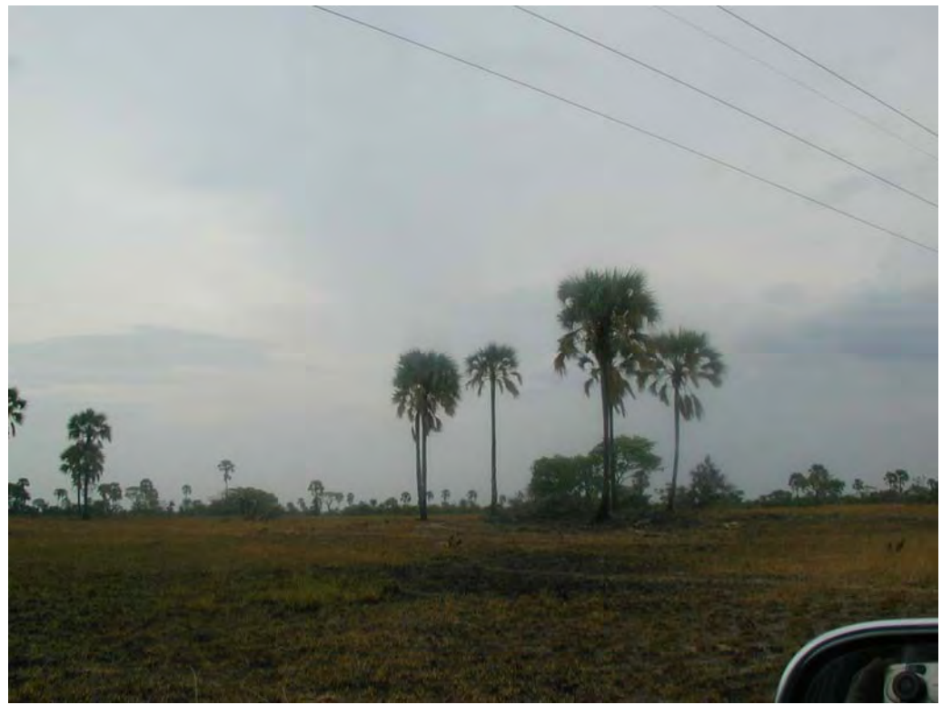
Figure 5: Palm trees common in munga and open grasslands of the Kafue Flats