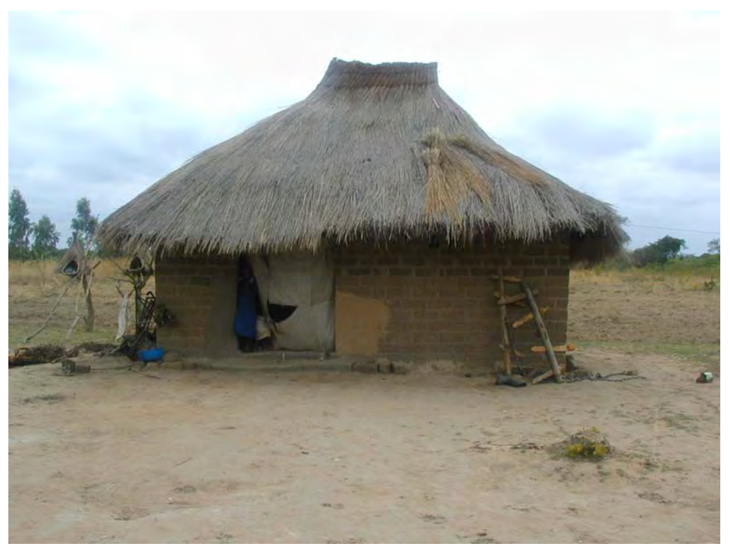
Figure 8: Typical houses in the project area

Houses of chiefs, community buildings, most schools, churches and clinics are made of mud brick and have galvanized iron roofs. A few buildings in KNP have walls of corrugated iron sheet. Houses of park officials and the owners of the Musungwa and Kalala lodges are made of concrete block and have glass windows.