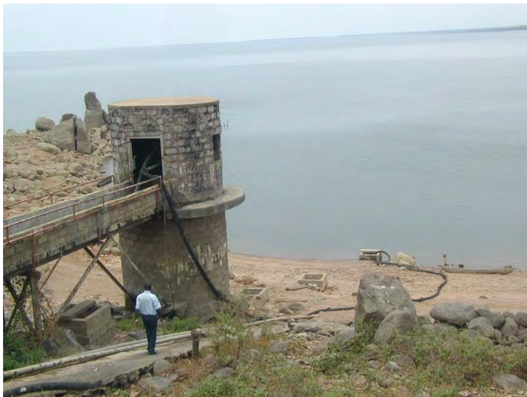
Figure 9: Water pumping station for the water treatment plant at Itezhi-tezhi

reservoir. People in the villages away from the Dam rely on unprotected shallow wells and a few boreholes provided by the Government. Pit latrines are commonly used in the villages. Refer to figure 9