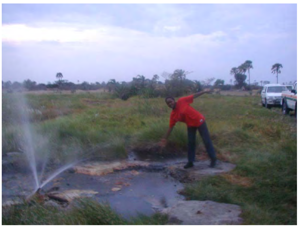
Figure 3: Common hot springs in the Kafue Flats

The impoundment of water in the Itezhi-tezhi reservoir has led to the development of a common feature of hot springs in the area of the Kafue Flats close to the reservoir. This is associated with the confined aquifer that has produced common features associated with artesian wells and hot springs in the area. Refer to Figure 3.