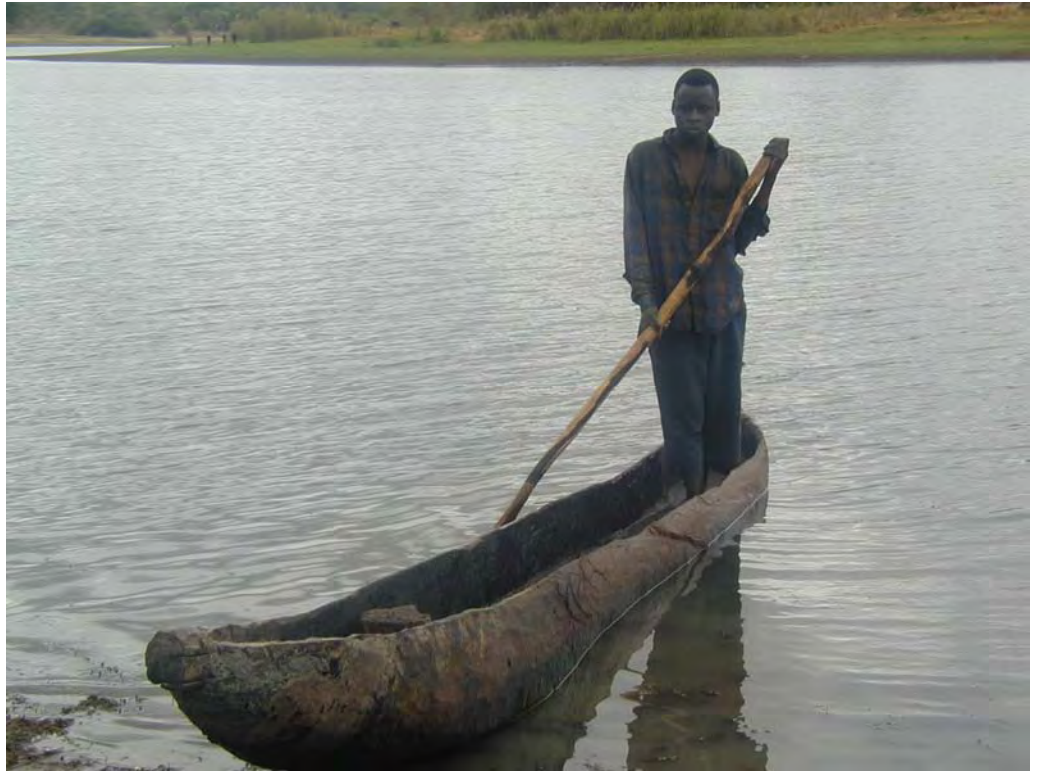
Figure 7: Common vessels used by the Fishermen in Kafue Flats fishery.

Villages away from the reservoir edge are populated primarily by natives of the Southern Province (in which the project is located). The IIa are the traditional indigenous group of the Itezhi-Tezhi area, subsistence herdsmen who also grow maize and cassava. They fish part-time and barter with the lake-shore villages for fish. Other tribal origins represented among the villages away from the reservoir are Batwas and Tongas.