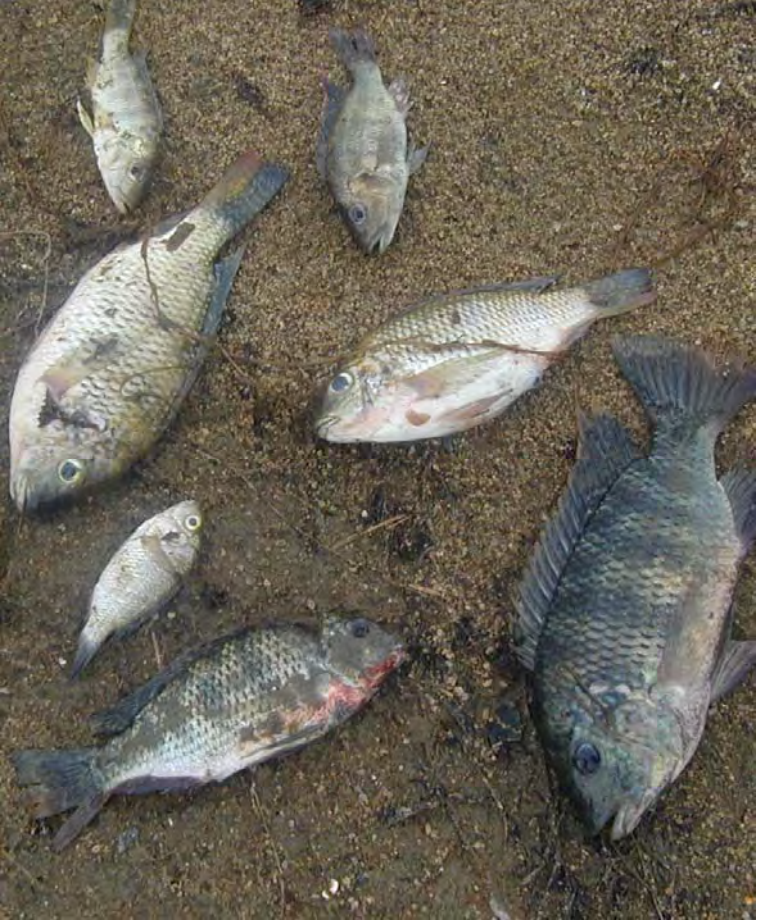
Figure 6: Type of fish in the Lake Itezhi-tezhi and Kafue Flats Fishery

amount fish taken. The highest catch in recent years was recorded in winter of 1993-1994, an exceptionally wet year, when ITT Reservoir was filled and spilling at the dam produced flooding of the flats to an exceptional degree from March through September of 1993. In that year, according to fishermen, even species normally rare in their catch were noticeably more abundant. On the other hand, 1992, when storage was nearly at its lowest (158 MCM) the catch was relatively large (7601 MT). Conversely, in 1986, when storage was high (848 MCM) the catch was the lowest in this ten-year period (4264 MT). Refer to figure 6.