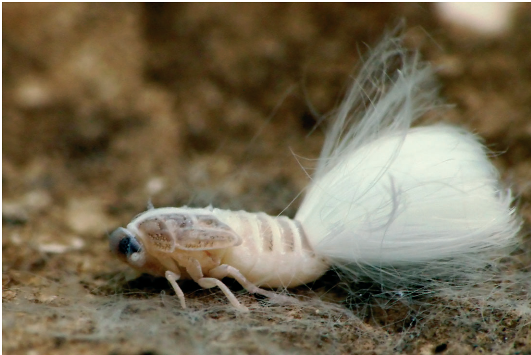
Fig. 3. A late instar nymph of Reptalus panzeri on the undersurface of an overturned stone that previously covered a nest of Aphaenogaster subterranea .