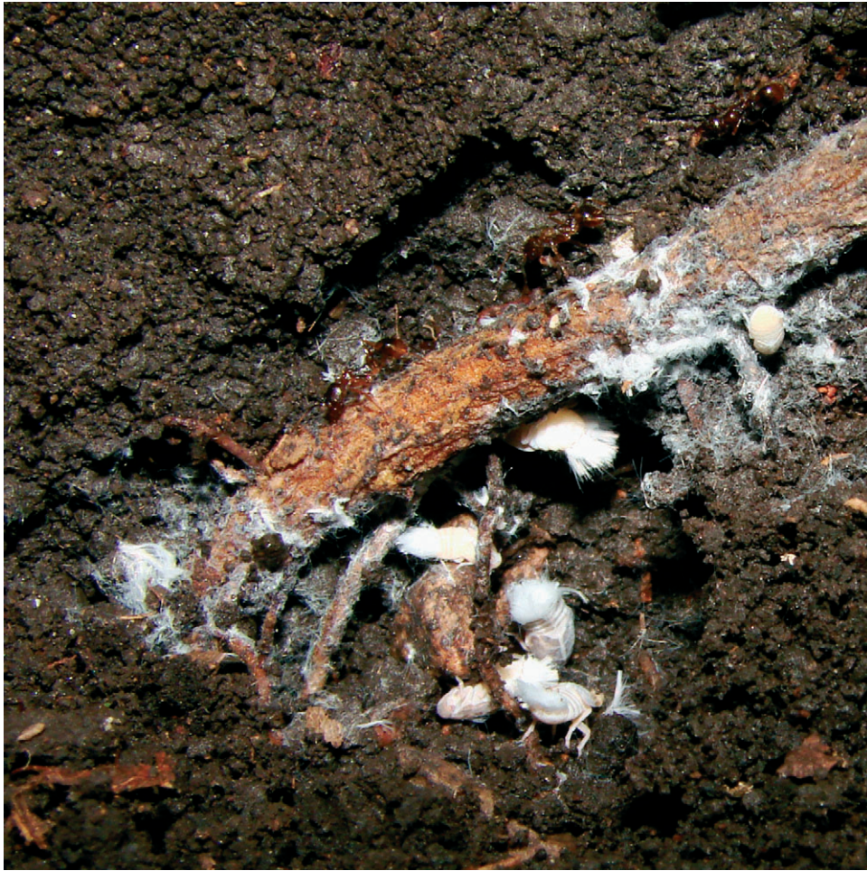
Fig. 2. A group of Reptalus panzeri nymphs on wax covered roots with workers of Aphaenogaster subterranea .