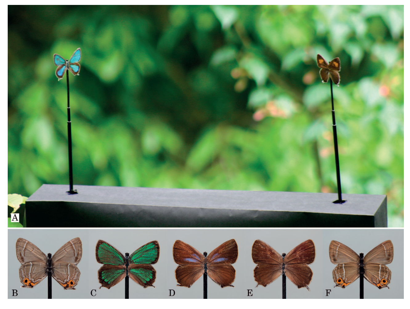
Fig. 1. A picture of a presentation experiment (top) and the wing models used (bottom). A – Male (left) and female (right) wing models of Chrysozephyrus smaragdinus attached to the top of aluminium tubes, which were synchronously rotated using a timing belt and two motors in the black box at the bottom. The dorsal surfaces of the models are shown. B – Ventral view of a C. smaragdinus male. C and F – Dorsal and ventral views of a Neozephyrus japonicus male, respectively. D and E – Dorsal views of type-B and type-O females of N. japonicus , respectively.