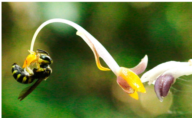
Fig. 3. Small carpenter bee, Ceratina ridleyi Cockerell, the pollinator of Globba leucantha Miq. (Zingiberaceae).

Birds and bees carry pollen of Zingiberaceae in similar ways. Birds collect pollen on their beaks while sucking nectar from flowers, with the pollen attaching to the base of the bill and/or just above on the feathers of the forehead. The pollinating birds in Asia are honeyeaters in the case of Hornstedtia scottiana (Ippolito & Armstrong, 1993), sunbird Anthreptes malacensis (Scopoli) for Etilingera elatior (Classen, 1987) and spiderhunters for Plagiostachys strobilifera (Baker) Ridl.