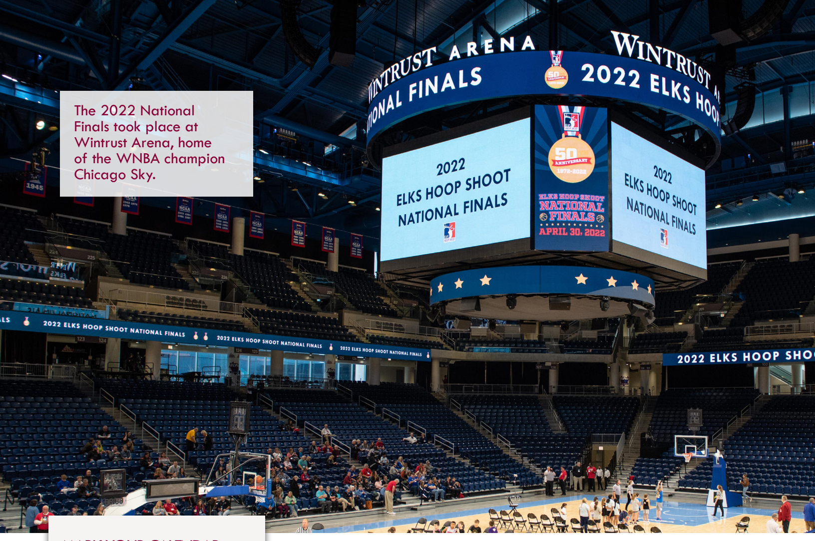
MARK YOUR CALENDAR

JULY 3-6: Elks National Convention in Atlanta