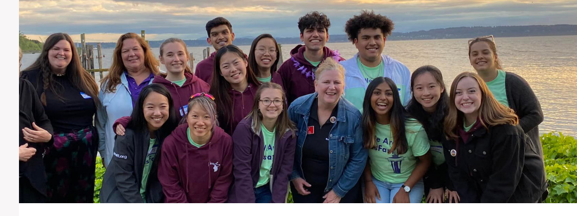
Service Trips, continued from page 5

While the Chicago Service Trip focused on food insecurity, the Seattle Trip offered a broader scope of service at organizations supporting individuals experiencing homelessness, people in recovery, and women experiencing poverty. Scholars spent their days at Immanuel Community Services, Jubilee Women's Center and DESC Rainer House.