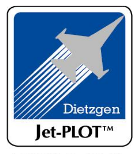
Inkjet Plotter Media