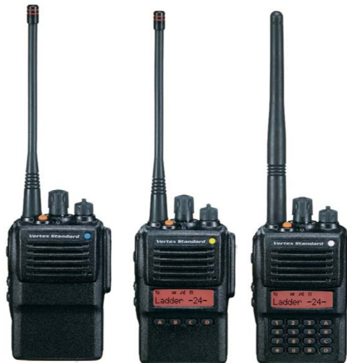
VX-821 VX-824 VX-829