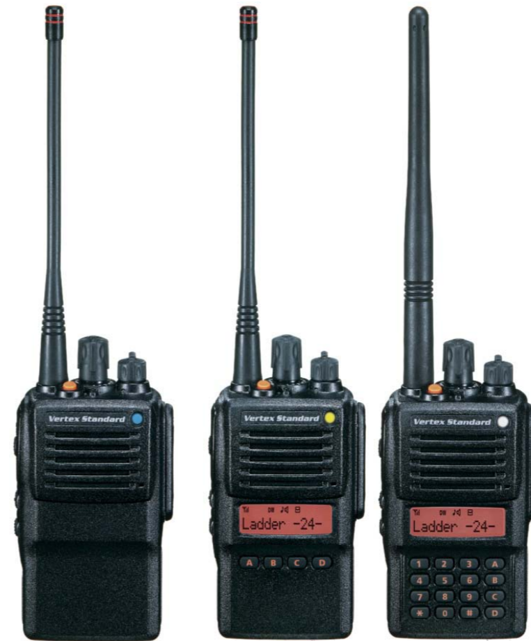
VX-P821 VX-P824 VX-P829