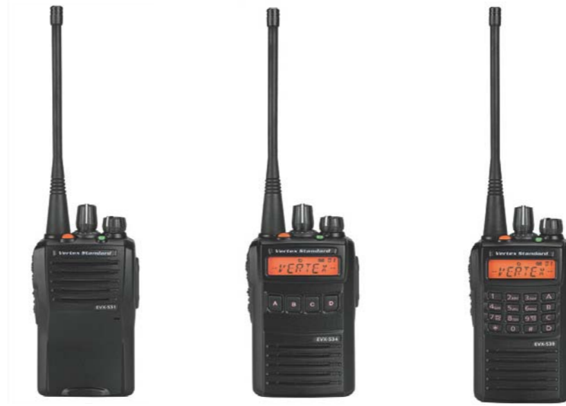
EVX-531 EVX-534 EVX-539