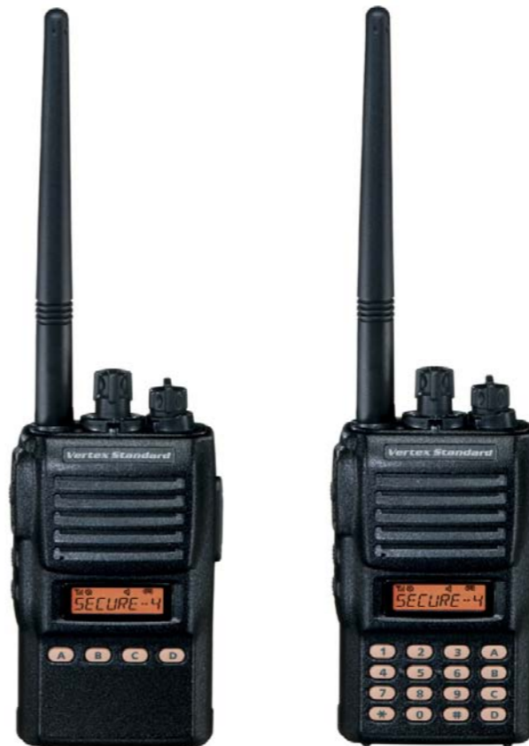
VX-420A (4key) VX-420A (16key)