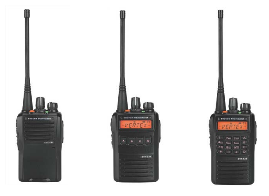
EVX-531 EVX-534 EVX-539