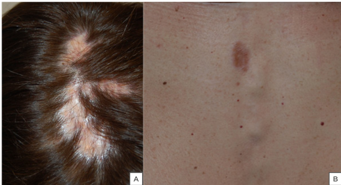
Figure 1: Clinical examination of the patient.

Systemic steroids were used to obtain a quicker halting of the progression of the disease. During the 2 years of follow-up, the disease remained stable in the scalp, without trichoscopic sign of activity, and remained unchanged during this time.