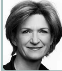
Isabelle Kocher Chief Executive Officer