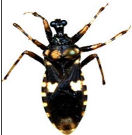
Acanthaspis sexguttata (Fabricius)