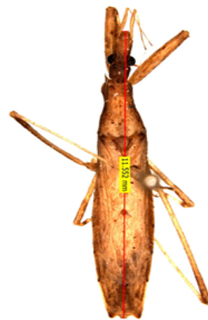
Pygolampis foeda Stal