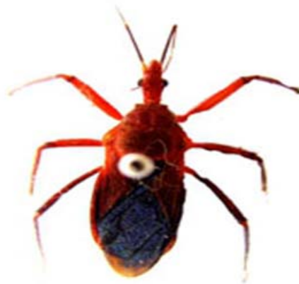
Rhynocoris costalis (Stål)