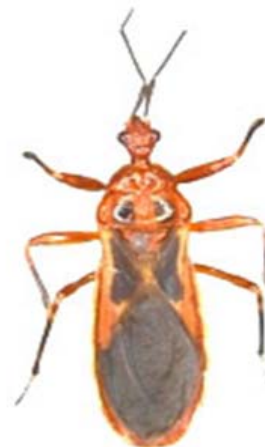
Scadra annulipes Reuter