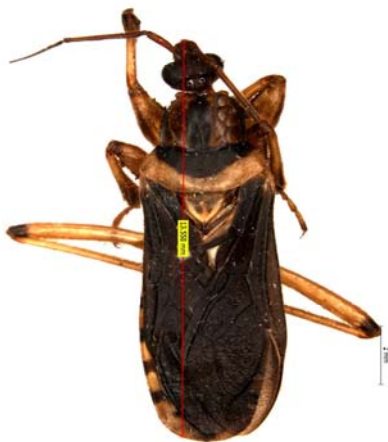
Lestomerus sanctus (Fabr.)