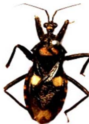
Acanthaspis trimaculata Reuter