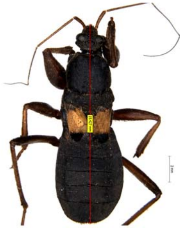
Ectomocoris simulans Distant