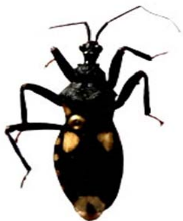
Acanthaspis luteipes Walker