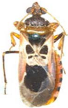
Androclus pictus (Herrich-Schaeffer)