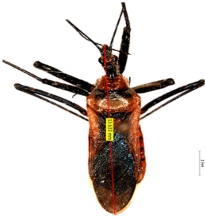
Rhynocoris fuscipes (Fabr.)