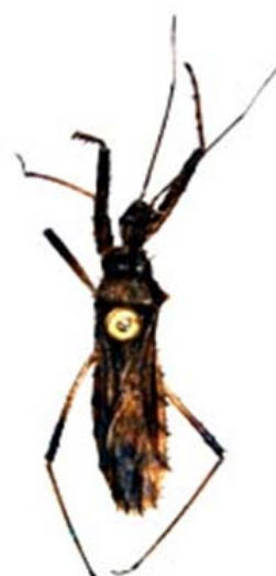
Polididus armatissimus Stal