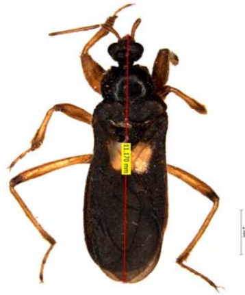
Ectomocoris cordiger Stal