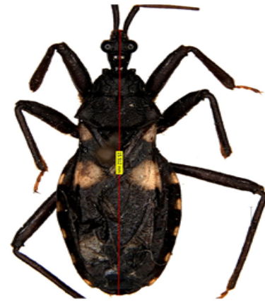
Acanthaspis siva Distant