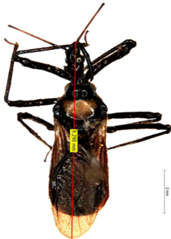
Sphedanolestes variabilis Dist.