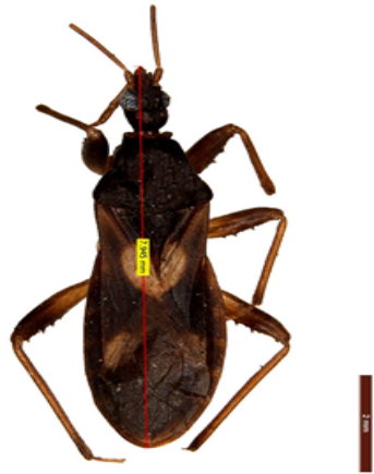
Gerbelius ornatus Distant