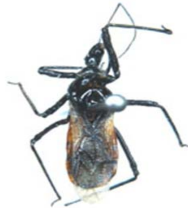
Sphedanolestes indicus Reuter