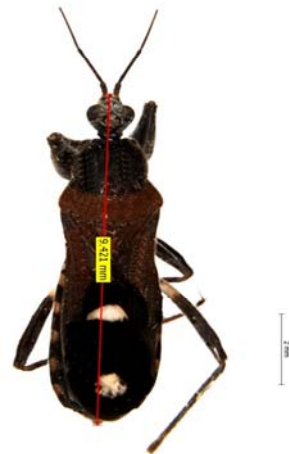
Spilodermus quadrinotatus (Fabr.)