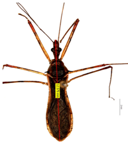
Euagoras plagiatus (Burm.)