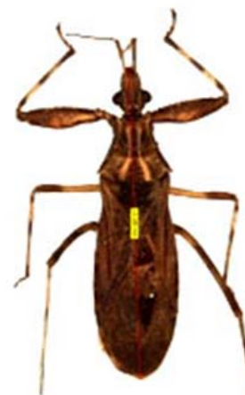
Oncocephalus schioedtei Reuter