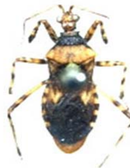
Emphyrocoris pelia Distant