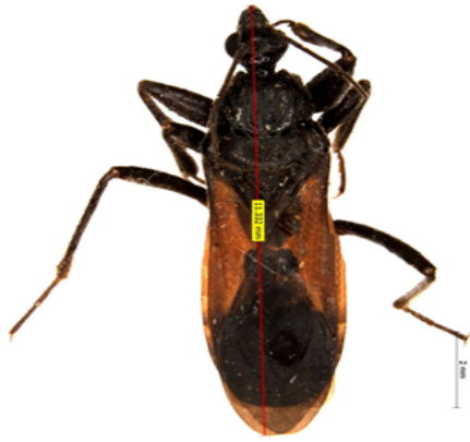
Cleptocoris lepturoides (Wolff)