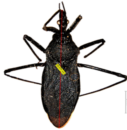
Rhynocoris squalus (Distant)