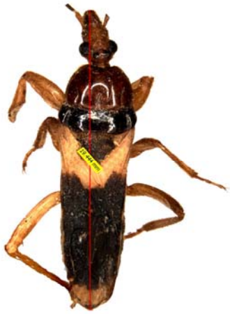
Sirthenea flavipes (Stal)