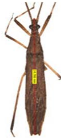
Sastrapada baerensprungi (Stål)