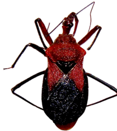
Rhynocoris marginatus (F.)