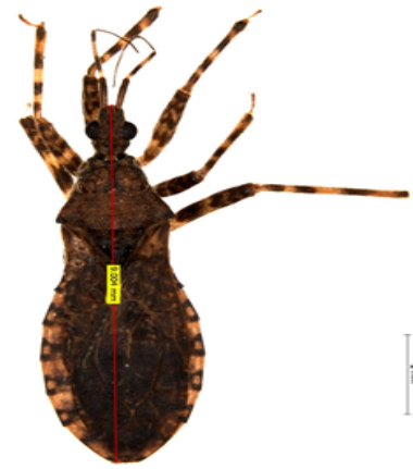
Lisarda annulosa Stal