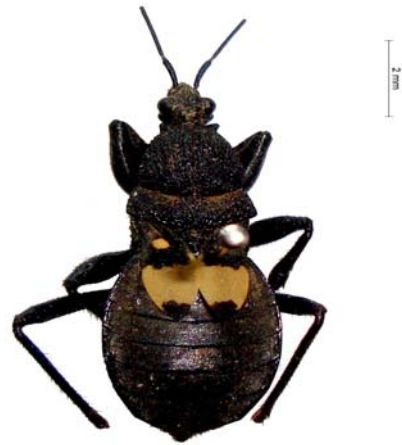
Catamiarus brevipennis (Serv.)