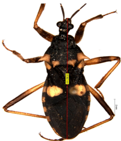
Acanthaspis quinquespinosa (Fabr.)