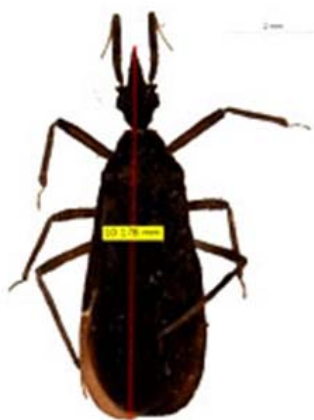
Tribelocephala indica (Walker)