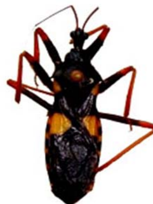
Acanthaspis fulvipes (Dallas)