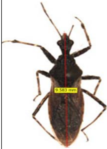
Coranus siva Kirkaldy