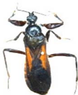
Cleptocoris atromaculatus Stål