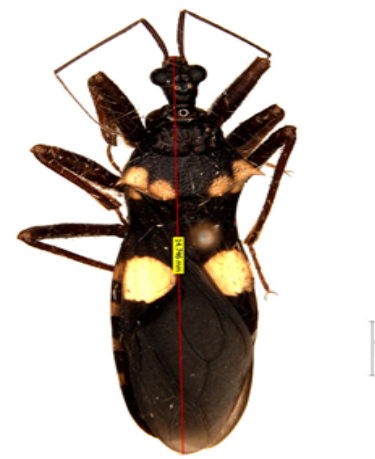
Acanthaspis flavipes Stal