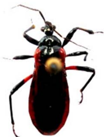
Ectrychotes dispar Reuter