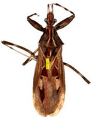
Oncocephalus impudicus Reuter